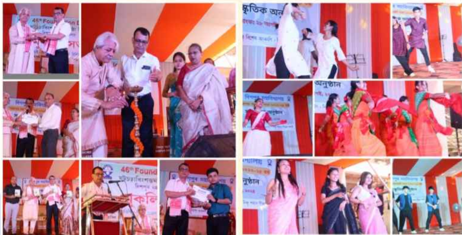
46th Foundation Day Celebration