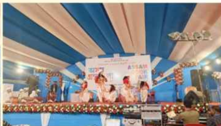
Dispur College Students Performing in Assam Book Fair at Khanapara