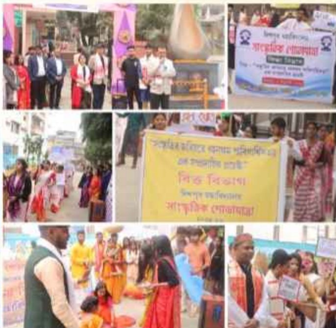
College Week celebration