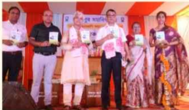
Book Release by our student on occasion of 46 th Foundation Day

The examination modalities of GU-FYUGP will be as per GU's Examination Ordinance in consonance with the UGC/AICTE/Other regulators.