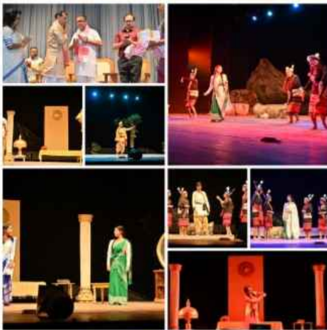
"Karengar Ligiri" Drama performed by our students at Srmanta Sankardev Kalashetra