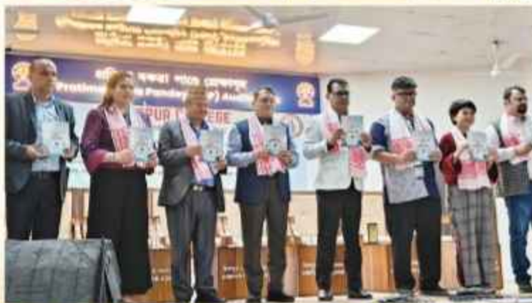
South-East Asian Cultural Confluence 2024 held at PBB Auditorium