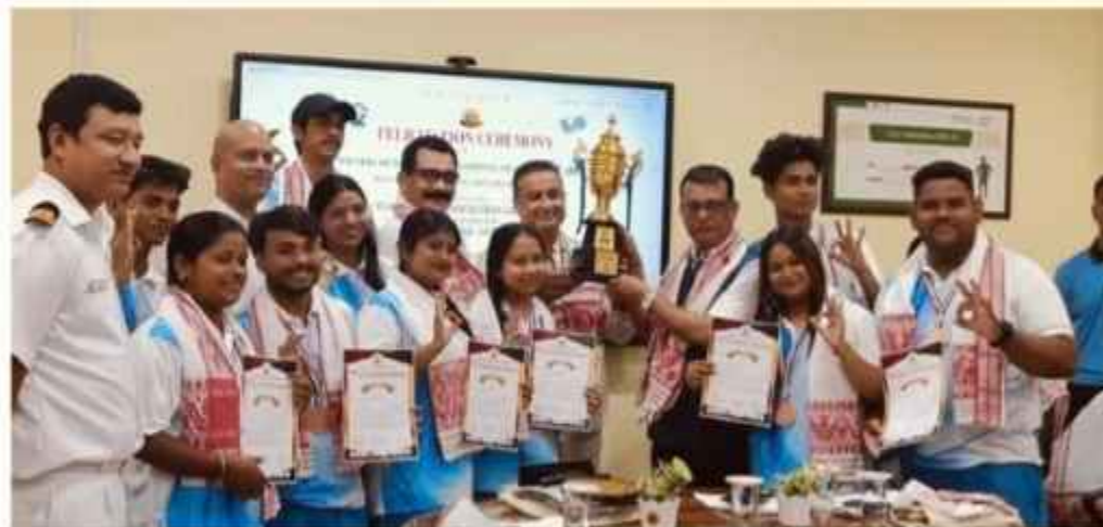
Felicitation to our students for their excellent performance at 19th National Woodball Championship held in Nagpur