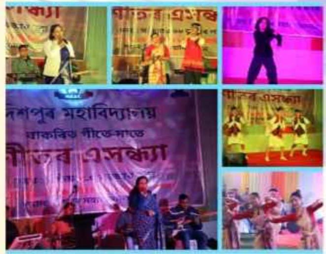
গীতে-মাতে শীতৰ এসক্সা অনুষ্ঠান