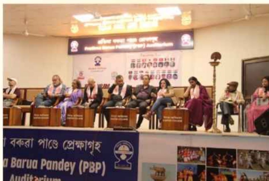
International Writers Meet at PBB Auditorium