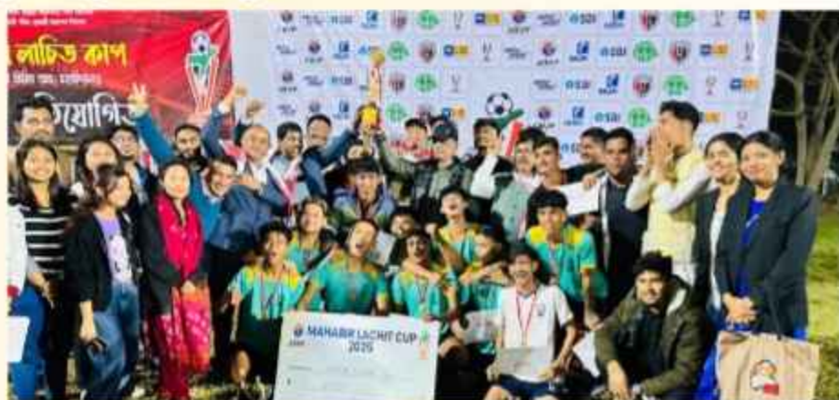
Dispur College students won the Inter District and Inter College Mahavir Lachit Cup football championship