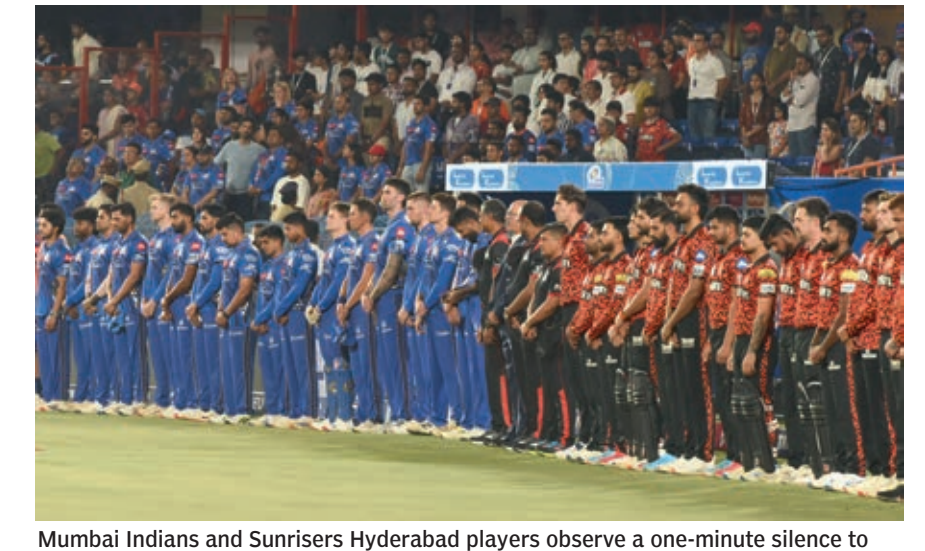
pay tribute to the victims of the terrorist attack in Pahalgam, before the start of their IPL match in Hyderabad on Wednesday.

"I think leaving pitch, you can see that we scored over 80 runs in nine overs. From there we lost the momentum a bit. We had the momentum and we should have taken advantage of that," he said.