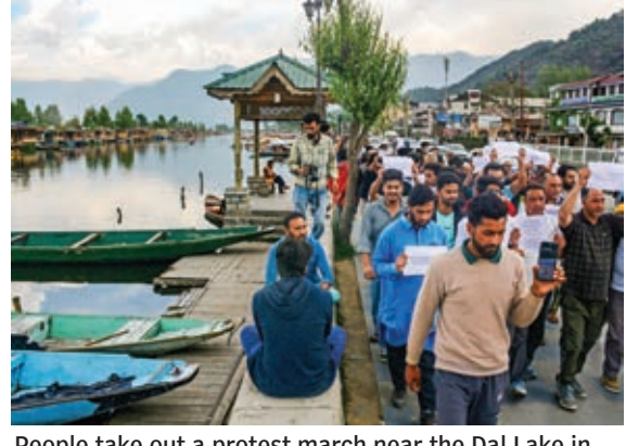
People take out a protest march near the Dal Lake in Srinagar on Wednesday against the Pahalgam terror

spared." Later Mr Shah reached Baisaran by helicopter, where he was briefed by the security forces' officials on the outcome of Turn to Page 4