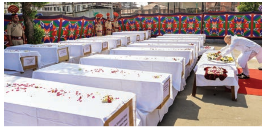
Union home minister Amit Shah pays his last respects to 26 people killed in the Pahalgam terror attack in Jammu and Kashmir on Wednesday.

With the move to pause the IWT, India will now be able to regulate the flow of water from the Indus, Jhelum and Chenab and their tributaries to Pakistan. Announcing the other CCS decisions at a special late-evening min-