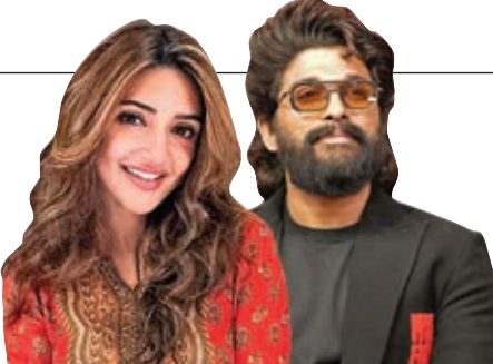
Vol. 32 No. 67 | 16 pages | ₹5.00