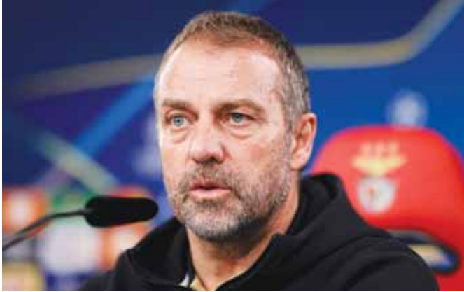
Barcelona's coach Hans Flick.

we have to strive for the best performance. We're going for it. "The quality of the team is good and we can beat anyone even if the players don't get the optimal rest." Barcelona duo Raphinha and Ronald Araujo will be unavailable on Thursday as they played for Brazil and Uruguay respectively in World Cup qualifiers. "They won't play or be in the team. They're out. The flight is long and it's not the most optimal situation. They have to train," Flick said. "They have to recover and train, and then we'll see on Sunday. But the team is fantastic, and we have to fight for the three points. When we win and get three more points, it will be the best reaction we can give." Barca host Girona in La Liga on Sunday. Flick said Pau Cubarsi is also unavailable and will require "three days of recovery", however Eric Garcia, Inigo Martinez and Robert Lewandowski will play against 14th-placed Osasuna. Barcelona, who are level on 60 points with second-placed Real Madrid, face a packed schedule over the next 20 days, with seven matches across La Liga, the Copa del Rey and the Champions League but Flick said it was not a huge challenge for them. "I've spoken to the rest of the staff and the physios ... and we've talked about what we can do to help the players recover better," the 60-year-old said. "They've told me they're fit, fine. Playing every three days isn't a big deal for them and I believe them."