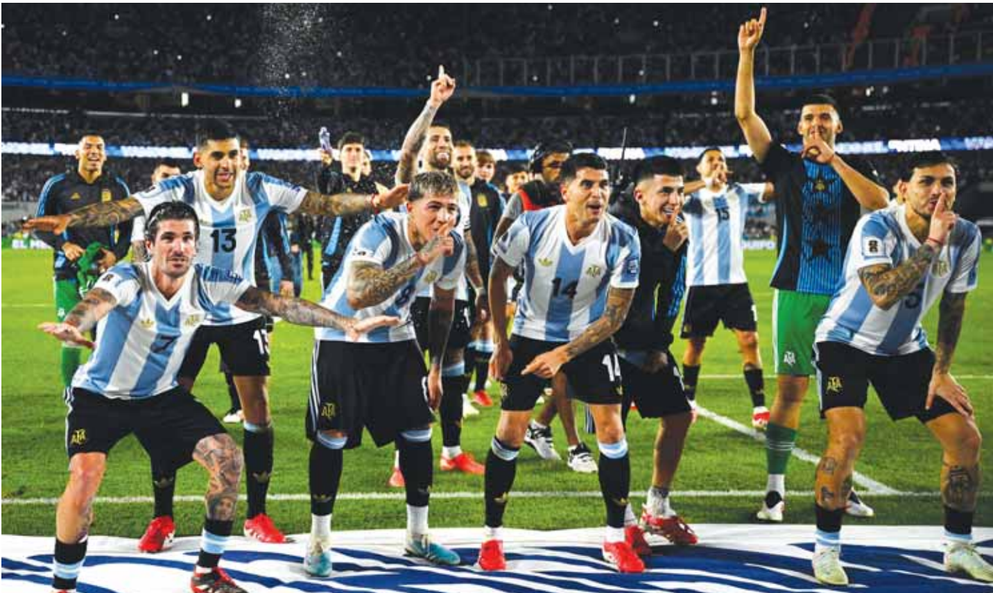
Argentina players celebrate their victory in the 2026 FIFA World Cup South American qualifiers match against Brazil at the Mas Monumental stadium in Buenos Aires province.

Argentina celebrated their 2026 World Cup qualification with a dazzling 4-1 thrashing of arch-rivals Brazil in Buenos Aires on Tuesday. Julian Alvarez, Enzo Fernandez, Alexis Mac Allister and Giuliano Simeone sealed an emphatic win for the world champions, who had been assured of their World Cup berth after Bolivia's 0-0 draw with Uruguay earlier Tuesday. That goalless stalemate ensured a festive atmosphere at the Estadio Monumental before a ball had been kicked and Argentina kept the party going with a blistering performance. Atletico Madrid forward Alvarez opened the scoring after just six minutes, latching onto Thiago Almada's through ball and dinking a close-range finish past Brazil goalkeeper Bento. It got better for Argentina six minutes later when Chelsea's Fernandez tucked away the hosts' second goal of the night after Brazil's back four failed to deal with a low cross. With Brazil being run ragged by a rampant Argentina, they were thrown a lifeline on 26 minutes after a blunder by Cristian Romero gifted a goal to Mattheus Cunha. Tottenham defender Romero was caught in possession 25 yards from goal, allowing Cunha to steal in and drive a low shot past Emiliano Martinez to make it 2-1. But