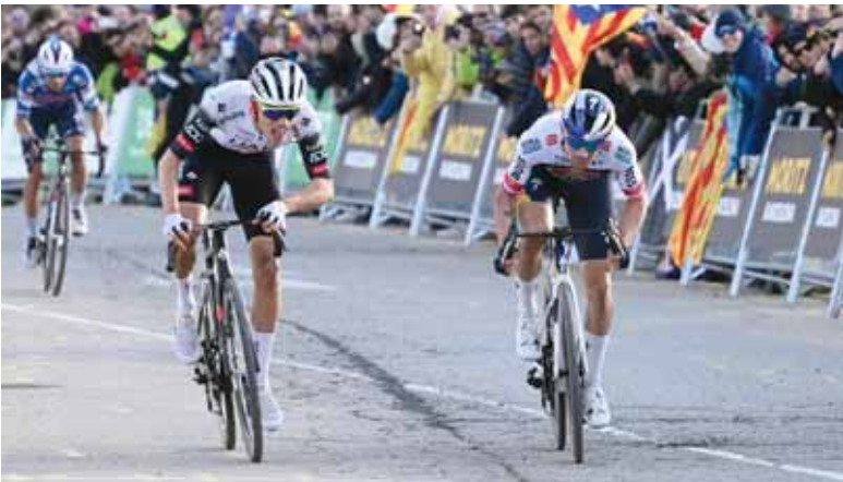
Team UAE’s Juan Ayuso (centre) and Team Bora’s Primož Roglic (right) sprint to cross the finish line in first and second place respectively followed by Team Soudal-Quick Step’s Mikel Landa (left) during the 3rd stage of the 2025 Volta a Catalunya cycling tour of Catalonia yesterday.

Home favourite Juan Ayuso snatched victory on stage three of the Tour of Catalonia fractionally ahead of 2023 winner Primož Roglic and climbed to the top of the general classification yesterday. The UAE Team Emirates rider passed Roglic in the final metres and the Slovenian could not battle his way back in front as they sprinted across the line in a photo finish. Barcelona-born Ayuso triumphed after a gruelling 218-kilometre ride from Viladecans through snow-capped hills to a mountain finish at La Molina. Roglic is second overall, trailing Tirreno-Adriatico winner Ayuso by six seconds, with another Spaniard, Mikel Landa third, 11 seconds off the top. Ayuso and 35-year-old veteran Roglic, a four-time Vuelta a Espana winner, are the leading contenders for the overall classification with reigning champion Tadej Pogacar not competing. “(Winning overall) is the main goal, but here it’s very important to win stages because they also come with bonus seconds and many years this race has been decided by less than 10 seconds,” Ayuso told Teledепorte . The 22-year-old secured 10 bonus seconds after crossing the line in just over five hours 49 minutes, while Roglic took six and Soudal-Quick-Step’s Landa four.