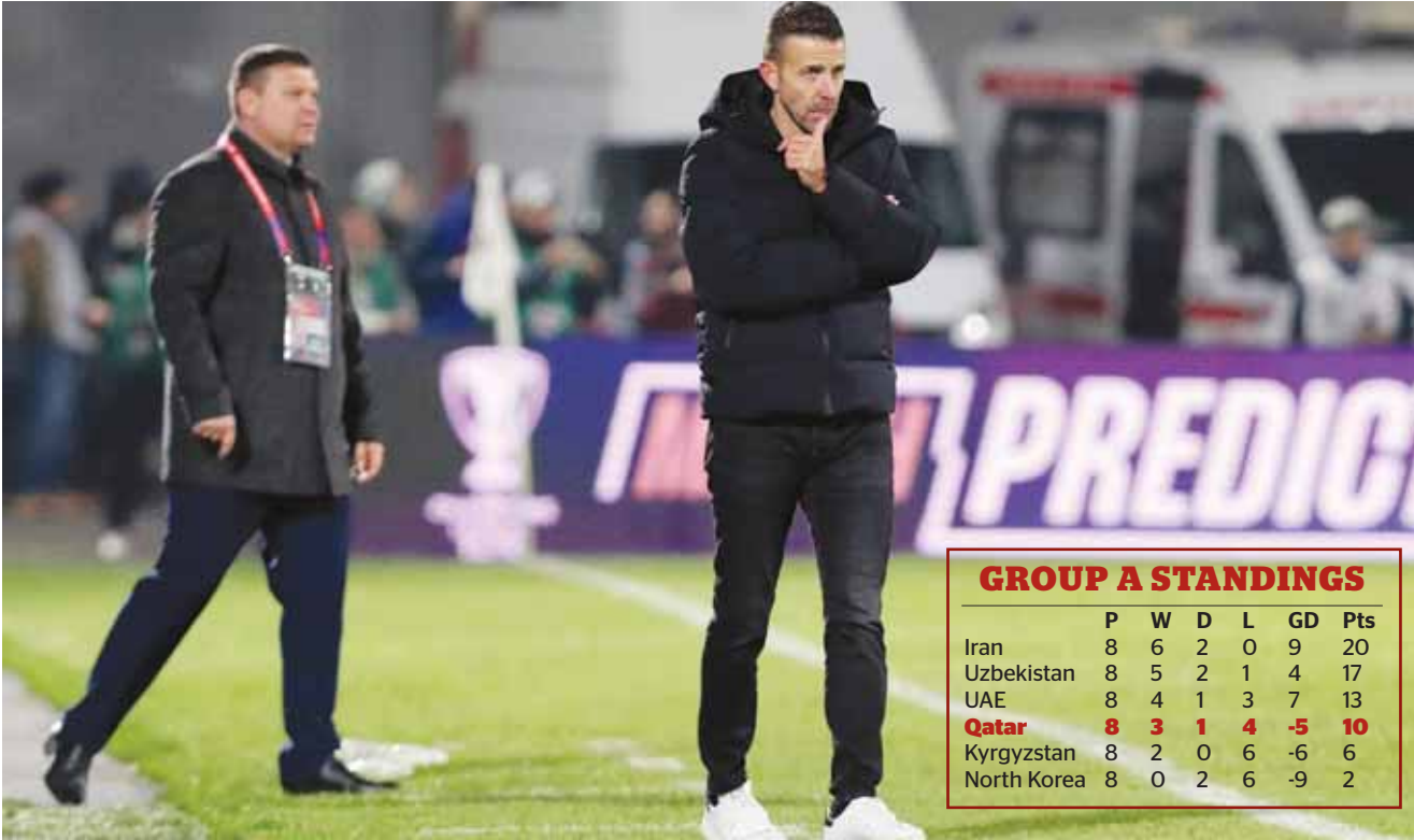
Qatar coach Luis Garcia reacts during the World Cup Asian qualifier match against Kyrgyzstan in Bishkek on Tuesday.