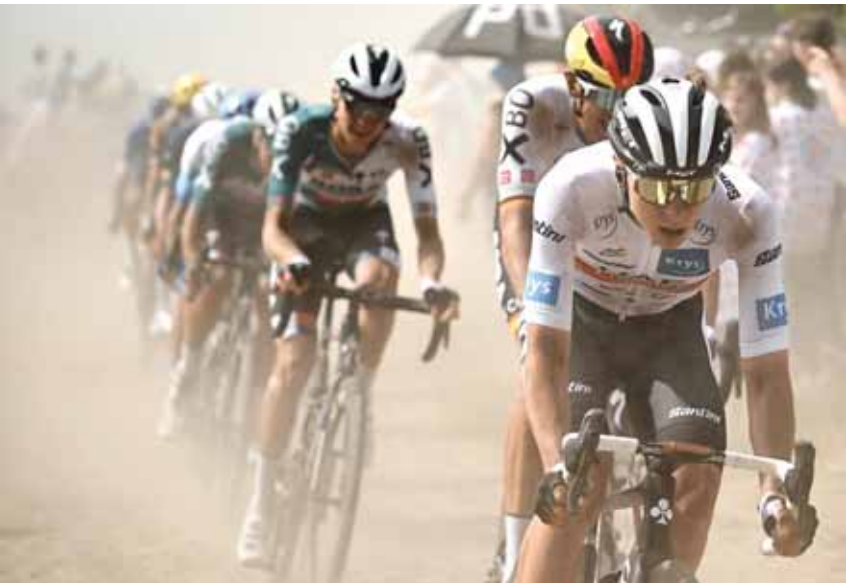
UAE Team Emirates team's Slovenian rider Tadej Pogacar wearing the best young rider's white jersey (right) cycles across a cobblestone sector with the pack of riders during the 5th stage of the 109th edition of the Tour de France cycling race in northern France, on July 6, 2022.