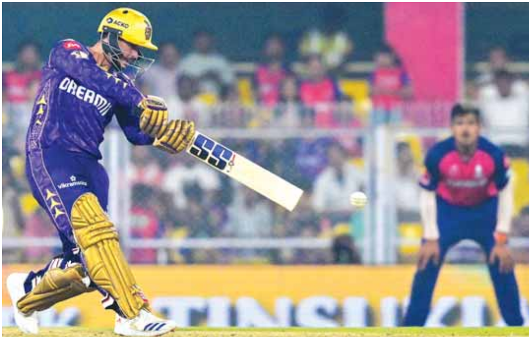
Kolkata Knight Riders' Quinton de Kock (left) plays a shot during the Indian Premier League match against Rajasthan Royals at the Barsapara Cricket Stadium in Guwahati yesterday.

Earlier, Kolkata fast bowler Vaibhav Arora dismissed Sanju Samson, bowled for 13, and Chakravarthy and Moeen soon took two wickets each.