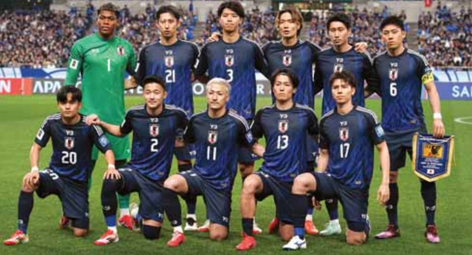
Japan's players pose before the start of the 2026 FIFA World Cup Asian qualification match against Saudi Arabia in Saitama.

League at Brighton. Real Sociedad's Takefusa Kubo is one of the best attackers in the Spanish league. Japan have more strength in depth than ever before but Endo says there is no friction between players competing for starting places. "We all have to think about what's best for the team and everyone understands that," he said. "I think that's a particular strong point among Japanese people. I think Japan are the strongest when it comes to team unity." Japan have often performed best at World Cups when expectations have been low. They narrowly lost to Belgium in the last 16 at the 2018 tournament in Russia just two months after firing their coach. They went to the 2014 World Cup in Brazil confident that they could make a splash but returned home early after a dismal display in the group stage. Defender Yuto Nagatomo, who has played at a record four World Cups, said: "We have improved but if you overestimate your