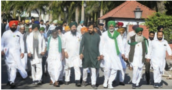
Farmer leaders (above) come out after a meeting with Central ministers in Chandigarh on Wednesday. Farmers, detained at Chandigarh, being taken to the Bahadurgarh commando training centre in Patiala on Wednesday.