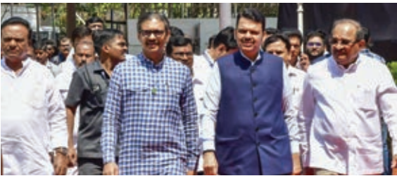
Maharashtra CM Devendra Fadnavis arrives at Vidhan Bhavan during the Budget session of the Assembly in Mumbai on Wednesday.

The Maharashtra chief minister Devendra Fadnavis on Wednesday announced new rules for use of social media by the state government employees. Mr Fadnavis said that few government employees have been found posting messages against the government's policy. He was replying to a calling attention motion, moved by BJP MLC Pranay Fuke in the upper House. The CM said that they will incorporate new rules under Maharashtra Civil Services (Conduct) Rules, 1979 within the next three months.