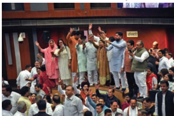
BJP and AAP councillors protest during the Budget Session at MCD House in New Delhi.