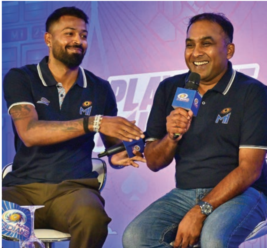
Mumbai Indians captain Hardik Pandya (left) with coach Mahela Jayawardene during a press conference ahead of the Indian Premier League 2025, in Mumbai on Wednesday.

Pandya will miss MI's opening game on Sunday