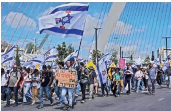
Israelis march in a protest against PM Benjamin Netanyahu and his plans to dismiss the head of the Shin Bet internal security service, on Wednesday.

"Take the advice of the US President. Return the hostages and eliminate Hamas, and other options