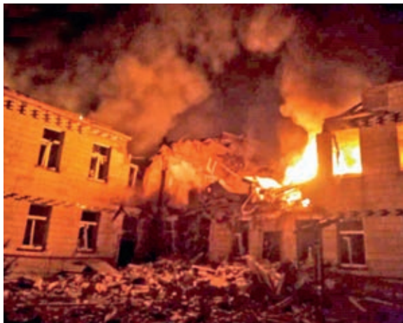
Flames of fire and smoke engulfed a building after a Russian attack in Krasnopillia, of Sumy region, in Ukraine, on Tuesday.

Zelenskyy said on Wednesday that the continued attacks showed Moscow's words did not match its actions, and that Russia was not ready for peace. He said the United States should be put in