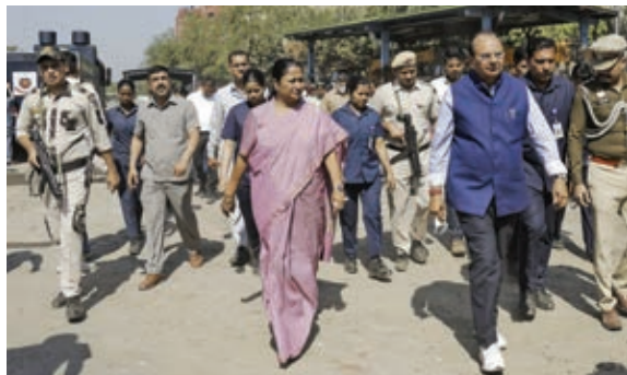
Delhi lieutenant-governor V.K. Saxena and chief minister Rekha Gupta inspect Sunehri Pul drain in New Delhi.

She also said the condition of the water pipelines and leakage is such that almost half of the city is getting water through tankers.