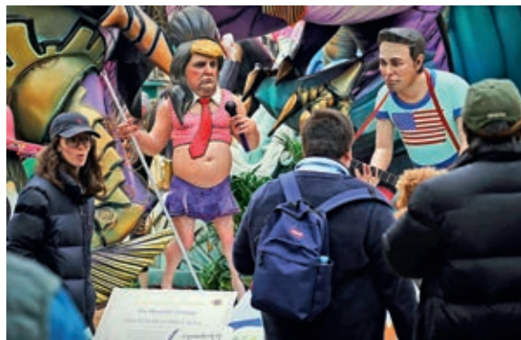
Cardboard sculptures known as 'Ninots' depicting US President Donald Trump and Tesla CEO Elon Musk (R) are displayed during the Fallas festival in Valencia, Spain, on Wednesday. — AP

The FTC is a regulator created by Congress that enforces consumer protection measures. — AP