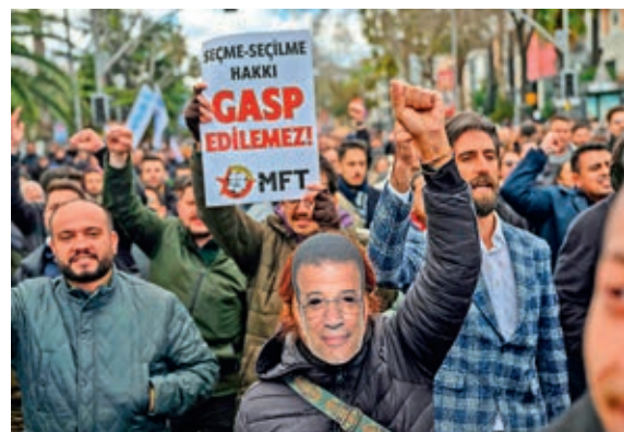
Supporters of the Mayor of Istanbul walk to Istanbul townhall as they demonstrate against his detention over a corruption probe, on Wednesday.

The official described the Israel defence forces' renewed attacks against Hamas in Gaza as a "different form of negotiating."