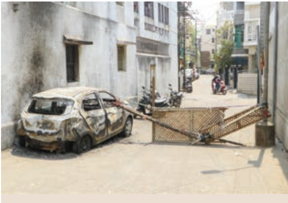
A road closed amid curfew in Hanspuri area in Nagpur on Wednesday.