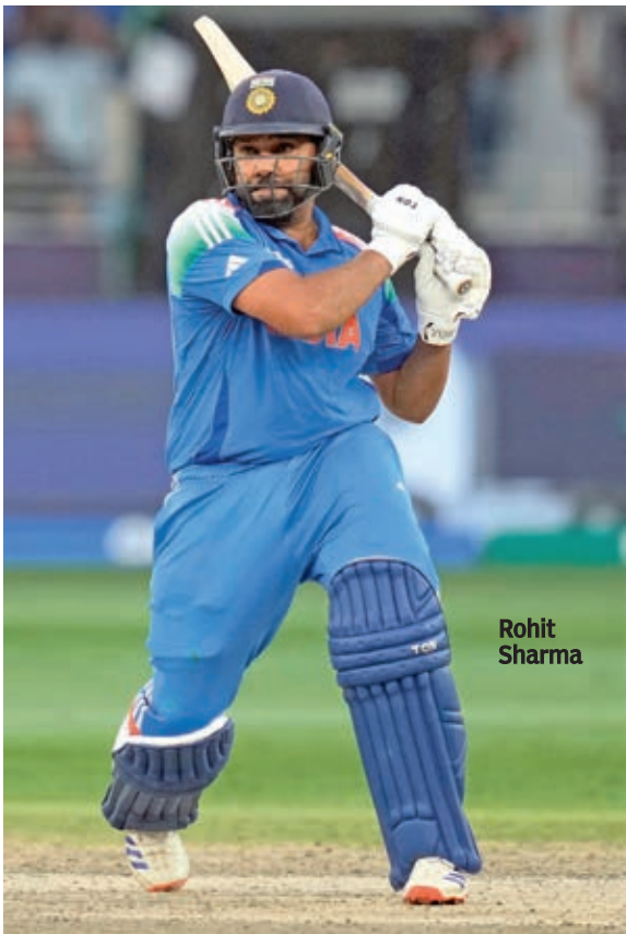
and ICC title — following the T20 World Cup win last year — as India defeated New Zealand by four wickets to win the Champions Trophy here.

Handed the responsibility of captaincy in 2021 at the age of 34, Rohit on Sunday clinched his sec-