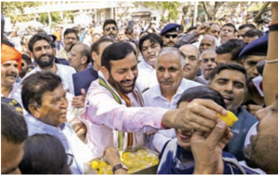
Haryana chief minister Nayab Singh Saini distributes sweets on Wednesday after BJP's mayoral candidates registered victories in seven municipal corporations in Haryana, while its nominees were leading in two other civic bodies in the recently held elections.

Polls to elect mayors and ward members in seven municipal corporations — Gurgaon, Manesar, Faridabad, Hisar, Rohtak,