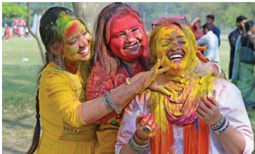
Young women participate in Basanta Utsab in Kolkata on Wednesday.

Addressing a gathering at the event titled, "Manthan: Kumbh and Beyond", organised by RSS-linked weeklies Organiser and Panchjanya , Mr Adityanath said, "I am a Yogi. I respect every sect, community and form of worship. If you visit Gorakhnath Peeth, you will see that there is no discrimination against anyone." — PTI