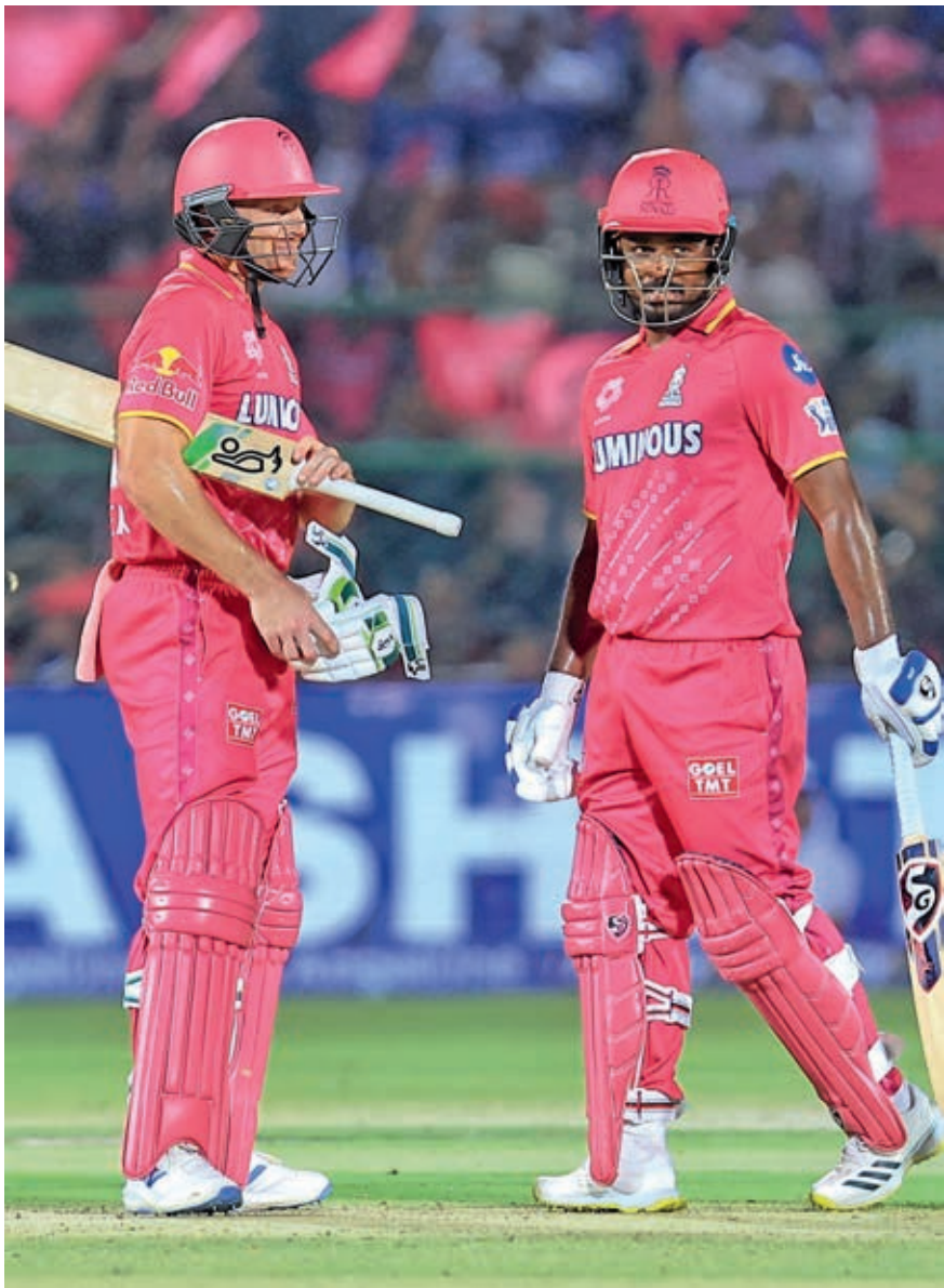
Captain Sanju Samson (right) and Jos Buttler opened batting for Rajasthan Royals for seven years but the Franchise did not retain the Englishman ahead of the mega auction last year.

"He is a top-notch professional and makes sure everything is done properly. I was with him last month in Nagpur at RR's sports academy. From morning 10 o'clock till evening 5 o'clock, he was standing in the heat, watching the batsmen bat and the bowlers bowl, interacting with them, discussing with the coaches. He is absolutely involved in each and everything," he added.