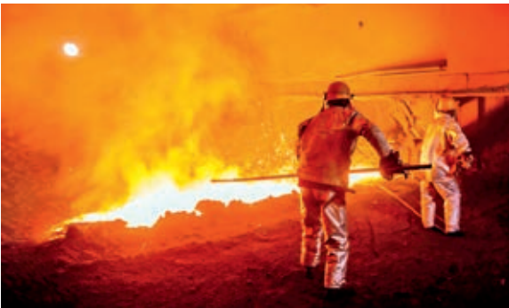
Workers clear slag from the blast furnace at a factory which produces steel for export in Anyang, in China's central Henan province.

Washington, Brussels, London, Oslo, March 12: President Donald Trump's increased tariffs on all US steel and aluminium imports took effect on Wednesday, stepping up a campaign to reorder global trade in favour of the US and drawing swift retaliation from Europe. Trump's action to bulk up protections for American steel and aluminium producers restores effective global tariffs of 25% on all imports of the metals and extends the duties to hundreds of downstream products. The UK reaffirmed its commitment to US trade talks as British exports were swept up in Trump's global steel and aluminium tariffs, breaking with the European Union and its decision to retaliate immediately. The European Commission, the executive arm of the European Union charged with coordinating trade matters, responded swiftly, saying it would impose counter tariffs on up to 26 billion euros ($28 billion) worth of US goods from April. "We are ready to engage in meaningful dialogue," Commission president Ursula von der Leyen said, adding she had tasked trade commissioner Maros Sefcovic to resume his talks with the US. Norway is working to persuade the European Union to exempt it from any broad protective tariff as a response to the US after President Donald Trump kicked off a trade war with levies on metals. Trump's administration hit out at Japan's elevated rice tariffs, signaling that the grain and Tokyo will likely be targeted as the US seeks to apply reciprocal tariffs. — Agencies