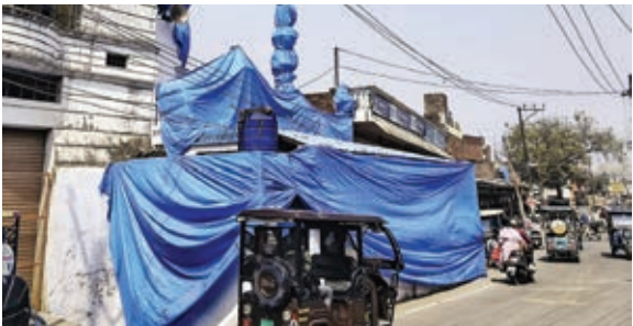
A mosque covered in tarpaulin as prevention against Holi colour, ahead of traditional 'Laat Saheb' procession on Holi in Shahjahanpur, UP, on Wednesday.

"There are 18 Holi processions in the city, including the two major 'Laat Saheb' processions. To ensure security, the larger procession has been divided into three zones and eight sectors, with around 100 mag-