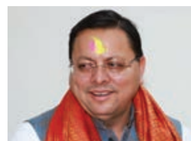
Pushkar Singh Dhami

According to officials of the urban development department, several illegal madrasas were raised in Dehradun as they were constructed without permission from the authorities concerned. As per officials, 12 illegal madrasas were sealed in the Vikasnagar block of Dehradun and nine in Mr