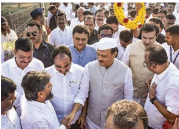
Maharashtra deputy chief minister Ajit Pawar arrives to pay tribute to Maharashtra's first chief minister Yashwantrao Chavan on his birth anniversary in Karad on Wednesday.

"Historians, after intensive research, have proven that Muslims were indeed