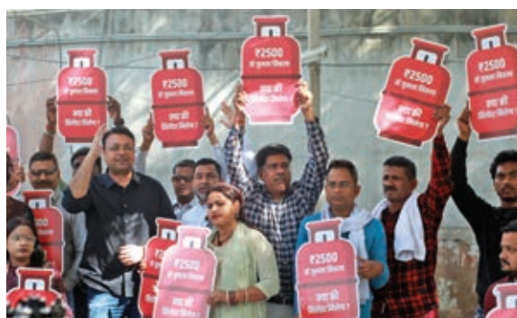
AAP workers during a protest against the BJP government in New Delhi on Wednesday.

"During the address of the L-G (V.K. Saxena), sloganeering was done by MLAs of the Opposition and the ruling party. The Opposition raised slogans