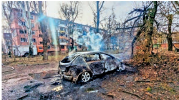
A burnt car and damaged residential buildings are seen after a Russian missile hit the area, in Kryvyi Rih, Ukraine, on Wednesday.

Jeddah, March 12: The United States agreed to resume military aid and intelligence sharing with Ukraine after Kyiv said it was ready to support Washington's proposal for a 30-day ceasefire with Russia, the countries said in a joint statement. After more than eight hours of talks with Ukrainian officials in Jeddah, Saudi Arabia, US secretary of state Marco Rubio said the US would now take the offer to Russia, and the ball is in Moscow's court. "Our hope is that the Russians will answer 'yes' as quickly as possible, so we can get to the second phase of this, which is real negotiations," Rubio told reporters. The Kremlin launched a full-scale invasion of Ukraine three years ago. Moreover, Russia, which has been making rapid advances, now holds around a fifth of Ukraine's territory. This incidentally includes Crimea, which it annexed in 2014. Rubio said Washington wanted a full agreement with both Russia and Ukraine "as soon as possible." "Every day that goes by, this war continues, people die, people are bombed, people are hurt on both sides of this conflict," he said. — Reuters