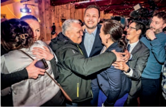
Chairman of Demokraatit, Jens-Frederik Nielsen (C) celebrates during the election party at Demokraatit by cafe Killut in Nuuk, on Wednesday. — AP

Nuuk, March 12: A party that favours a gradual path to Greenland's independence from Denmark won a surprise victory in parliamentary elections, held in the shadow of US President Donald Trump's stated goal of taking control of the island one way or another. The centre-right Demokraatit Party has pushed back against Trump's rhetoric, saying it is for Greenlanders to decide the future of the strategically important territory, which holds large reserves of rare minerals needed to make everything from mobile phones to renewable energy technology. The Arctic island is also home to a US air base and straddles strategic air and sea routes in the North Atlantic. "The result should send a clear message to Trump that Denmark is not for sale," Demokraatit leader Jens-Friederik Nielsen said. "We don't want to be Americans. No, we don't want to be Danes. We want to be Greenlanders. And we want our own independence in the future. And we want to build our own country by ourselves." — AP