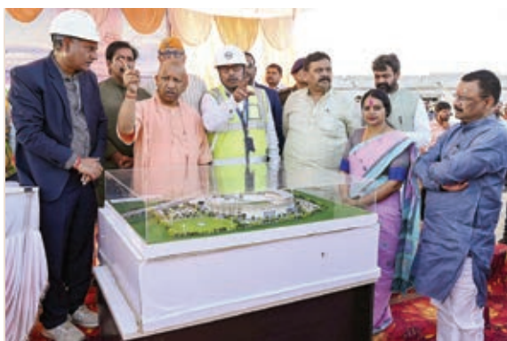
Uttar Pradesh chief minister Yogi Adityanath during inspection of the under-construction Varanasi International Cricket Stadium on Wednesday.

"Sambhal has been mentioned in scriptures that are 5,000 years old. They contain references to Lord Vishnu's future incarnation, Islam, on the other hand, emerged only 1,400 years ago. I am talking about something that pre-