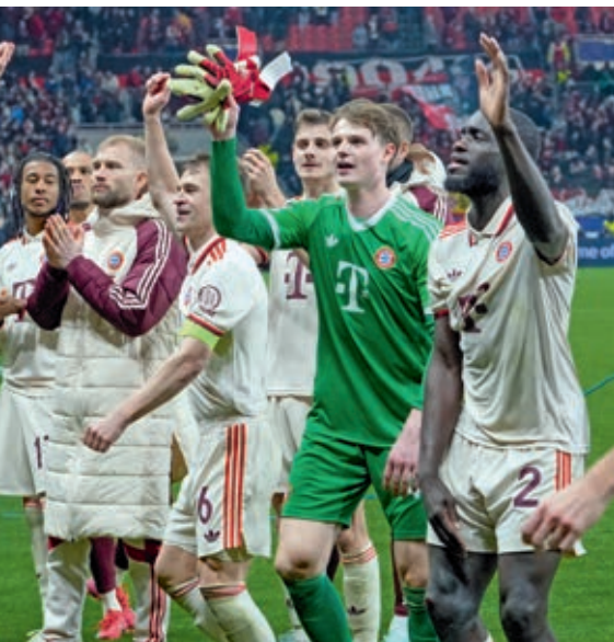
Bayern Munich players celebrate at the end of the Champions League Round of 16 second leg match against Bayer Leverkusen at the BayArena in Leverkusen, Germany, on Tuesday.