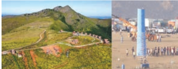
Crew members (right) of S.S. Rajamouli at the foothills of Deomali preparing for the shoot of SSMB 29 in Odisha's Koraput district.

Odisha's picturesque Koraput district is set to become the latest hotspot for Indian cinema as legendary filmmaker S.S. Rajamouli gears up for the shoot of his much-anticipated film, SSMB 29. Starring South Indian superstar Mahesh Babu, this upcoming cinematic spectacle has already generated massive buzz, not just for its star-studded cast but also for its choice of location. Mr Rajamouli's team has been meticulously scouting for breathtaking locations for the action-packed adventure film, and Koraput's mesmerising landscapes, with its towering hills and lush greenery, have captivated their imagination. Impressed by the region's raw and untamed beauty, Mr Rajamouli personally visited Koraput and finalised it as one of the primary