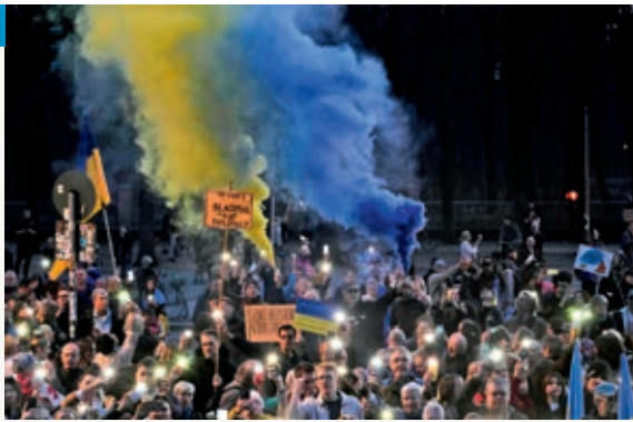
People hold up cellphone lights during a demonstration against Russia's war on Ukraine in Berlin.

February 18: Initial Russia-US talks over Ukraine war were held in the Saudi capital Riyadh.