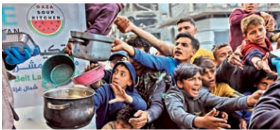
Displaced Palestinian children push into a queue to get a portion of cooked food from a charity kitchen in Beit Lahia in the northern Gaza Strip. — AFP

The first phase of the truce deal expired on March 1 with no agreement on subsequent stages that should secure a lasting end