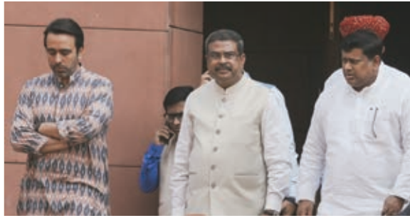
Union ministers Dharmendra Pradhan, Jayant Chaudhary and Sukanta Majumdar during the Budget Session of Parliament in New Delhi on Monday.

Mr Stalin told Mr Pradhan, who ignited the second bout of angry exchanges between the BJP and state leaders over the implementation of the National Education Policy (NEP) by derogating Dravidian Munnatra Kazhagam (DMK) MPs on Monday, three weeks after he first triggered the controversy, in no uncertain terms that he had insulted the people of Tamil Nadu. Though Mr Pradhan had