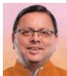
Pushkar Singh Dhami

Uttarakhand chief minister Pushkar Singh Dhami on Monday directed the state vigilance department to crack down on black marketing of helicopter tickets during the Char Dham season. The Char Dham pilgrimage will begin with the opening of the portals of the Yamunotri and Gangotri shrines on April 30. "The vigilance department should remain alert and keep strict vigil on black marketing of helicopter tickets during the upcoming Chardham Yatra. The police must bust rackets or nab those involved in such malpractices and take strict action against them," the chief minister told senior officials at a high-level meeting. He also asked tourism minister Satpal Maharaj to take stock of the ongoing preparation of the yatra to the Gangotri, Yamunotri, Badrinath, and Kedarnath shrines. The CM ordered officials to ensure only single-use plastic items are sold and adequate pink toilets are set up, with key priority given to cleanliness. He also directed secretaries and senior police officers to conduct a field inspection by March.