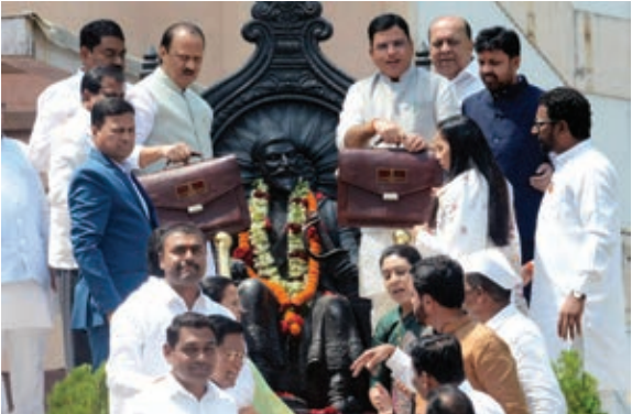
Maharashtra deputy chief minister Ajit Pawar while presenting the Maharashtra government's budget for the 2025-26 fiscal on Monday.