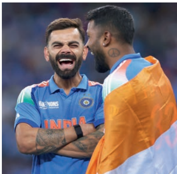
Virat Kohli (left) and Hardik Pandya share a laugh during the Champions Trophy presentation ceremony in Dubai on Sunday.

The experience of Rohit and K. L. Rahul towards