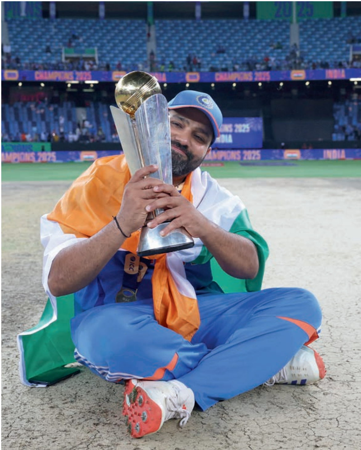
India captain Rohit Sharma poses with the winners trophy on the Dubai International Stadium pitch after defeating New Zealand in the final of the ICC Champions Trophy in Dubai on Sunday.

The PCB has rejected this explanation and noted that the ICC had made a number of errors during the tournament regarding Pakistan's status as host nation. This included changing the CT2025 logo in the live broadcasts feed of the India versus Bangladesh game and then playing the Indian national anthem in the Australia versus England match in Lahore. — PTI