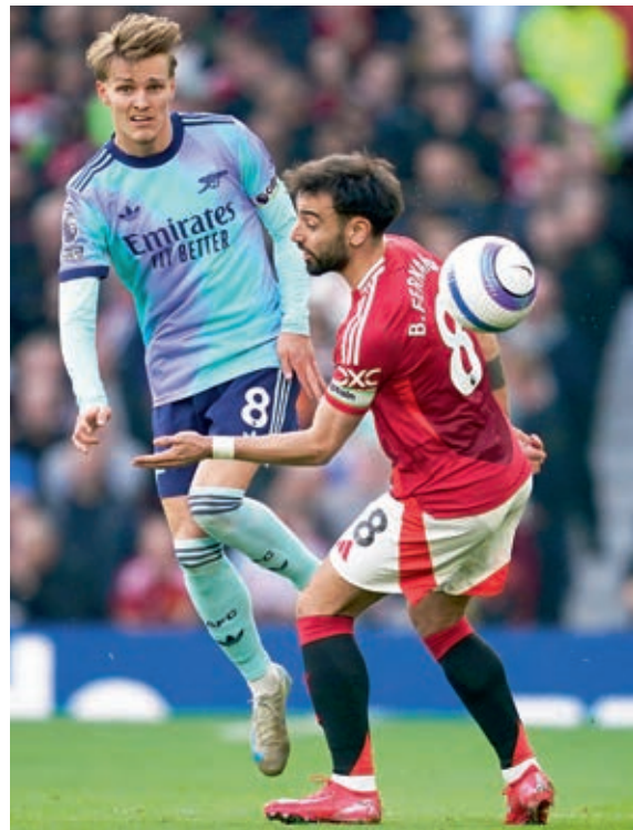
Arsenal's Martin Odegaard (left) and Manchester United's Bruno Fernandes vie for the ball during the English Premier League match at Old Trafford Stadium in Manchester, England, on Sunday.