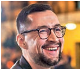
Mute Bourup Egede

As it outlines plans for its COP30 presidency,