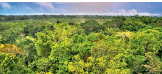
A view of the Amazon forest in Brazil which will host the COP30 in the city of Belém later this year.

Brazil is setting out to not only counter deforestation, but also scale up climate finance and elevate