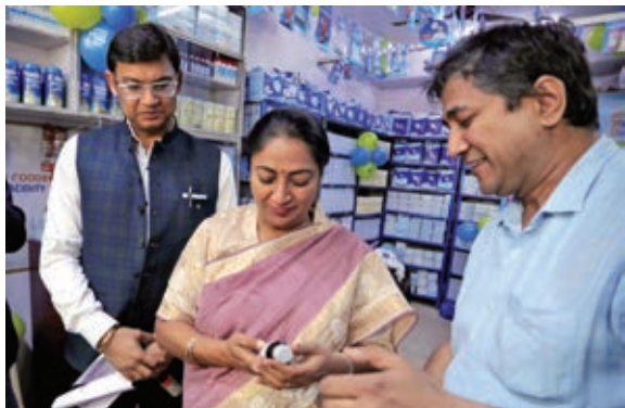
Delhi chief minister Rekha Gupta during her visit to n Jan Aushadhi Kendra in New Delhi on Friday.

"This is not a post, it is a job and a responsibility.