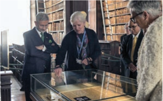
External affairs minister S. Jaishankar during his visit to Trinity College in Dublin on Friday.