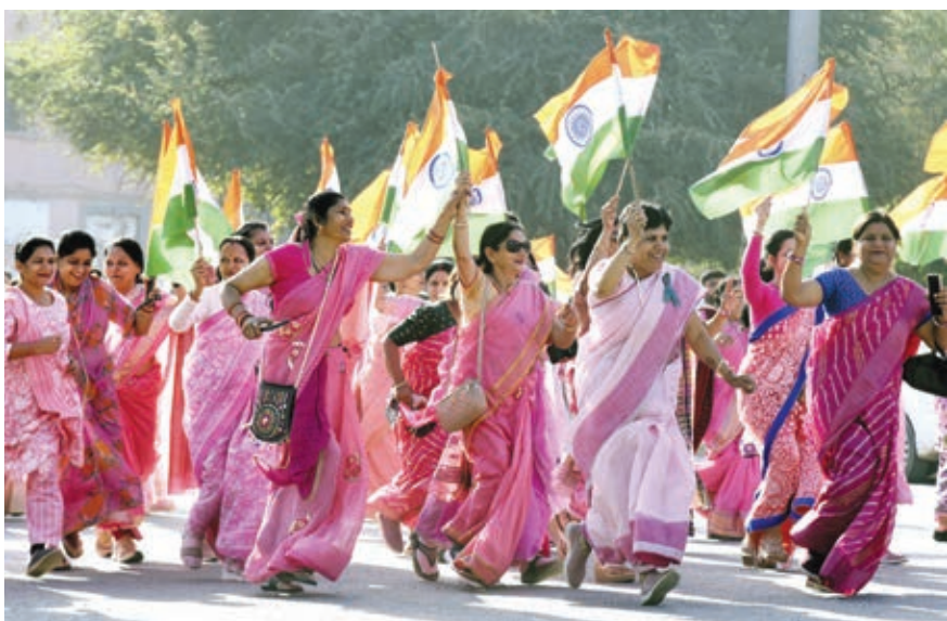
Women take part in a walkathon on the eve of the International Women's Day in Bikaner on Friday.

Turning the tables on chief minister M.K. Stalin, who has been running a campaign against