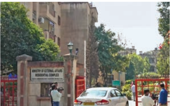
A view of the MEA residential complex after an IFS officer ended his life allegedly by jumping from a building in Chanakyapuri on Friday.

The ministry of external affairs (MEA) said one of its officers, who was work-