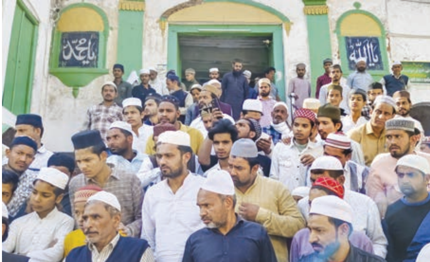
Devotees leave after offering namaz at the Shahi Jama Masjid during the holy month of Ramzan in Uttar Pradesh's Sambhal district on Friday.

■ I hope you negotiate, if we have to go in militarily, it'll be a terrible thing: US Prez in letter