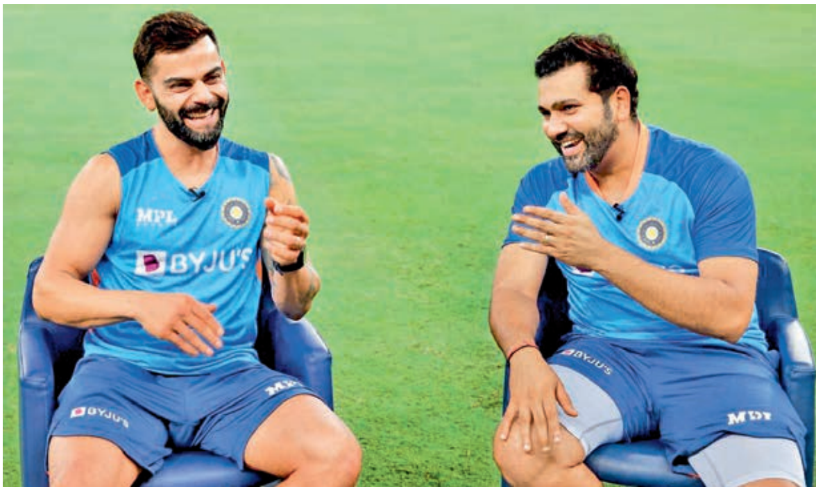
Virat Kohli (left) and Rohit Sharma share a light moment during a post-game chat in this file photo.

HENRY INJURY DOUBT In front of them lies a New Zealand team hoping to win the tournament for the second time, having done so in 2000. The Black Caps powered into the final by beating South Africa by 50 runs in Lahore. But the victory came at a price with an injury to pace bowler Matt Henry after he landed on his shoulder awkwardly while taking a catch. Henry, who took 5 for 42 against India in the group phase, is in a race to be fit for Sunday. "Still a little bit unknown at this stage," head coach Gary Stead said. — AFP