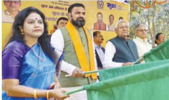
Bihar Chief minister Nitish Kumar, Union minister Lalan Singh and deputy CM Samrat Choudhary at an event in Patna on Friday.

The surge in visits of the “Hindutva icons” and spiritual leaders ahead of the Assembly polls in Bihar all but indicates the NDA strategy against the Opposition Mahagathbandhan. The political battle for Bihar will have Hindutva overtones. First to arrive was Bageshwar Dham sarkar Dharendra Krishna Shastri, who reached the poll-bound state to “awaken Hindus”. Then The Art of Living's Sri Sri Ravishankar visited to raise the issue of “yuva kaushal vikas” and provide skills to the youth. Besides, RSS chief Mohan Bhagwat is already on a