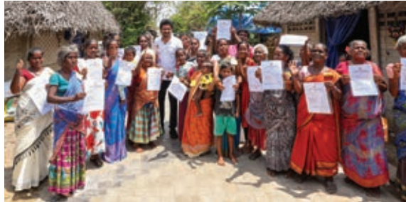
Tamil Nadu deputy chief minister Udhayanidhi Stalin during the distribution of house site pattas in Tamil Nadu's Tiruvurur district on Friday.

Mitra was founded in 2022 when Mr Shinde was chief minister.