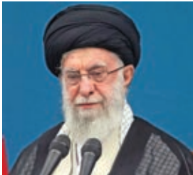
Ayatollah Ali Khomeini

terday” in the interview, which was filmed on Thursday. The White House confirmed Mr Trump's comments, saying that he sent a letter to Iran's leaders