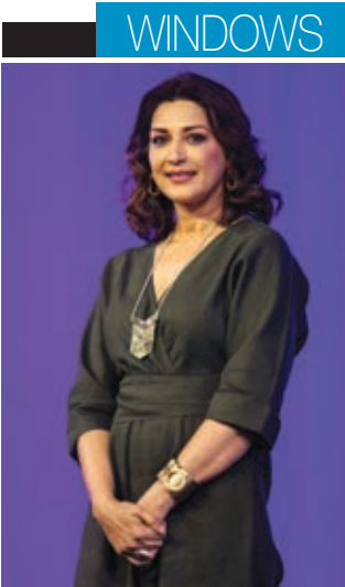
Actress Sonali Bendre during an event on the eve of International Women's Day in Bengaluru on Friday.