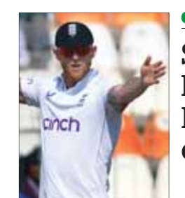
CRICKET | Page 2 Stokes on the list of potential England captains: Key