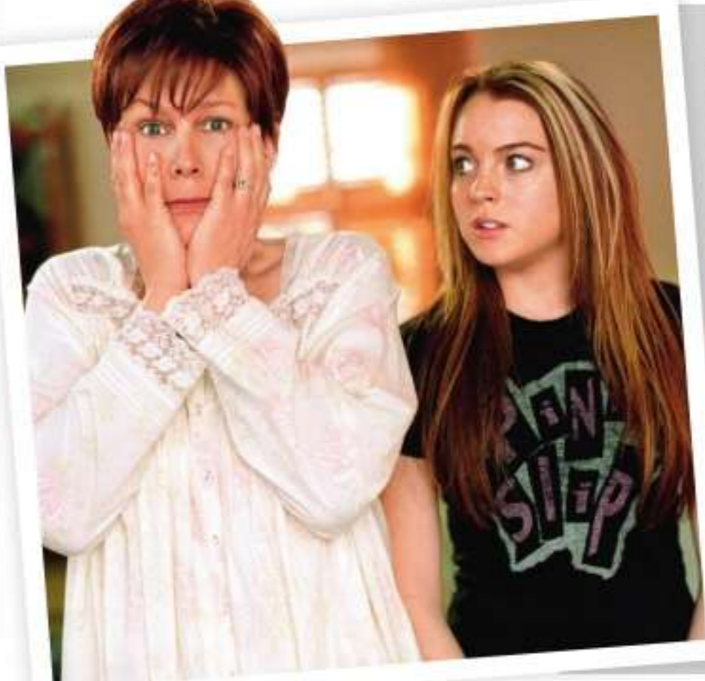
In Freaky Friday , a feuding mother and daughter switch bodies for a day and have to learn what life is like for each other before switching back. The sequel, Freakier Friday , will see Anna and Tess endure another body swap crisis, but this time with a pair of 14-year-old girls. The film is expected to hit the theatres in August