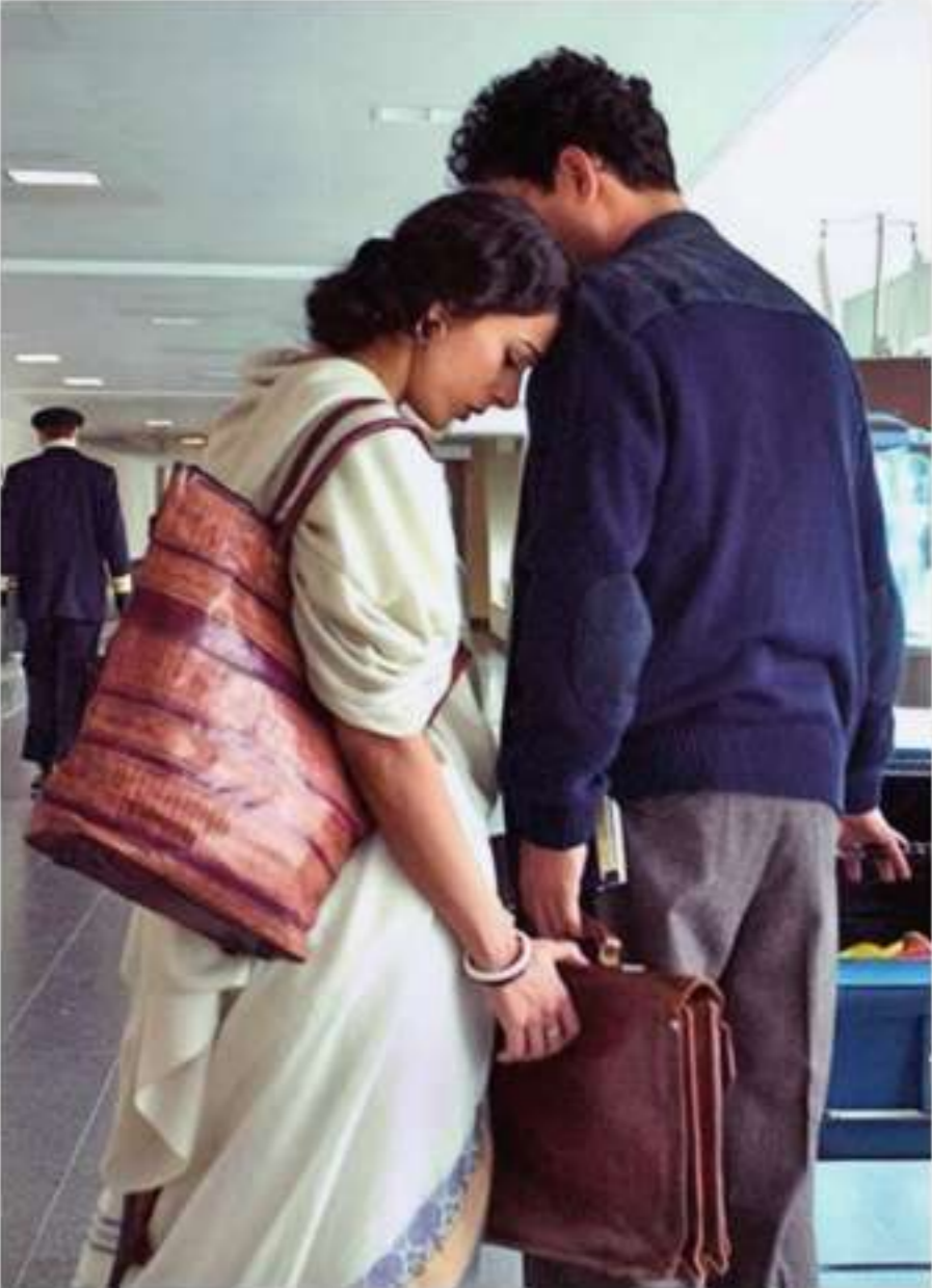
Mira Nair's The Namesake (2006), based on the novel by Jhumpa Lahiri, explores themes of migration, cultural displacement, and the struggle to find one's identity in a foreign land