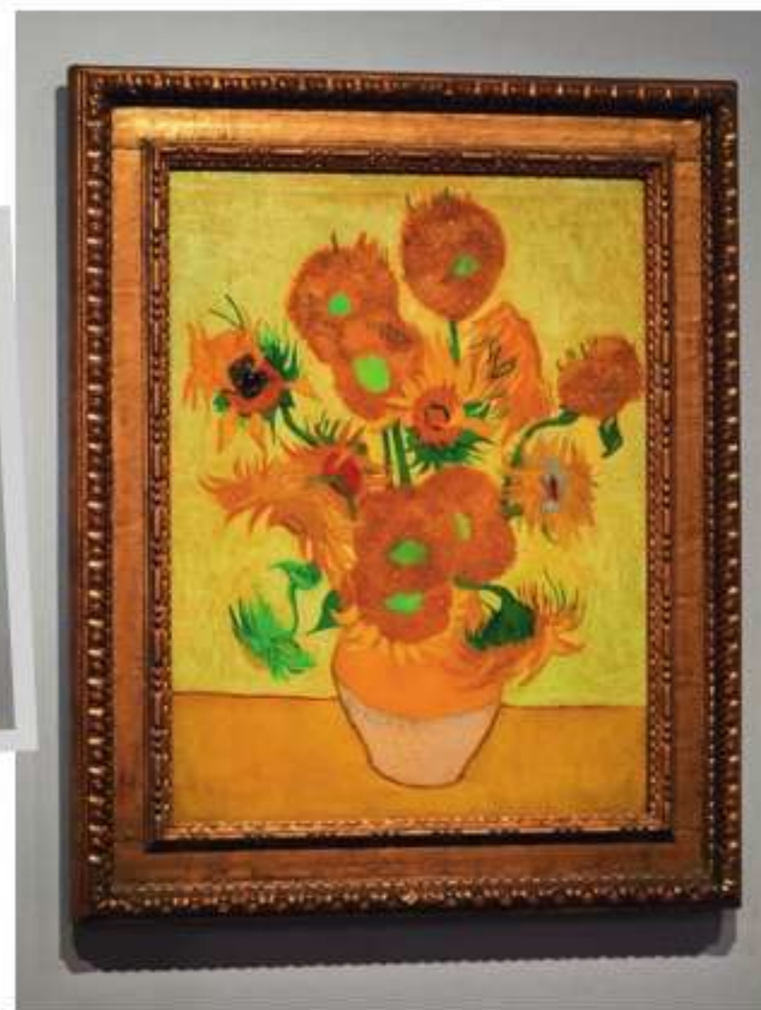
Comprising 2,615 pieces and complete with adjustable petals, the build-your-own Sunflowers is smaller than the painting that inspires it, but still takes many hours to build