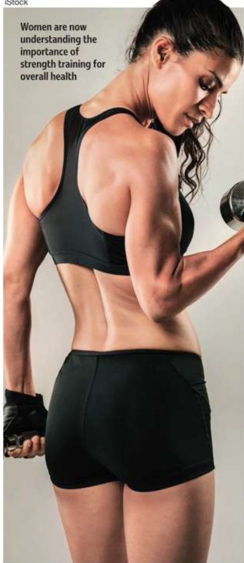
Women are now understanding the importance of strength training for overall health