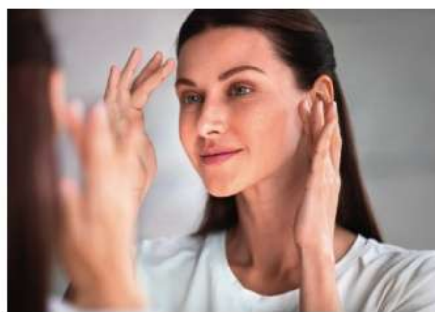
substantial misperception of what men and women predict the opposite sex to desire in terms of sexual dimorphism of face shape."

According to news reports, the study authors concluded, "We have demonstrated a