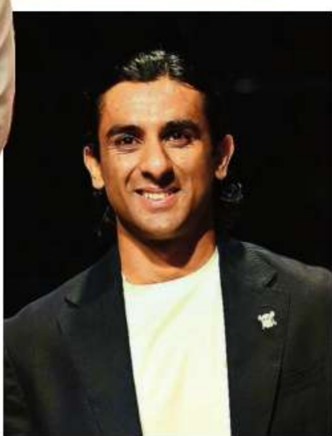
Sawai Padmanabh Singh of Jaipur