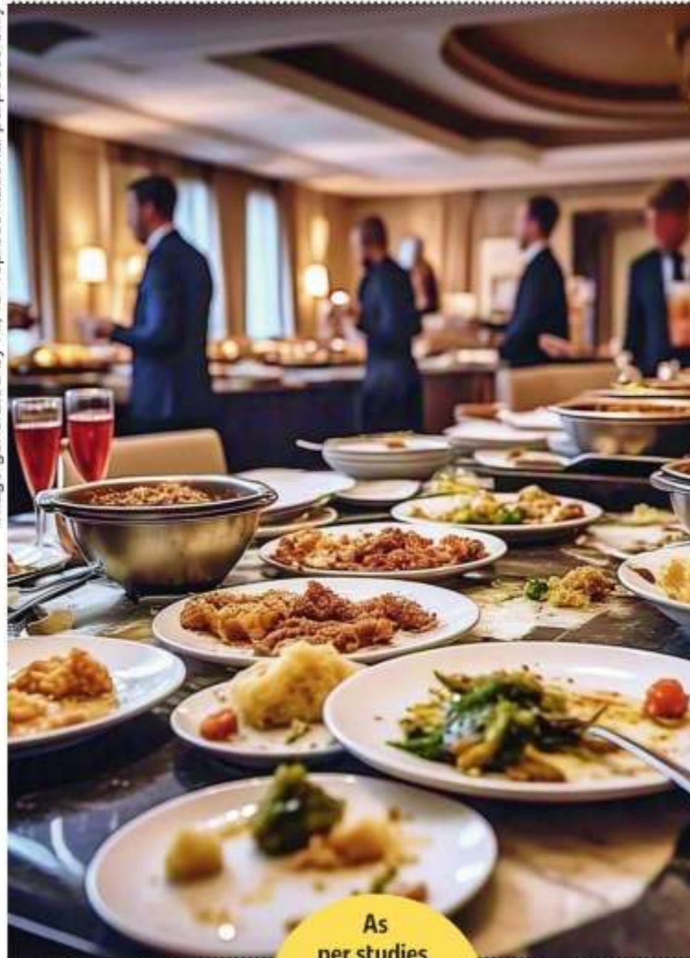
Image generated by AI, for representational purposes only

92g (weekends), while vegetarian buffets waste 133g (weekdays) and 62.5g (weekends). Weekend waste is lower due to better forecasting and higher demand. • A Poland study showed nearly 75% of waste occurs in the serving area, half of which was from plate waste. Breakfast buffets generate the highest plate waste, while à la carte restaurants have the least.