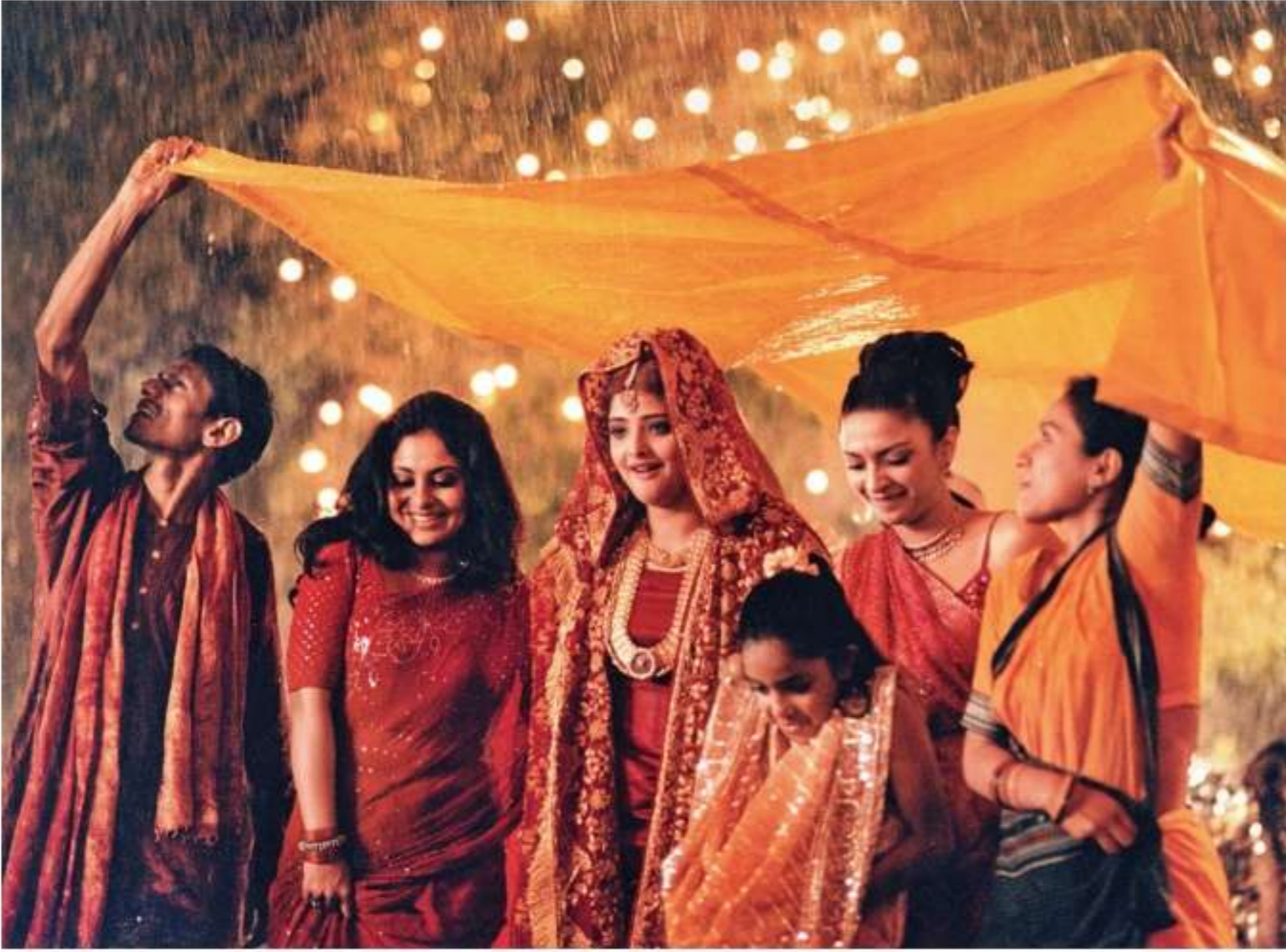
Monsoon Wedding (2001), directed by Mira Nair, is a vibrant drama that explores family dynamics, love, and tradition against the backdrop of a grand, chaotic Punjabi wedding in Delhi - a city she says she feels the most rooted in

When asked if she would make The Namesake today, nearly 18 years later, with everything happening in the US, Mira said, "I'm sure I would," adding, "But right now, we're in such an immediate situation of completely unbelievable repatriation - if you could call it that. What is going on with the planes bringing back our people - it's so shocking for me. But it needs time for me to brew it, to know what one would say about it. Because what I don't want to do ever in my work is preach to the converted. You know, to say, 'Haye haye! Itni buri khabar hai yeh.' That's not enough. You've got to lead people into a world, and while you take them into your world, you have to make them see the world anew. It's not about preaching or giving a lecture. Right now, the situation is so horrific that I need time to process it - to answer the question truthfully about whether I'd make a film about it. It will take some time."