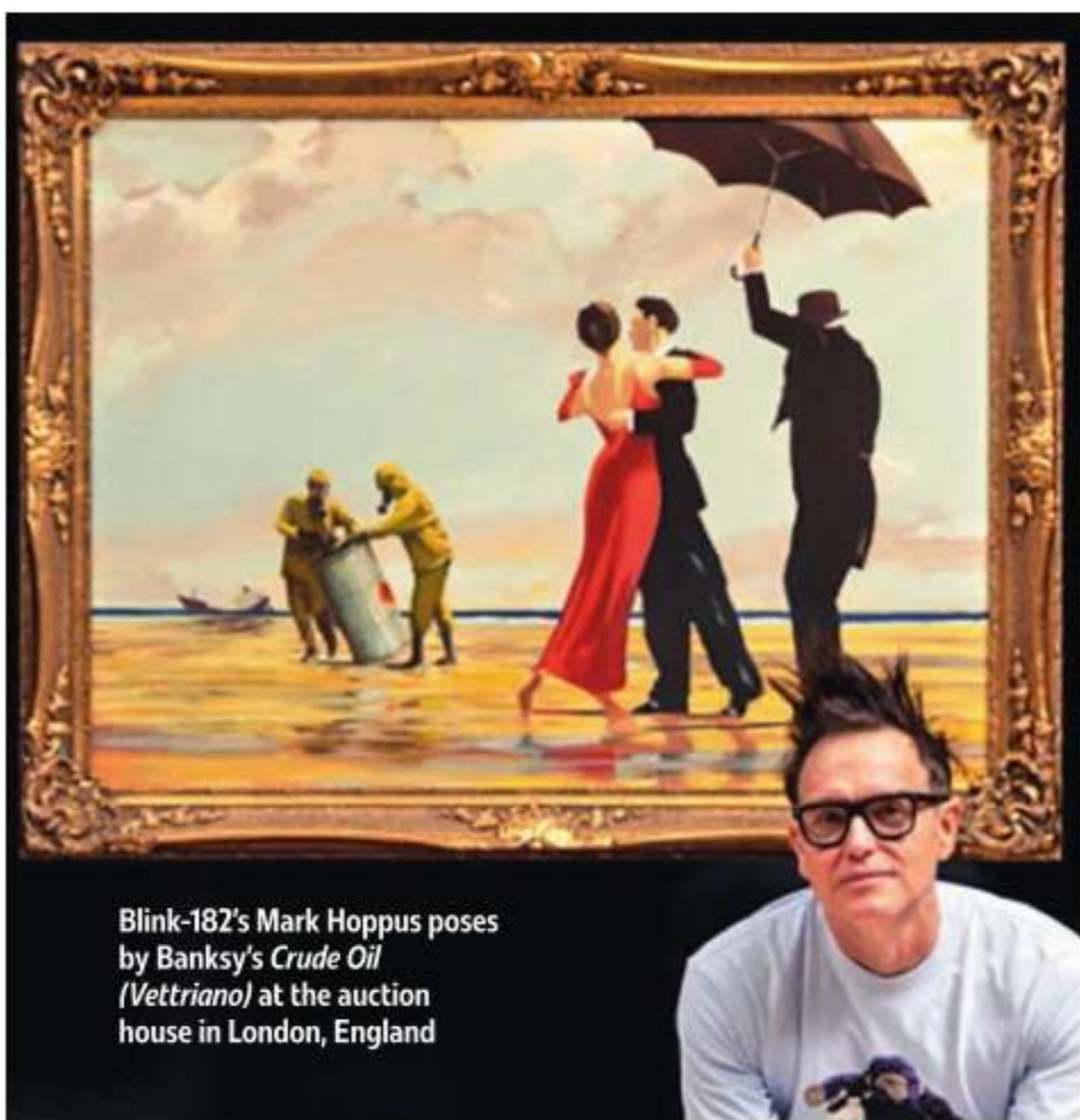
Blink-182's Mark Hoppus poses by Banksy's Crude Oil (Vettriano) at the auction house in London, England

Hoppus hopes the sale will support emerging artists. "I want to be a punk rock Medici," he said, referencing the Renaissance-era patrons of the arts.