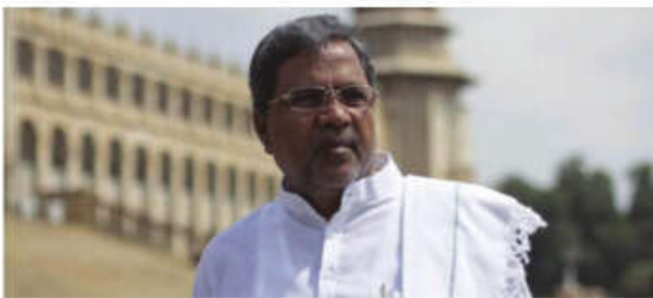
LAKSHMANA VENKAT KUCHI BENGALURU, 05 MARCH

The Congress governments in the states, the few remaining ones that is, appear to compete with one another in giving a handle to the BJP to beat it with—on minority appeasement. After Telangana gave time off to minority office goers to participate in Ramadan, Karnataka government presented the BJP with fresh ammunition with its proposal to give 4 per cent reservation for muslim contractors in government tenders of value upto Rs 1 crore.