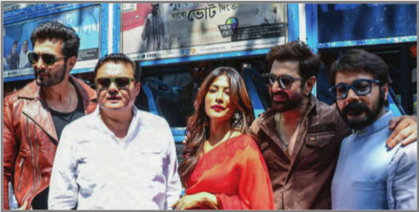
Stars descend on a tram at the Esplanade depot on Wednesday