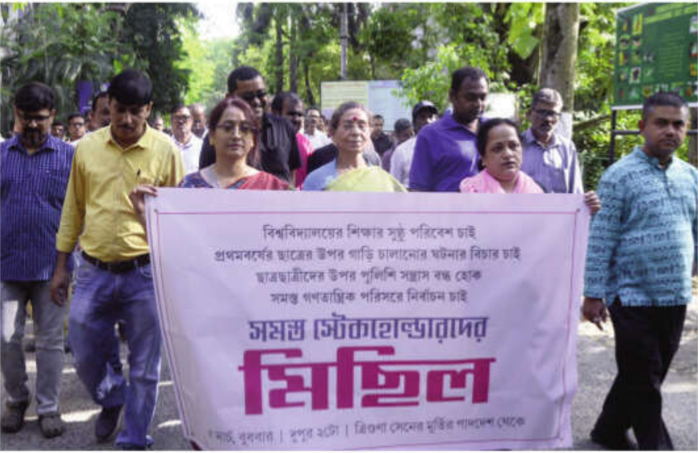
Parents of students, teachers and students take out a procession demanding conducive teaching atmosphere on campus and justice for the injured students, on Wednesday

Justice Ghosh also directed the state government to file a detailed report on the violence which happened when minister Bratya Basu was present inside the campus