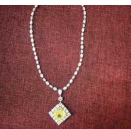
A gold necklace being recovered by the customs department at the IGI Airport in New Delhi.

Detailed examination of the baggage and personal search of the passenger resulted in the recovery of a diamond-studded gold necklace weighing 40 grams, having a total value of ₹6,08,97,329 (Rs