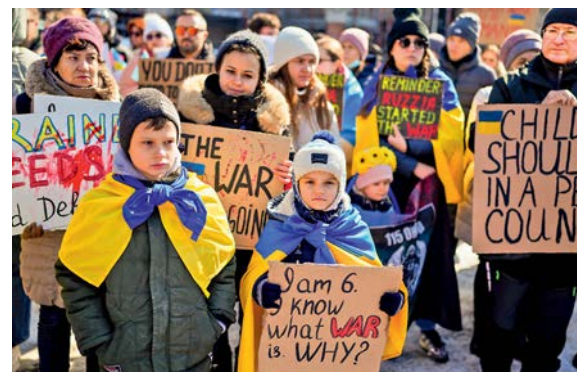
Members of the Ukrainian community stage an event to mark three years since the start of Russia's invasion of Ukraine in Bucharest, Romania, on Sunday.

Ukrainian legislation bans elections during martial law, which has been in place since Russia launched its invasion in February 2022. Few Ukrainians support the idea of a poll at a time when Russia's invasion has forced millions to flee abroad, and when Ukrainians are dying.