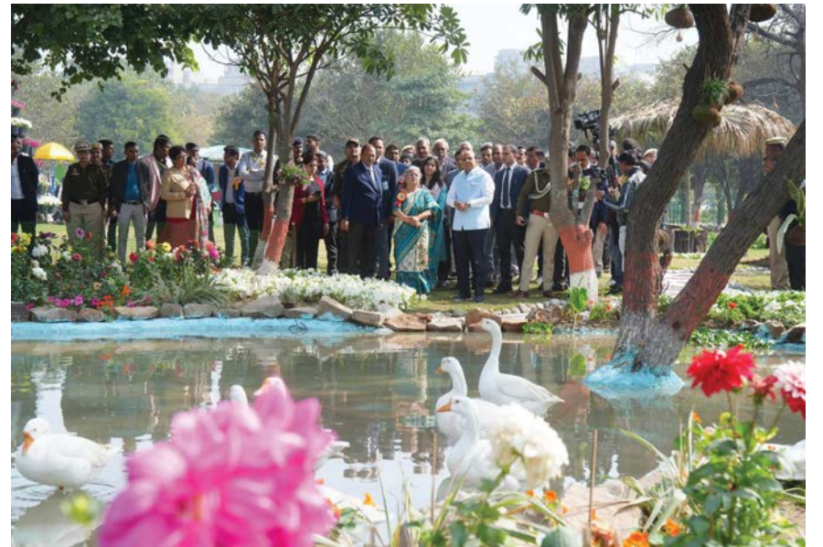
Delhi lieutenant-governor V.K. Saxena during the inauguration of DDA's flower festival 'Palaash 2025' in New Delhi.

As per the Legislative Assembly bulletin, the first session of the eighth Delhi Assembly will begin on Monday, with newly elected MLAs taking oath at about 11 am, followed by the Speaker's election at 2 pm. Lieutenant-governor V.K. Saxena will address the House on Tuesday before the CAG reports are tabled. The session will resume on February 27 for discussions on the motion of thanks.