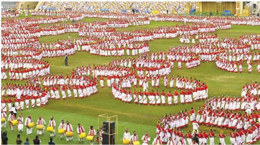
Artistes perform at Indira Gandhi Athletic Stadium in Guwahati on Sunday during a rehearsal for “Jhumoir Binandini”, an attempt to set a world record for the largest participation in a Jhumoir dance event, ahead of Prime Minister Narendra Modi’s visit.

The visit aims to enhance military collaboration and explore new avenues of cooperation with France.