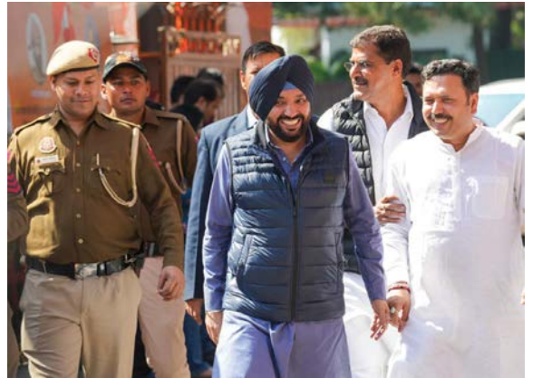
BJP MLA Arvinder Singh Lovely and other leaders at the BJP office in New Delhi on Sunday.

During the AAP's tenure, Rohini MLA Vijender Gupta, who is all set to be elected as the Speaker of the new