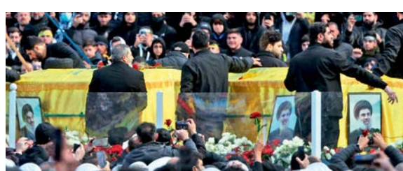
The coffins of Hezbollah's slain leaders Hassan Nasrallah and Hashem Safieddine are paraded during their funeral ceremony at the Camille Chamoun Sports City Stadium on the outskirts of Beirut, on Sunday.

Women wailed as a black truck carrying the coffins of Nasrallah and Hashem Safieddine — Nasrallah's chosen successor killed in another Israeli air strike