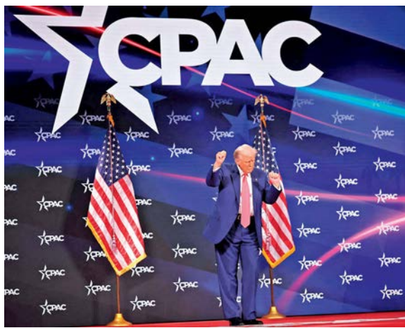
US President Donald Trump dances on stage after speaking at the Conservative Political Action Conference at the Gaylord National Resort Hotel and Convention Centre in Oxon Hill, Maryland, on Saturday.

Three batches comprising a total of 332 Indians have already been sent back to India from the US amid an intensified crackdown by the Trump administration against illegal immigrants. —PTI