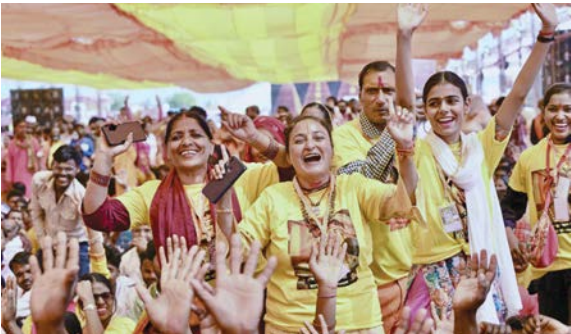
People during the foundation stone laying of Bageshwar Dham Medical & Science Research Institute by Prime Minister Narendra Modi in Madhya Pradesh's Chhatarpur.

Mr Modi, who began a two-day tour to Madhya Pradesh in the afternoon, was seen moving from table to table where MLAs and MPs were seated, sharing tips with them on how to connect with the people and win their confidence. “The lawmakers must realise that they are ‘jan sevaks’ (public servants), and should behave like a ‘jan sevak’.” He should endeavour to be a good political person by being accessible to the people in all situations to solve their problems”, he told them.