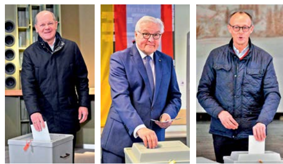
German Chancellor Olaf Scholz, German President Frank-Walter Steinmeier and Friedrich Merz, leader of Germany's conservative Christian Democratic Union, cast their votes, on Sunday.

That could leave unpopular Chancellor Olaf Scholz in a caretaker role for months, delaying urgently needed policies to revive Europe's largest