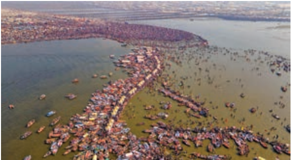
An aerial view of devotees at the Sangam in Prayagraj on Wednesday.

The lawyer asked the SC to adjourn the matter for four weeks, saying senior advocate Harish Salve