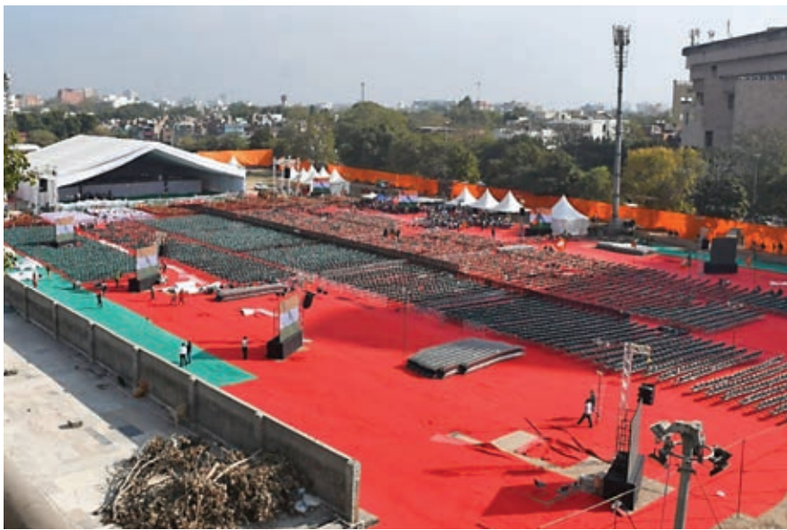
Preparations underway for the oath ceremony of the New Delhi government at the Ramlila Maidan in New Delhi on Wednesday.

He mocked the AAP for their defeat in the Assembly elections and said that the people of Delhi had punished a "tyrannical ruler for his