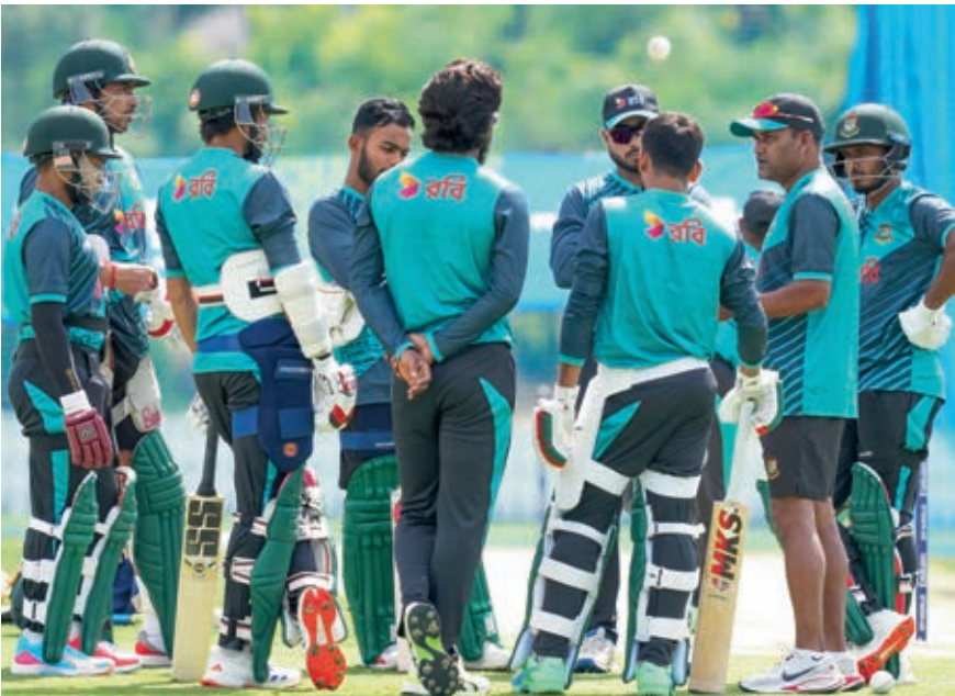
Bangladesh players during a practice session on the eve of Champions Trophy match against India, in Dubai, on Wednesday.