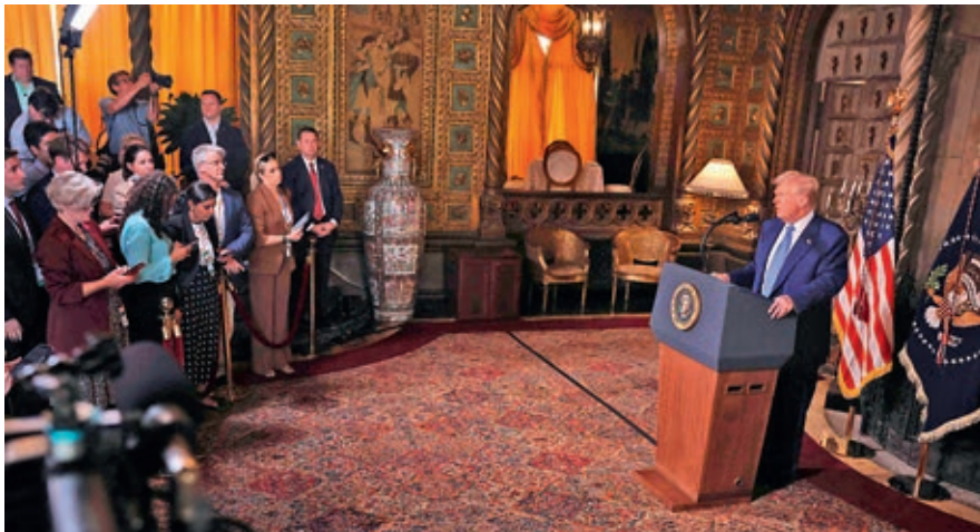
US President Donald Trump delivers remarks at his Mar-a-Lago resort in Palm Beach, Florida, on Tuesday.

Hails tech billionaire's zeal in implementing executive orders he has issued since returning to office