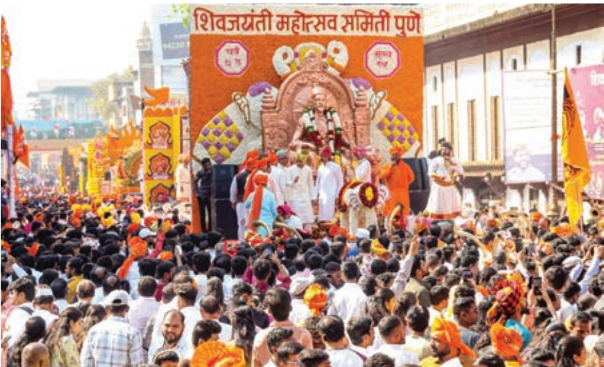
Descendents of Maratha "Sardars" take part in celebrations on the birth anniversary of Chhatrapati Shivaji Maharaj in Pune on Wednesday.

The Army Chief Gen. Upendra Dwivedi on Wednesday expressed his concern over the reports about the presence of Pakistan Army and ISI officials in Bangladesh areas close to India's Chicken's Neck area. Expressing reservations over engaging the defence forces in a political slugfest, Gen. Dwivedi said that the Army should not be involved in politics. He was reacting to recent statement by Leader of Opposition Rahul Gandhi's in Parliament that the Chief of Army Staff has already stated that China has done incursion into Indian territory. Gen. Dwivedi said that Pakistan's agenda is not limited to Kashmir only. "I had used the word epicentre of terrorism for a particular country (Pakistan). Now those countrymen, if they go to any other place and they happen to be our neighbor, as far as I am concerned, I should be concerned about it. That they should not be able to use that soil to send terrorists to India," Gen. Dwivedi said. He said that India's military relationship is very strong with Bangladesh. "So, as far as they (Pakistan) are concerned, the idea of India is their major criticality. It's not limited to Kashmir only. So to keep Pakistan together, you have to have one common agenda which can keep you together. Is the language the same? Are the people the same? What is the same? Only anti-India stance. So therefore, Kashmir, it will keep hanging up at every point of time," he said.