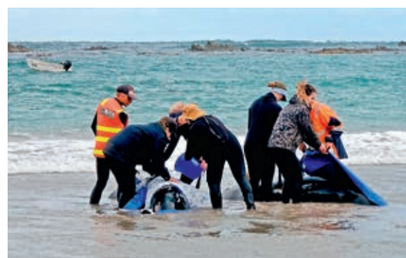
Officials work on dolphins stranded on a beach near Arthur River on the west coast of Tasmania. — AFP

Dozens of sleek, dark-skinned dolphins were pictured Tuesday wallowing in wet sand. — AFP