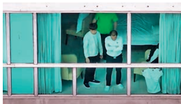
Two out of 300 people from various countries deported under US President Donald Trump are seen detained in a Panama hotel.

The migrants hail from 10 Asian countries, including Iran, India, Nepal, Sri Lanka, Pakistan, Afghanistan, China and others. The US has difficulty deporting directly to some of those countries so Panama is being used as a stopover. Costa Rica was expected to receive a similar flight of