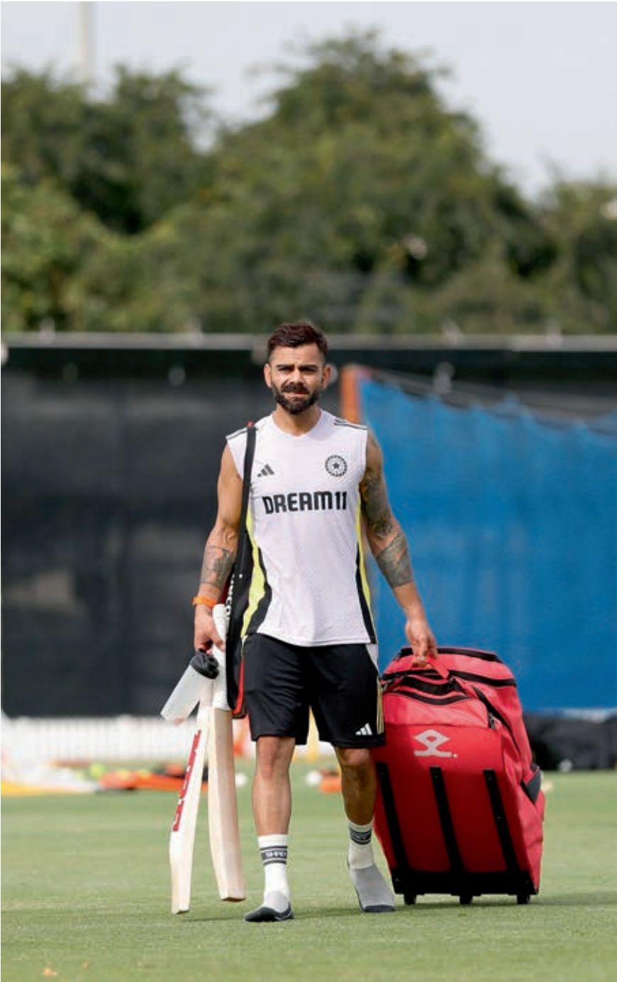
India's Virat Kohli during a training session in Dubai on Tuesday.