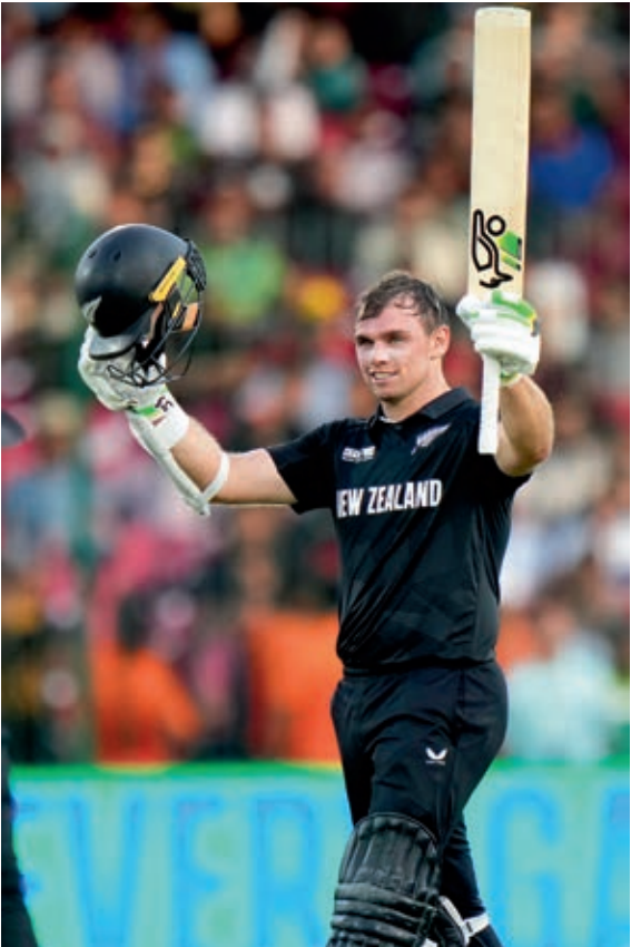
New Zealand’s Tom Latham celebrates his century against Pakistan during their Champions Trophy match in Karachi, Pakistan, on Wednesday.