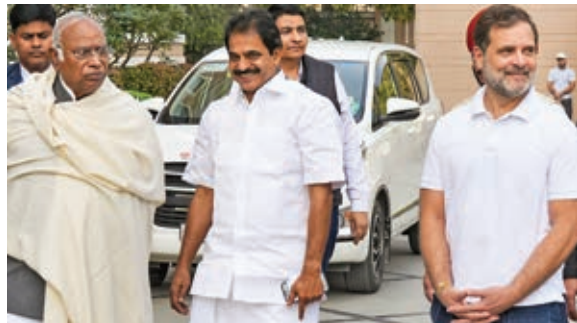
Congress president Mallikarjun Kharge and party leaders Rahul Gandhi and K.C. Venugopal arrives for a party meeting in New Delhi on Wednesday.

The 395th birth anniversary of Chhatrapati Shivaji Maharaj was celebrated with great enthusiasm across the country, with people from all walks of life, including politicians and celebrities, extending their tributes to