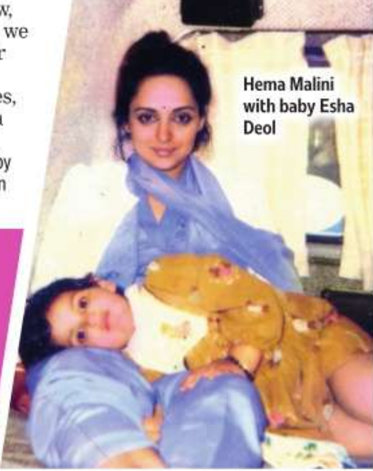
Hema Malini with baby Esha Deol

After my first film, I told myself, 'People are going to keep comparing me to my mom, who's already a legend. So if you're going to let that affect you, you're not in the right profession'