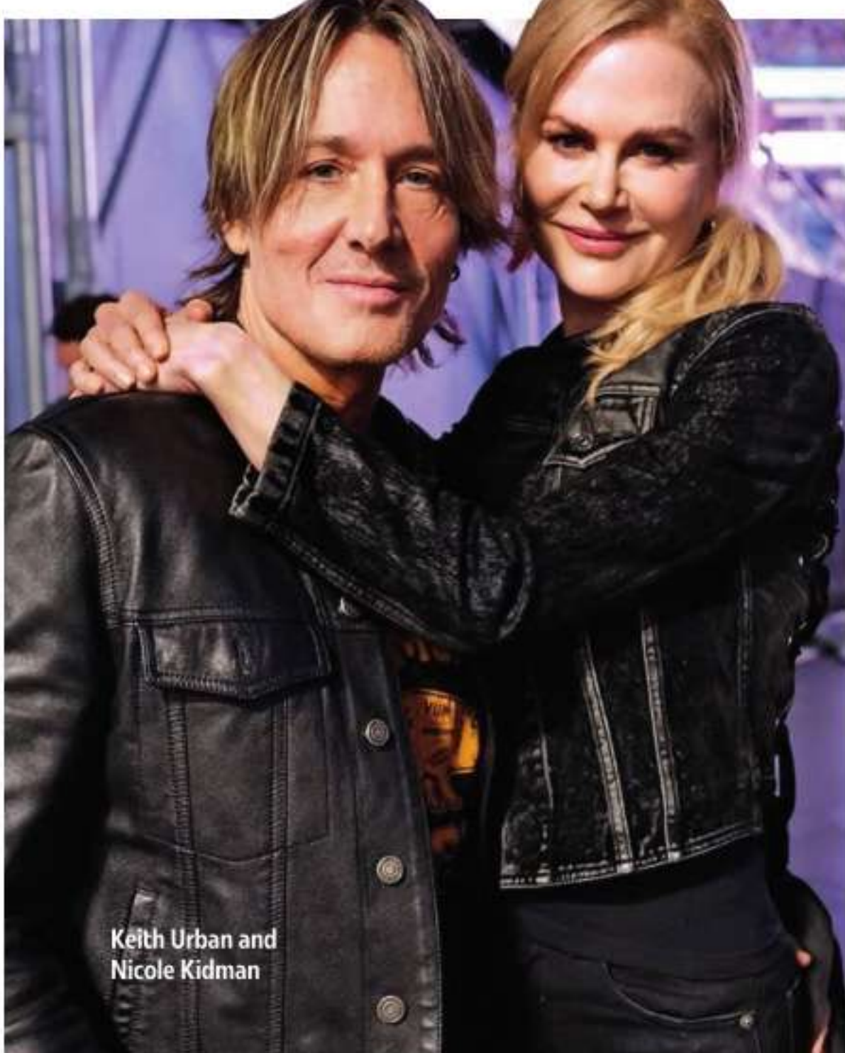
Keith Urban and Nicole Kidman

ARIES: Reviewing your financial picture can be exceptionally helpful in bringing about some brighter prospects for the future. Don't hesitate to work on anything that could add weight to your wallet. TAURUS: The bottom line is the final determining factor in assessing whether or not you have been successful. When all is tallied, you should finish exactly where you want to be. GEMINI: When it comes to matters that involve competitive elements, keep your intentions to yourself. The road to reach your target will be much easier to maneuver with less traffic on it. CANCER: Being in the right place at the right time allows you to benefit from the efforts of others. Show your gratitude by paying it forward with a kind gesture. LEO: Your ambition is high, and you may tackle challenging projects, but unexpected obstacles could arise. Seeking professional guidance can save both time and money. Be mindful of personal relationships, especially if you have been distant from loved ones. VIRGO: You are a problem-solver, known for using logic over gut instinct. Today, your talents will be