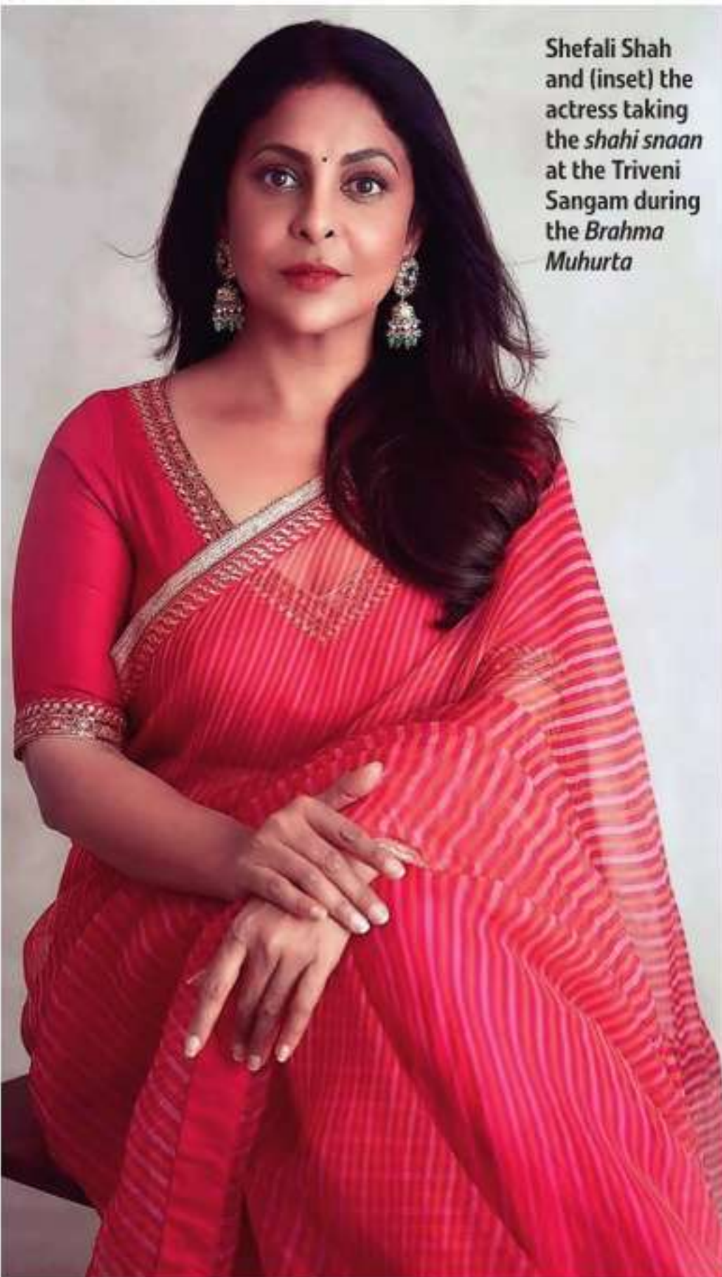
Shefali Shah and (inset) the actress taking the shahi snaan at the Triveni Sangam during the Brahma Muhurta

Termining her journey to the Maha Kumbh one of the most exciting ones, Shefali said, "There were so many unforgettable moments, but one of the most exciting experiences was the journey itself. As we got closer to the mela , we were stopped by police barricades. It was late at night, and the area was a no-vehicle zone. We were stuck on the