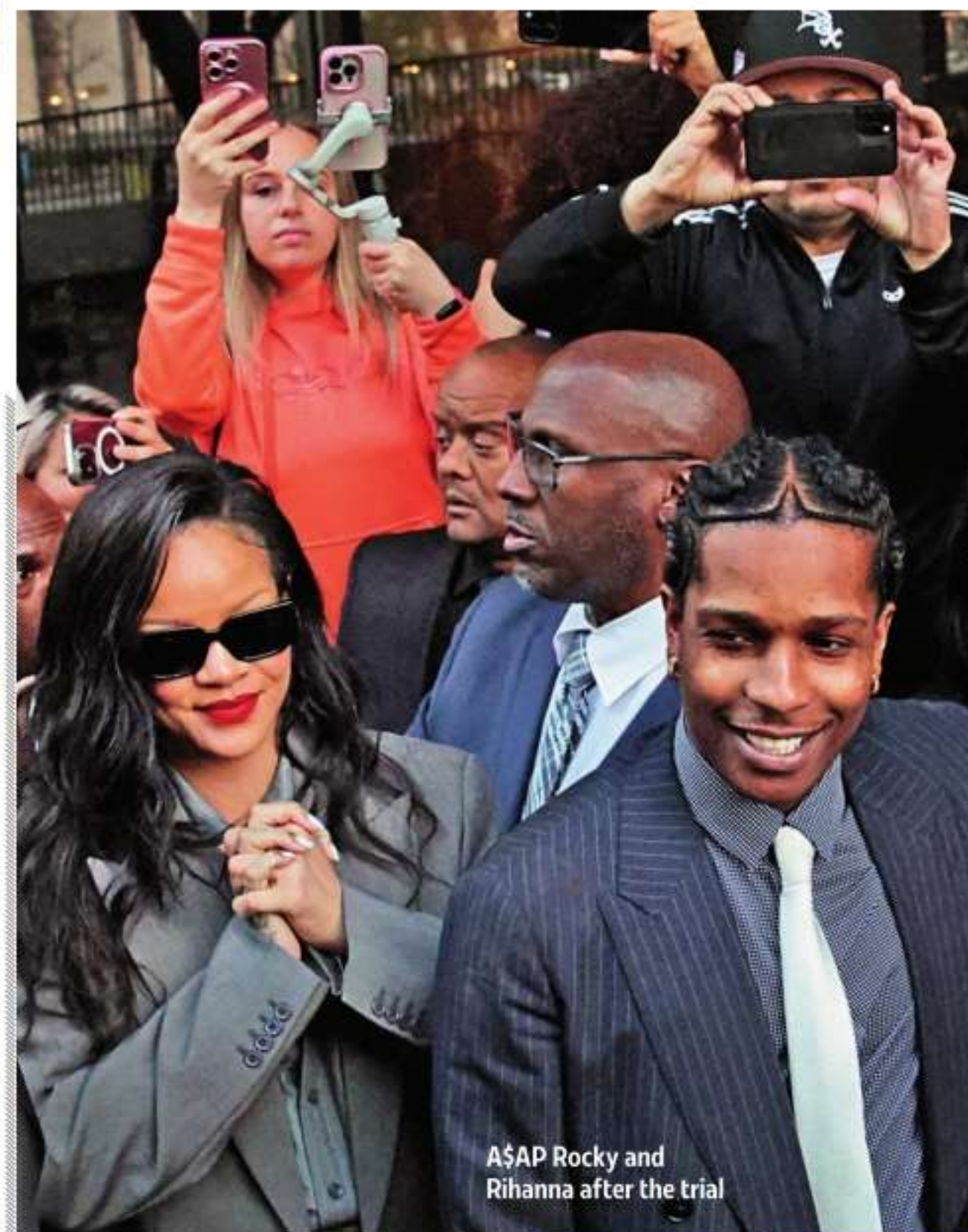
A$AP Rocky and Rihanna after the trial