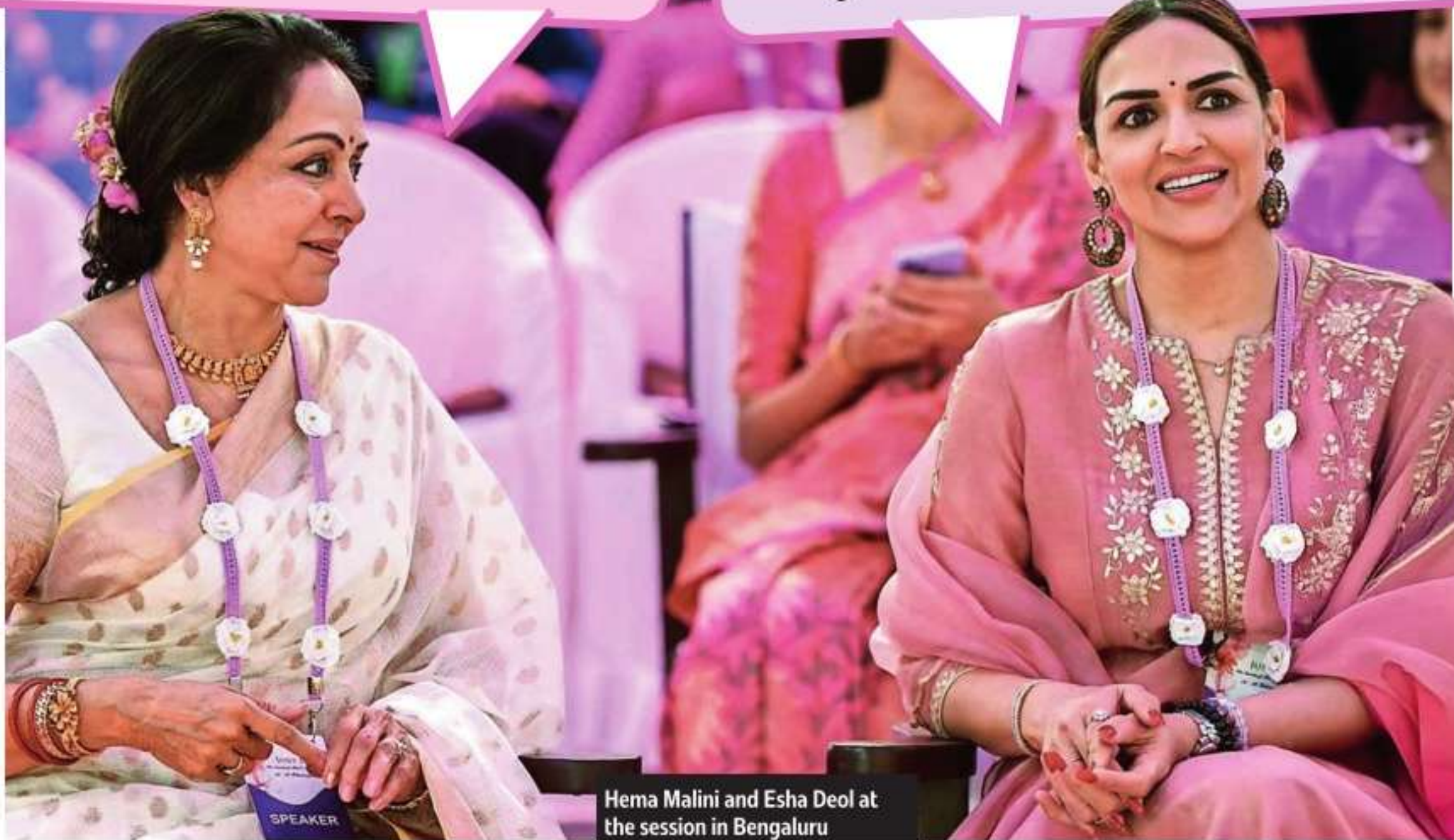
Hema Malini and Esha Deol at the session in Bengaluru

I realised early that I will always be compared to my mom: Esha Deol