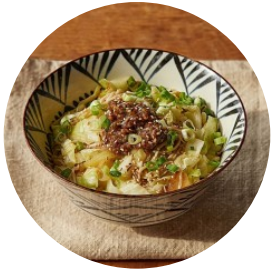
Vegetarian cabbage rice bowl