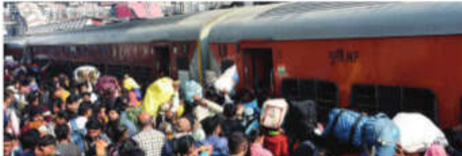
STATESMAN NEWS SERVICE SILIGURI, 14 FEBRUARY