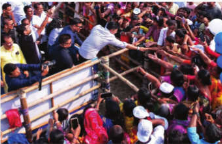
STATESMAN NEWS SERVICE KOLKATA, 14 FEBRUARY

Since inception, 6,55,494 individuals have received health check-ups with 11,015 people walking in for treatment on Friday