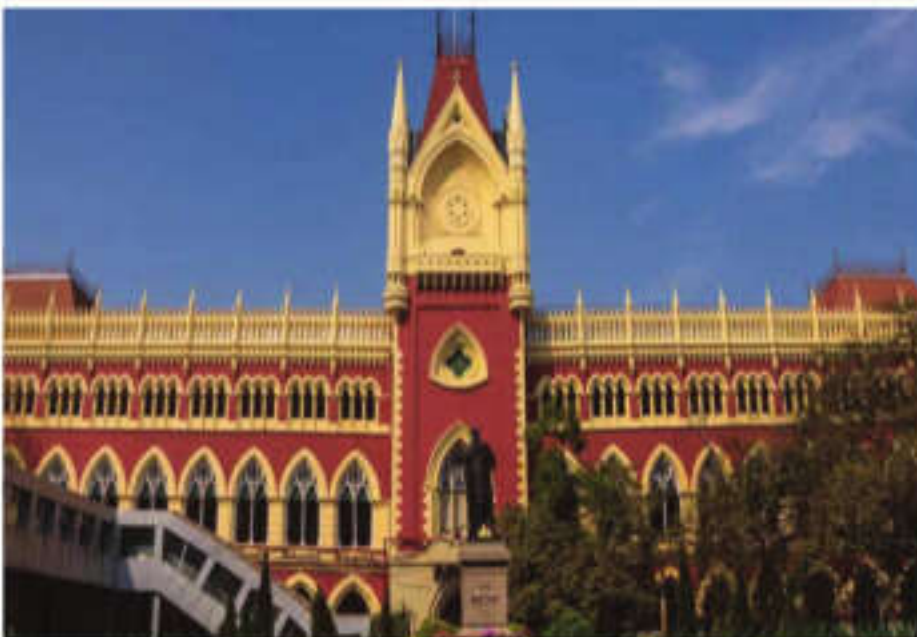
STATESMAN NEWS SERVICE BURDWAN, 14 FEBRUARY

The Calcutta High Court today gave a go-ahead for the public meeting of RSS chief Mohan Bhagwat at a sports stadium beside Burdwan town.