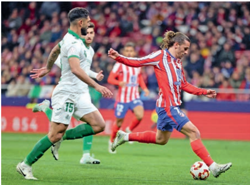
Atletico Madrid’s Antoine Griezmann (right) runs with the ball as Getafe defender Omar Alderete (left) tries to challenge during their Copa del Rey match.

“It is an absolute honour for me to be named the captain of Gujarat Giants. I have loved being a part of this team and I am excited to lead this fantastic group in the upcoming season,” Gardner said in a release.