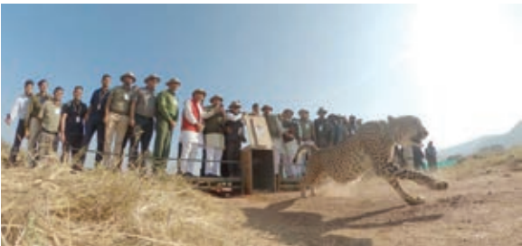
A female cheetah released by MP chief minister Mohan Yadav into the wild at Kuno National Park.