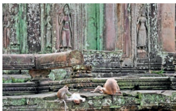
Macaque monkeys at Bayon Temple in Angkor Park in Siem Reap province of Cambodia. — AFP

Australia has also banned DeepSeek from all government devices on the advice of security agencies, a top official said on Wednesday, citing privacy and malware risks posed by China's breakout AI programme. — Agencies