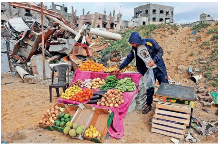
A Palestinian man sells vegetables at Saftawi street in Jabalia, in the northern Gaza Strip, on Wednesday.

The security sources alleged that the PTI leadership had staged another "drama" and suggested that if the party was interested in holding talks, it should contact politicians instead of the military establishment. — PTI