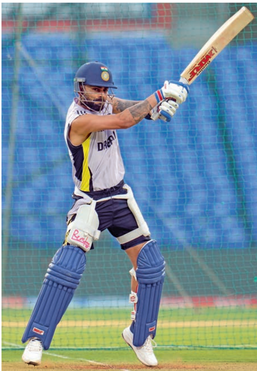
India’s Virat Kohli bats in the nets during a training session ahead of the first One-Day International match in Nagpur on Wednesday.

Rahul, who kept wickets in Pant’s absence during the 2023 World Cup, performed admirably, scoring 452 runs and proving to be one of India’s most consistent middle-order batters.