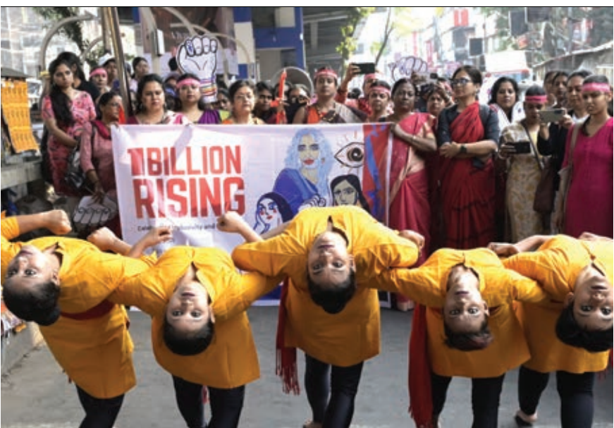
Activists take part in a rally during the "One Billion Rising" event in Kolkata on Wednesday. The global campaign calls for an end to violence against women and girls.