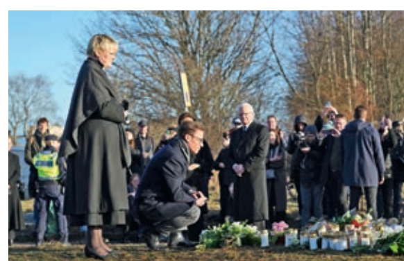
Sweden's PM Ulf Kristersson and his wife Birgitta Ed place flowers at a memorial near a shooting scene on the outskirts of Orebro, Sweden, on Wednesday.

All of the victims are over age 18, officials said. However, no other patients related to the shooting were admitted to Orebro University Hospital overnight.