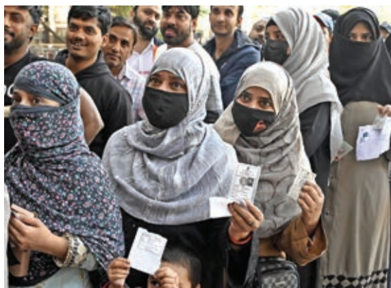
Voters stand in a queue to cast their votes at a polling station of Jafrabad area in New Delhi.