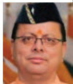
Pushkar Singh Dhami

Dehradun, Feb. 5: Only one live-in relationship has been registered in Uttarakhand's Uniform Civil Code (UCC) portal in the first 10 days of its implementation. Officials claimed that five applications have been received from live-in couples for the mandatory registration. One has been granted registration while four others are being verified, they said. On January 27, the BJP-ruled Uttarakhand became the first state in Independent India to implement the UCC, which promotes equal laws for every citizen across all religions and standardises personal laws on marriage, divorce and property. On the occasion, chief minister Pushkar Singh Dhami launched a portal designed for the mandatory online registration of marriages, divorce and live-in relationships. He was the first to register his marriage on the UCC portal. The UCC's provision for mandatory registration of live-in relationships has been much criticised for its potential to infringe upon people's right to privacy. However, the CM had justified it, saying mandatory registration of live-in couples would help prevent brutal incidents. — PTI