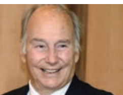
Prince Karim Aga Khan

"Deeply saddened by the passing of His Highness Prince Karim Aga Khan IV. He was a visionary, who dedicated his life to service and spirituality. His contributions in areas like health, education, rural development and women empowerment will continue to inspire several people,"