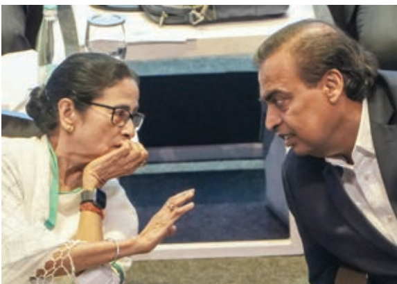
West Bengal chief minister Mamata Banerjee with industrialist Mukesh Ambani during the Bengal Global Business Summit in Kolkata on Wednesday.

Industrialist Mukesh Ambani on Wednesday pledged to double investments of his business conglomerate, Reliance Industries Limited (RIL), in West Bengal by 2030. He made the announcement at the inauguration of the eighth edition of Bengal Global Business Summit, organised by the Mamata Banerjee government. Mr Ambani said, "In 2016 when I first attended this summit, Reliance's investment stood below ₹2,000 crores. Today in less than a decade, our investment in Bengal have increased 20 times and we are invested over ₹50,000 crores. We shall double this investment by the end of this decade. More importantly, our investment created one lakh