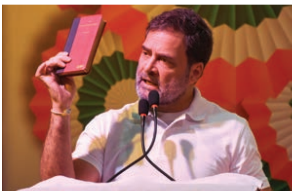
Congress leader Rahul Gandhi addresses a gathering in Patna on Wednesday.

New Delhi, Feb. 5: Leader of the Opposition in the Lok Sabha Rahul Gandhi on Wednesday said Prime Minister Narendra Modi did not mention "Make in India" in his speech in the House, and asserted that the PM must acknowledge the initiative a failure. The Congress leader said no government in recent times — the United Progressive Alliance (UPA) or the National Democratic Alliance (NDA) — had been able to meet at scale the national challenge of providing jobs. "Prime minister, in your speech, you didn't even mention 'Make in India'! The prime minister should acknowledge that 'Make in India', although a good initiative, is a failure. Manufacturing has fallen from 15.3 per cent of GDP in 2014 to 12.6 per cent — the lowest in the last 60 years," Mr Gandhi said in a post on X. "India's youth desperate-