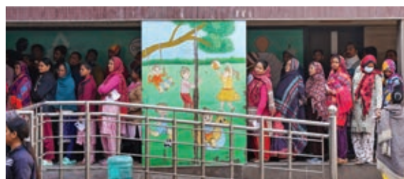
Voters wait in a queue to cast their votes at a polling station at Trilokpur area in New Delhi.

“I am here to vote against corruption and poor sanitation. The issues don't need to be highlighted — just look at the roads. When you step out of the house, you can clearly see all the sanitation problems. The entire constituency needs cleanliness. The roads are there, but they're broken and congested. Similarly,