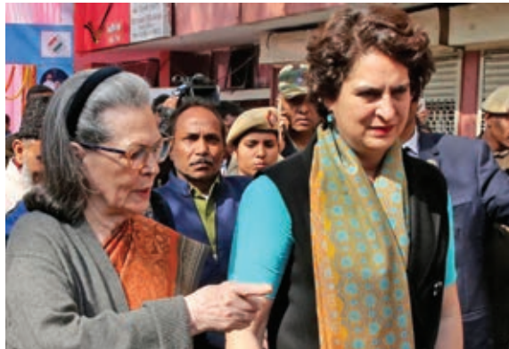
Congress leader Sonia Gandhi along with Priyanka Gandhi after casting their votes in New Delhi.

The voter turnout in key constituencies like New Delhi, where AAP chief