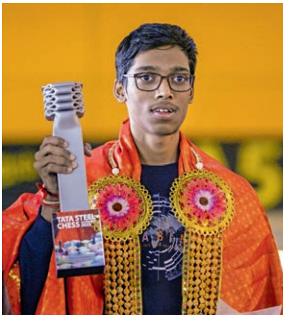
Grandmaster R. Praggnanandhaa poses with the Tata Steel Chess trophy on his arrival at the Chennai airport on Tuesday.