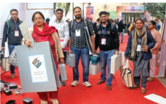
Polling officials carrying electronic voting machines for the Delhi Assembly elections on Tuesday.

Out of 699 candidates contesting the elections, 118 have declared criminal cases against themselves and among them, 71 candidates face serious criminal charges, including corruption, rioting and violent offences.