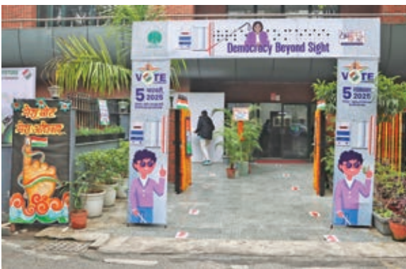
Preparations underway on the eve of the Delhi Assembly elections in New Delhi on Tuesday.

The 70-member Delhi Assembly is scheduled to go to polls on Wednesday, with the results set to be declared on February 8.