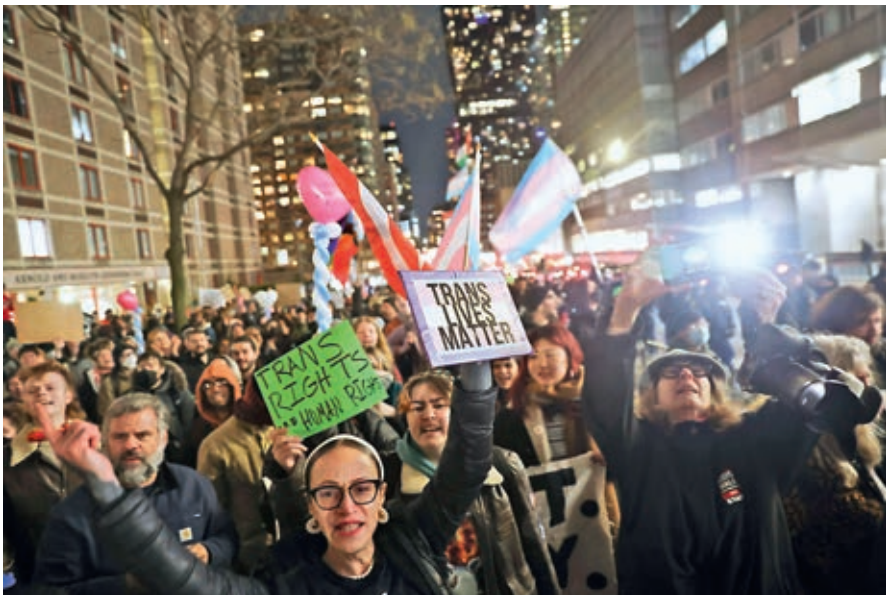
The crowd marches during a rally demanding that NYU Langone commit to providing gender-affirming care for transgender youth following an executive order by US President Donald Trump aimed at cutting federal funding, in New York, on Monday.

China's new measures, announced as the Trump tariff took effect, include a 15% levy on United States coal and LNG and 10% for crude oil, farm equipment and a small number of trucks as well as big-engine sedans shipped to China from the United States.