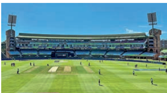
The George's Park Stadium in Gqeberha, South Africa, presents a pleasant picture.