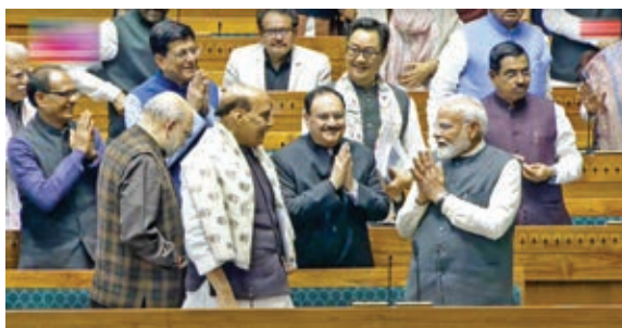
Prime Minister Narendra Modi with his Cabinet colleagues Rajnath Singh, Amit Shah and J.P. Nadda in Lok Sabha in New Delhi on Tuesday.

Replying to the debate on the Motion of Thanks to the President’s address in the Lok Sabha, he made several veiled attacks at former Congress chief, saying those who enter-