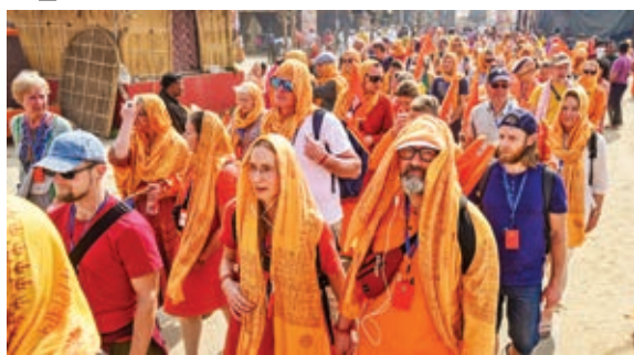
Foreign devotees arrive to visit the “Akharas” during the ongoing Maha Kumbh in Prayagraj on Tuesday.

Speaking to reporters in Prayagraj, Mr Adityanath said: “While the entire nation and the world are witnessing this grand Sanatan Dharma event