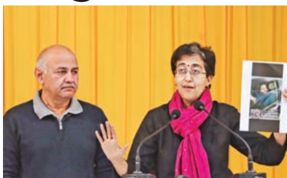
Delhi chief minister Atishi with AAP leader Manish Sisodia at a press conference in New Delhi.

Ms Atishi, however, took to X to slam the Election Commission (EC) for the police case against her and claimed that Ramesh Bidhuri, her BJP rival from Kalkaji, and members of his family were openly resorting to "hooliganism" but no action has been taken, instead they