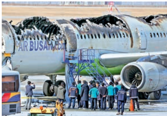
Firefighters and other officials visit the site where an Air Busan airplane caught fire at Gimhae International Airport in Busan, on Wednesday.