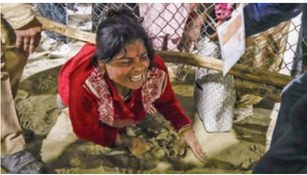
A devotee attempts to cross a barricade amid restrictions after a “stampede-like” situation broke out at the Sangam in Prayagraj on Wednesday.

rupees are condemnable, he said. At least 30 people were killed and 60 others injured in the stampede that broke out at the Maha Kumbh in the early hours of Wednesday, officials said. The pre-dawn stampede at the Sangam area broke out as millions of pilgrims jostled for space to take a holy dip on Mauni Amavasya, considered one of the most auspicious days during the mela. Opposition leaders in Uttar Pradesh targeted the Adityanath government over the stampede. BSP supremo Mayawati said the incident was saddening and worrisome. West Bengal chief minister Mamata Banerjee offered her condolences to the bereaved families. Ms Banerjee in a post on X emphasised the need of “maximal planning