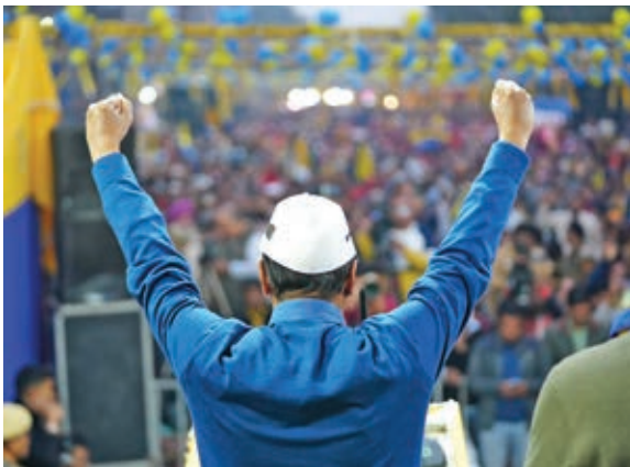
AAP national convener Arvind Kejriwal addresses a public meeting in New Delhi.

Mr Saini said, "An unfortunate statement by Mr Kejriwal was made to create fear in the minds of people for his political benefits. Today, I came here to the banks of river Yamuna and took a sip of the water from Yamuna." Accusing Mr Kejriwal of having lied "all his life," Mr Saini claimed that water from the Yamuna