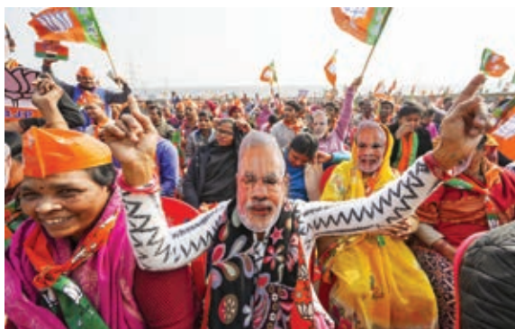
Supporters during a public meeting of Prime Minister Narendra Modi at Kartar Nagar in New Delhi.

The court said the state election officer, chief election officer and the district election officers