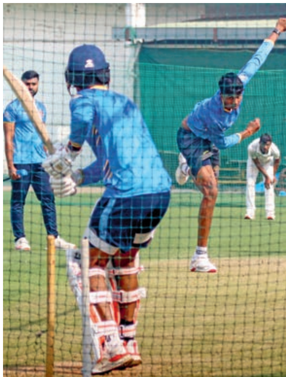
Hyderabad players during a training session ahead of the Ranji Trophy match against Vidarbha in Nagpur on Wednesday.