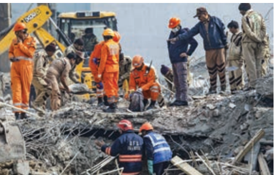
Rescue work underway after a multi-storey building collapsed at Burari area in New Delhi.

The family was trapped inside a space created after a ceiling slab of the newly constructed building fell on a cooking gas cylinder. It prevented the