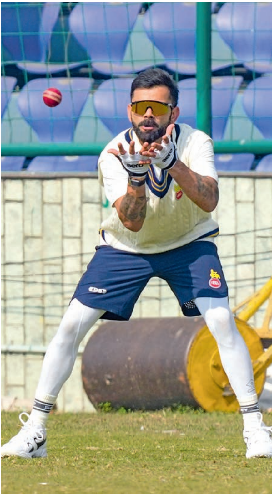
Delhi player Virat Kohli during a training session ahead of the Ranji Trophy match against Railways at the Arun Jaitley Stadium in New Delhi on Tuesday.