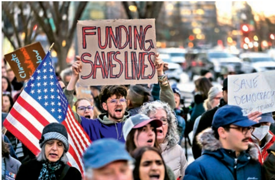
People protest against a funding freeze of federal grants and loans following a push from President Donald Trump to pause federal funding near to the White House in Washington, on Tuesday.

Administration officials said the decision to halt loans and grants — a financial lifeline for local governments, schools and nonprofits — was necessary to ensure that spending complies with Trump's recent blitz of executive or-