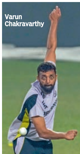
have been times, even when I don't take five wickets, we might end up losing. So, I can't complain.

"No, I can't, I can't complain because that's the nature of the game. There