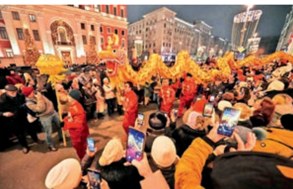
Dragon dancers perform during celebrations of Lunar New Year in Moscow, on Tuesday.