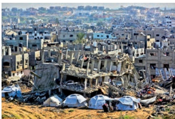
Tents are set up next to houses destroyed by Israeli bombardment in Beit Lahia, in northern Gaza Strip, on Wednesday, after Israel began allowing Palestinians to return to the heavily damaged area.