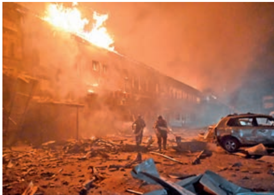
Rescuers of the State Emergency Service work to extinguish a fire in a building after a drone strike in Kharkiv, on Wednesday.