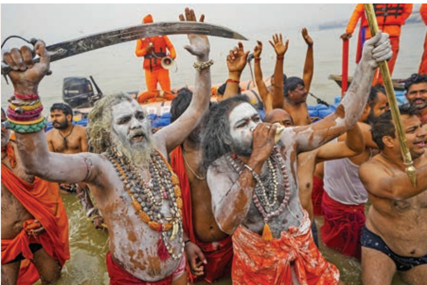
Sadhus take a holy dip at the Sangam on Mauni Amavasya during the ongoing Maha kumbh in Prayagraj on Wednesday.