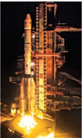
Isro’s GSLV-F15 lifts off from the Satish Dhawan Space Centre in Sriharikota, Andhra Pradesh, on Wednesday.

Sriharikota (Andhra Pradesh), Jan. 29: The Indian Space Research Organisation (Isro) on Wednesday achieved a historic milestone with its 100th mission, and revealed an ambitious future plan of crossing the next 100 launches in five years. Starting off with the SLV in 1979, the space agency crossed the 100-mission mark after 46 years, but what stands out is the PSLV’s dominance through the years with 62 missions. The Polar Satellite Launch Vehicle (PSLV) has turned out to be Isro’s most trusted rocket, thanks to its unmatched reliability. While the PSLV has been used for 62 missions, the GSVL with indigenous cryogenic upper stage comes next with 17. LVM3 (Geosynchronous Satellite Launch Vehicle