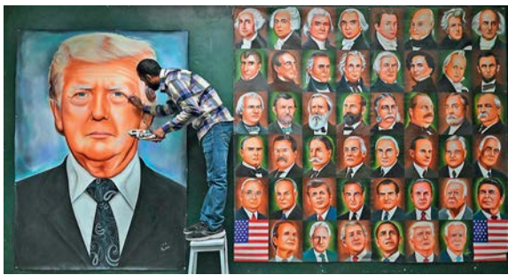
An artist gives final touches to a painting of US President-elect Donald Trump on Friday.

Participants are highlighting a range of issues which they say are under attack from Trump and his party's leaders, including abortion access, climate change, the need for better protections against