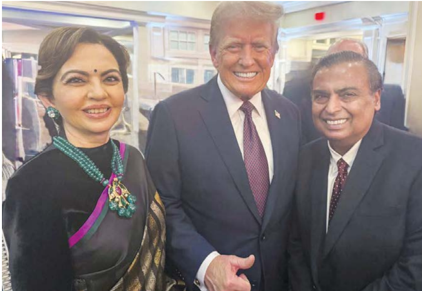
US President-elect Donald Trump with Reliance Industries chairman Mukesh Ambani and Reliance Foundation chairperson Nita Ambani at a pre-swearing-in dinner organised in Washington DC.

The Cabinet has also decided to provide electricity tariff concession to the mini steel plants in the state to combat slowdown in the sector. "The Cabinet took an important decision and decided to give a maximum discount of one rupee per unit in power tariff to the steel industry under special relief package," a state government spokesman said.