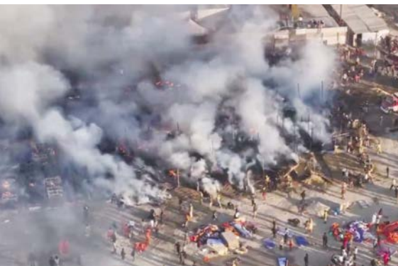
In this drone shot, smoke billows out after a fire broke out in a camp during Maha Kumbh at Sangam in Prayagraj on Sunday.

Meanwhile, Prime Minister Narendra Modi spoke to Mr Adityanath over phone to enquire about the incident. "The chief minister told PM Modi that the blaze was quickly brought under control by teams of SDRF,