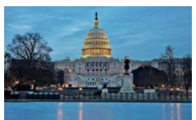
The US Capitol is shown at sunrise the day before President-elect Donald Trump's inauguration in Washington.

look out for during Trumps inauguration.