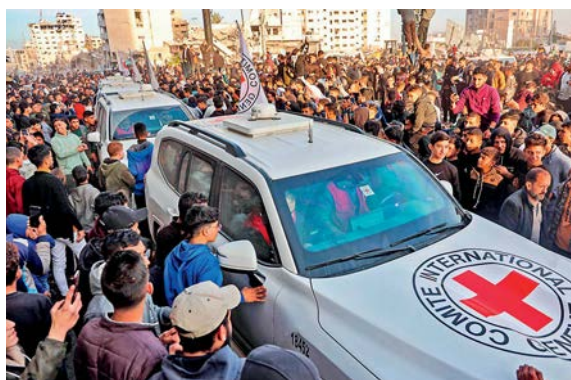
People gather around a vehicle of the ICRC in Saraya Square in western Gaza City on Sunday.

Some trucks returned empty after offloading their cargo, and around a dozen ambulances were also seen driving out of the main Rafah gate.