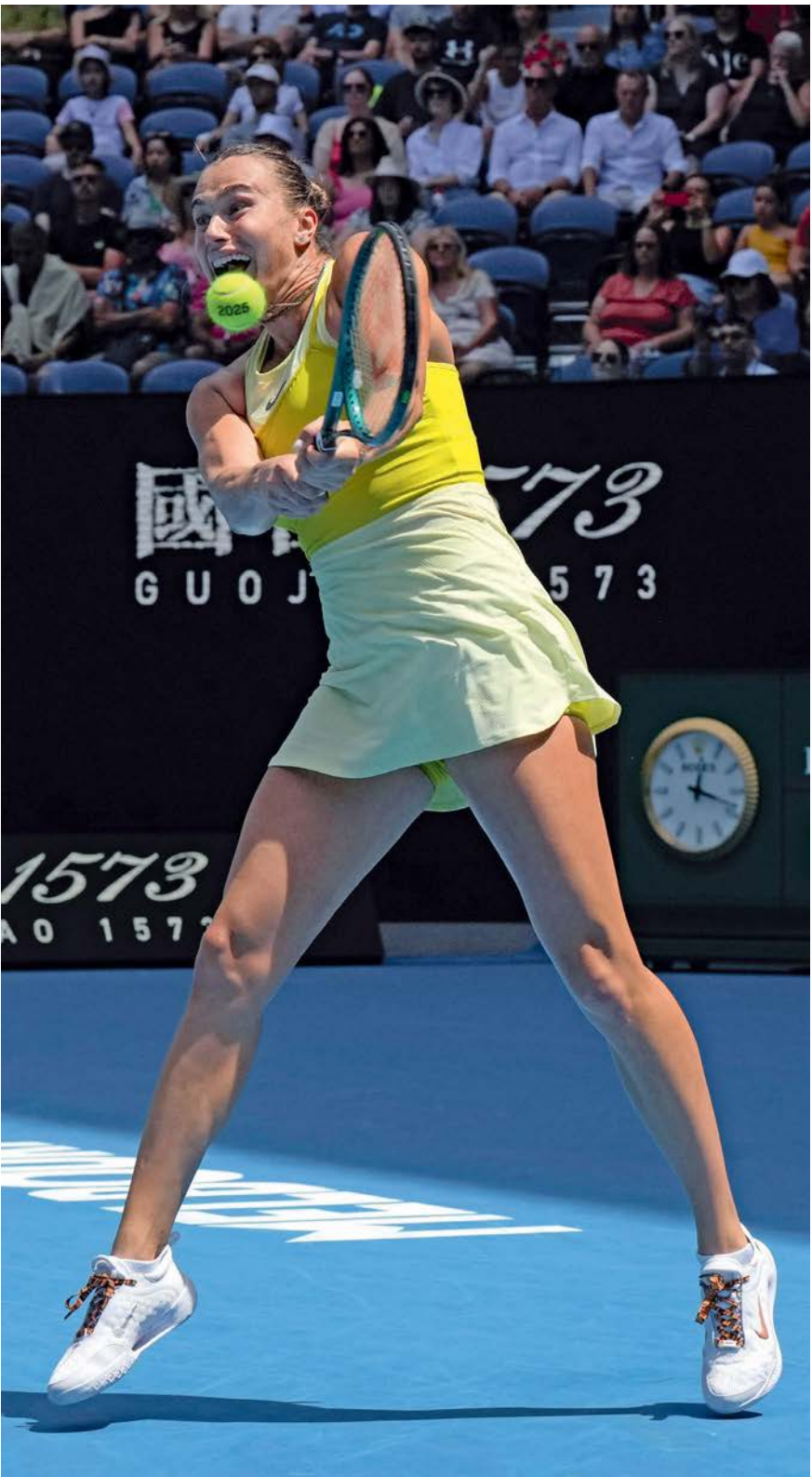
Aryna Sabalenka of Belarus returns to Mirra Andreeva of Russia during their fourth round match at the Australian Open in Melbourne on Sunday.