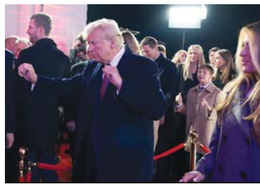
US President-elect Donald Trump with his wife Melania Trump during a reception at Trump National Golf Club in Sterling, Virginia, on Saturday. — AP

Most of the more than 220,000 ticketed guests who had been due to watch from the US Capitol grounds will be unable to view the swearing-in inside the building. — Reuters