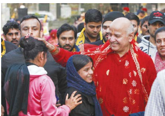
AAP leader Manish Sisodia during a campaign for the Delhi Assembly elections in New Delhi on Sunday.

While drawing Prime Minister Narendra Modi's attention towards the plight of sanitation workers employed in the MCD and the NDMC regarding their housing issues post-retirement, Mr Kejriwal in a letter urged him to provide land to the AAP government for the construc-