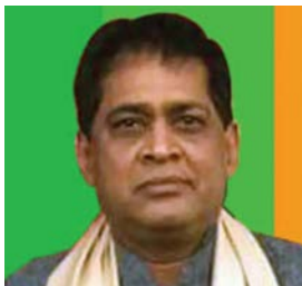
Naba Kishore Das

In a startling revelation, BJP MLA from Sambalpur, Jayanarayan Mishra, has alleged the involvement of two senior government officials — an Indian Administrative Service (IAS) officer and an Indian Police Service (IPS) officer — in the assassination of senior Biju Janata Dal (BJD) leader and former health minister Naba Kishore Das at Brajarajnagar on January 29, 2023. Mr Mishra also implicated two prominent politicians in the conspiracy, adding a new layer of intrigue to the high-profile case. As per Mr Mishra, the IPS officer made a suspicious trip to Jharsuguda just days before Das’s murder, allegedly to orchestrate the plot. “The IPS officer against whom allegations have been levelled will try to mislead the probe. This officer