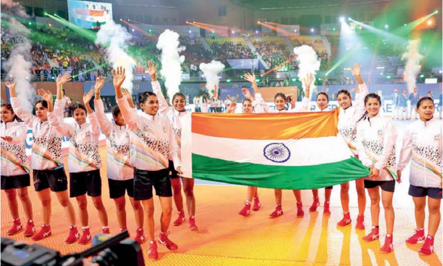
Indian women's team players celebrate after winning the Kho Kho World Cup final in New Delhi on Sunday. India beat Nepal 78-40.