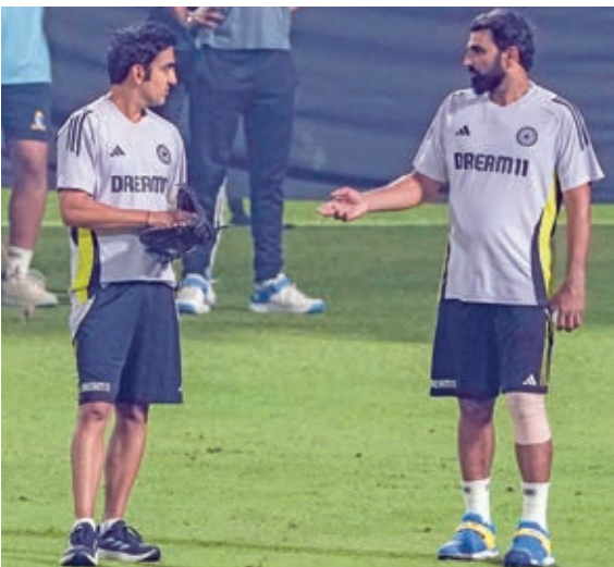
India bowler Mohammad Shami with coach Gautam Gambhir (left) during a training session ahead of the first T20 against England in Kolkata on Sunday.