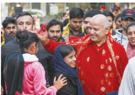
AAP leader Manish Sisodia during a campaign for the Delhi Assembly elections in New Delhi on Sunday.

While drawing Prime Minister Narendra Modi's attention towards the plight of sanitation workers employed in the MCD and the NDMC regarding their housing issues post-retirement, Mr Kejriwal in a letter urged him to provide land to the AAP government for the construc-