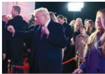
US President-elect Donald Trump with his wife Melania Trump during a reception at Trump National Golf Club in Sterling, Virginia, on Saturday.