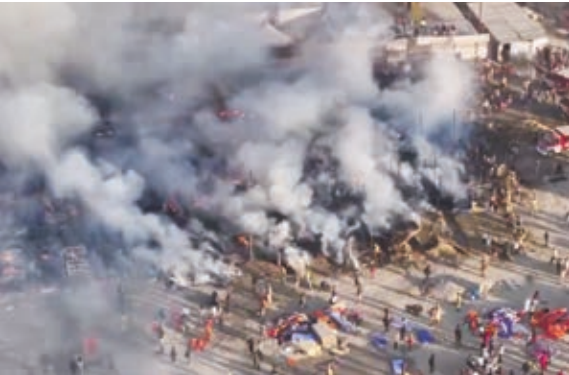
In this drone shot, smoke billows out after a fire broke out in a camp during Maha Kumbh at Sangam in Prayagraj on Sunday.

Uttar Pradesh chief minister Yogi Adityanath, who was in Prayagraj to review the preparations ahead of Mauni Amawasya, also reached the spot and directed authorities to take steps to avoid any such incident in future, they said. Meanwhile, Prime Minister Narendra Modi spoke to Mr Adityanath over phone to enquire about the incident. "The chief minister told PM Modi that the blaze was quickly brought under control by teams of SDRF,