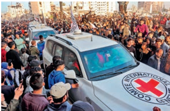
People gather around a vehicle of the ICRC in Saraya Square in western Gaza City on Sunday.

Some trucks returned empty after offloading their cargo, and around a dozen ambulances were also seen driving out of the main Rafah gate.