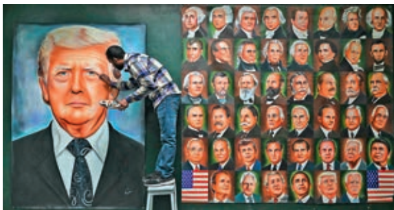
An artist gives final touches to a painting of US President-elect Donald Trump on Friday.

Participants are highlighting a range of issues which they say are under attack from Trump and his party's leaders, including abortion access, climate change, the need for better protections against