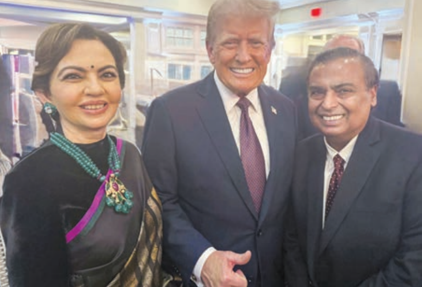
US President-elect Donald Trump with Reliance Industries chairman Mukesh Ambani and Reliance Foundation chairperson Nita Ambani at a pre-swearing-in dinner organised in Washington DC.

Continuing his resolute stand, NCP minister Dhananjay Munde, under severe attack over the sarpanch murder in Beed, said his opponents cannot corner him like Abhimanyu, because he is Arjun and knows how to break "chakravayuha." Speaking at the NCP conclave in Shirdi in Ahilyanagar, Mr Munde accused the Opposition and ruling Mahayuti leaders of deliberately targeting him in the sarpanch murder-extortion case. "No matter what, it will be of no use to corner me like Abhimanyu. Because