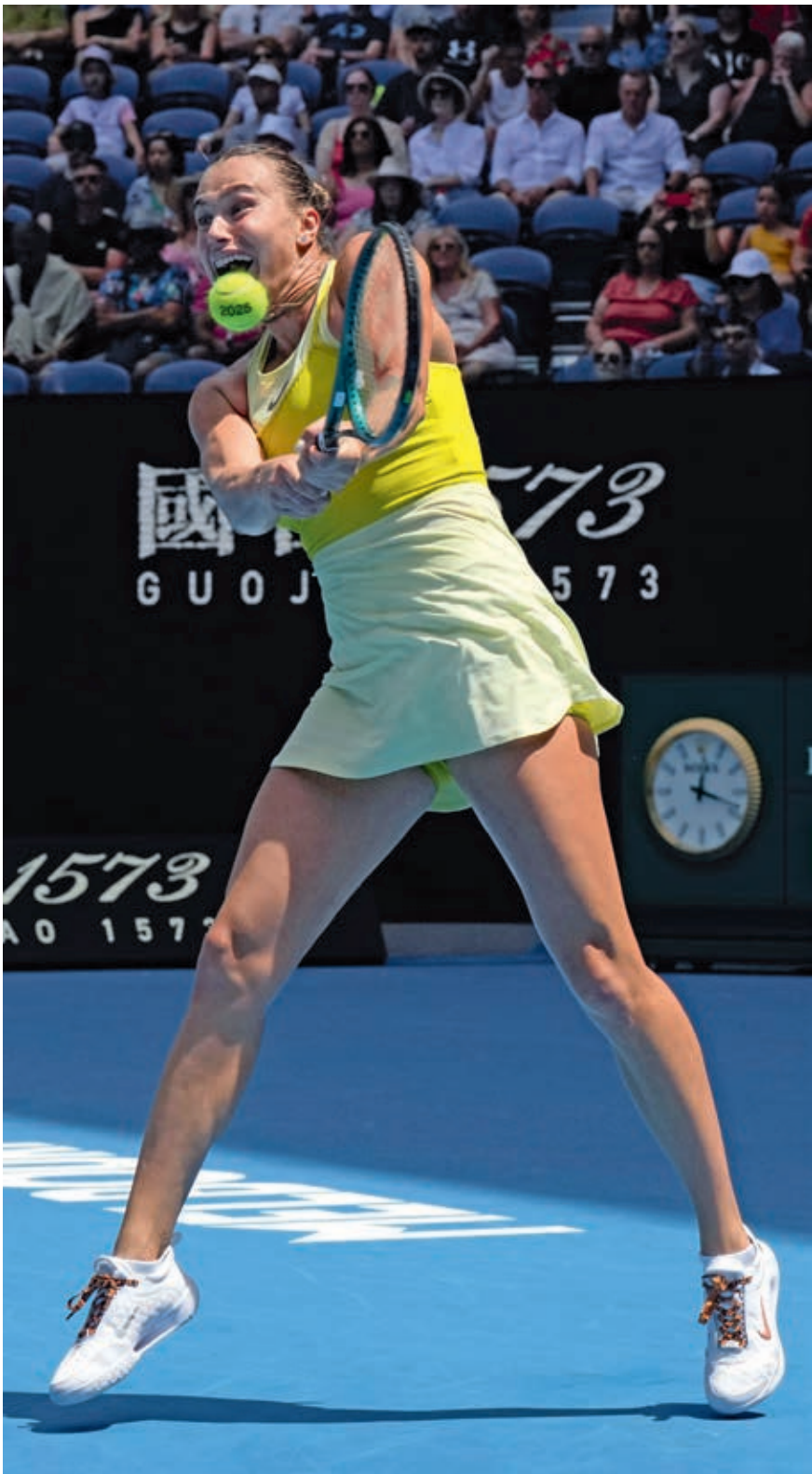
Aryna Sabalenka of Belarus returns to Mirra Andreeva of Russia during their fourth round match at the Australian Open in Melbourne on Sunday.

Zverev, who is zeroing in on a maiden Grand Slam