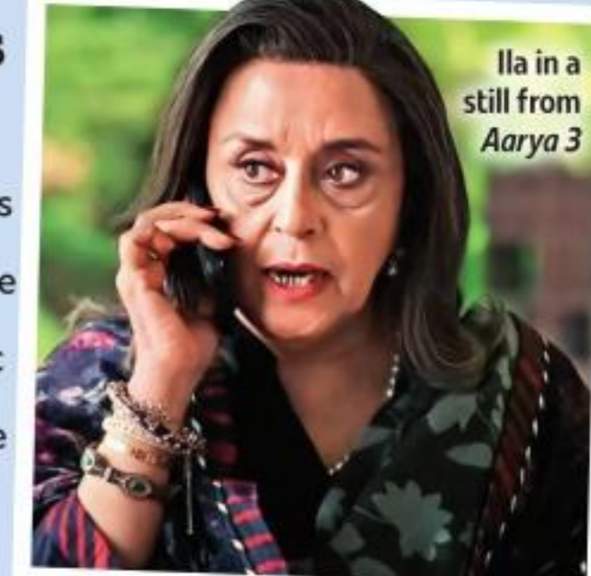
Ila in a still from Aarya 3

Talking about the rise of OTT platforms, Ila Arun said, "It has its pros and cons. The good part is that scripts are the stars, and age or looks don't matter as much. But it's also a threat to the magic of cinema halls. Watching a film in a theatre should never become obsolete. People watch shows on their phones. But cinema will always be larger than life."