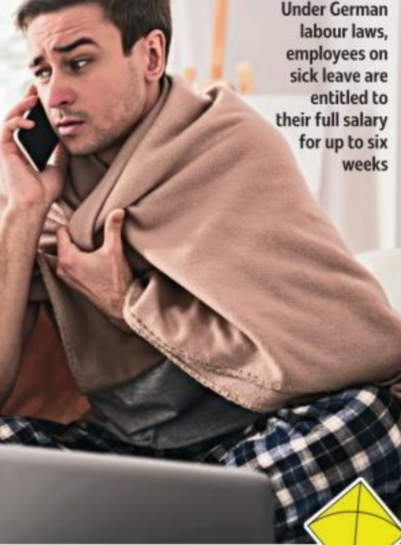
Under German labour laws, employees on sick leave are entitled to their full salary for up to six weeks

German companies are increasingly hiring private detectives to investigate employees suspected of abusing sick leave. Detective agencies report record demand, handling over 1,200 cases annually – double the number from recent years.