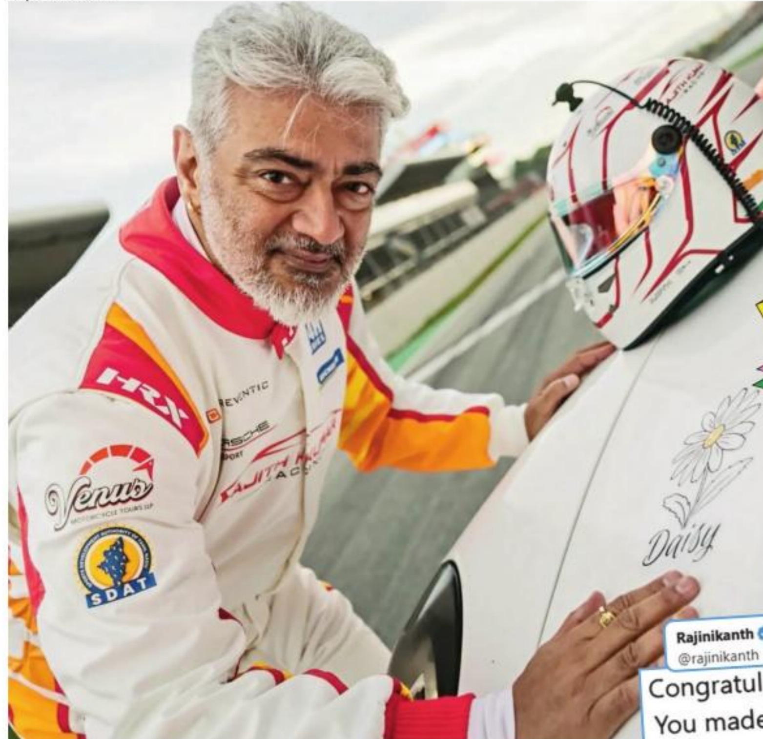
Ajith Kumar re-started his motor racing career recently and debuted at 24H Dubai

Tamil actor Ajith Kumar, who is known for films such as Valimai and Citizen , finished third at the 24H Dubai racing event on Sunday. Last week, the actor had a crash during practice sessions, leaving fans worried. His recent win became a celebratory moment for fans and peers alike.