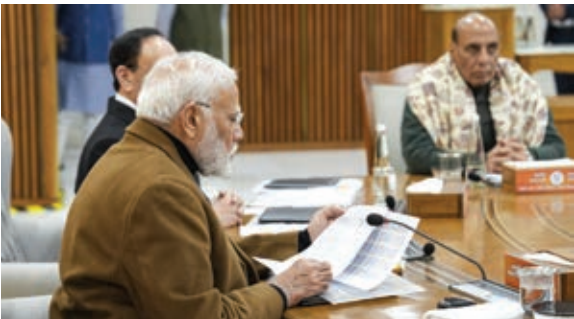
Prime Minister Narendra Modi with BJP president J.P. Nadda and defence minister Rajnath Singh during the party's CEC meeting in New Delhi on Friday.

myself. And, thirdly, I am human and I can make mistakes. But I will not do anything wrong out of bad intentions. I have made it a mantra of my life. Mistakes are inevitable. I must have made mistakes. I am a human too, not a god."