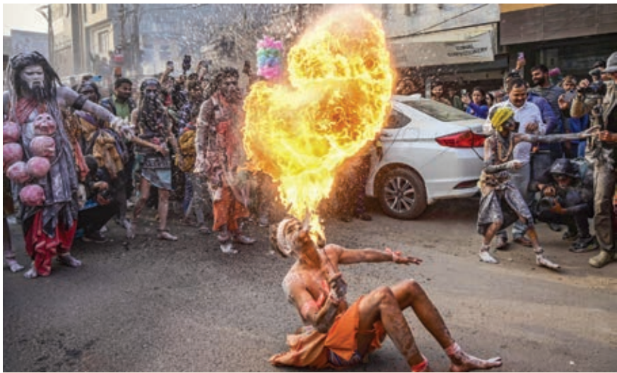
Artiste performs during the royal entry procession or “Chavni Pravesh” of Niranjani Akhara for the Maha Kumbh 2025 at Sangam in Prayagraj on Friday.

Kaziranga National Park, a Unesco World Heritage Site in Assam, has registered the highest footfall in the past two decades. Assam chief minister Himanta Biswa Sarma attributed it to Prime Minister Narendra Modi’s night stay in the park last year as one of the major reasons, the tour operators however said that better conservation and frequent spotting of Royal Bengal Tigers by tourists has drawn the attention of the tourists more. Famous for its iconic one-horned rhinoceros, new attractions for the visitors of the Kaziranga National Park are the river dolphins of the