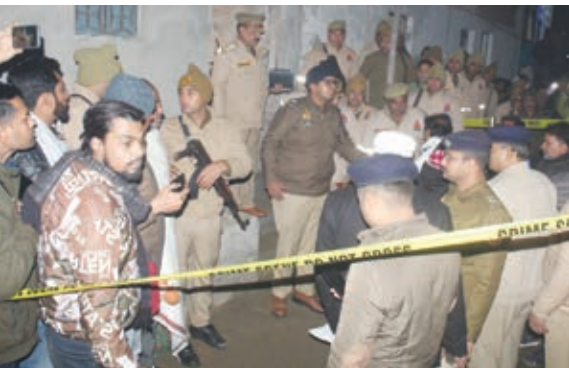
Police personnel conduct an investigation after five members of a family were found dead at their residence in Meerut, Uttar Pradesh, on Friday.

The police said the bodies of the husband and wife were found wrapped in bedsheets, while those of their three children were stuffed in the storage compartment of a bed at