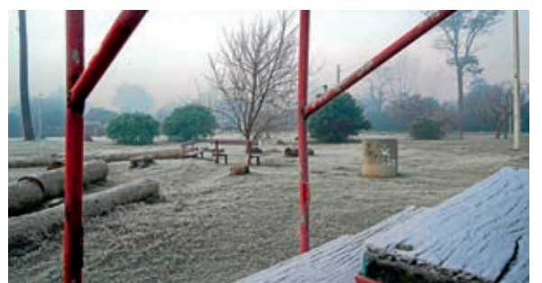
View of a children's square after a heavy frost fell due to low temperatures, in El Pinar, Canelones, Uruguay, on July 14, 2024. The year 2024 was the warmest globally since records began in 1850.

slightly. The primary reason for these record temperatures is the accumulation of greenhouse gases in the atmosphere from the burning of coal, oil and gas, said Samantha Burgess, strategic climate lead at Copernicus. As greenhouse gases continue to accumulate in the atmosphere, temperatures continue to increase, including in the ocean, sea levels continue to rise, and glaciers and ice sheets continue to melt. — PTI