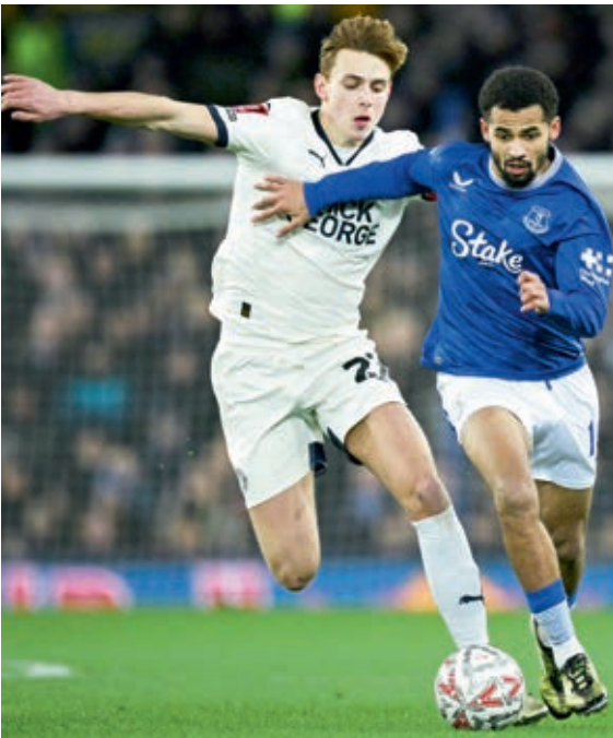
Peterborough's Cypriot midfielder Hector Kyprianou (left) fights for the ball with Everton's Senegalese striker Iliman Ndiaye during their English FA Cup third round match at Goodison Park in Liverpool, north west England, on Thursday. Everton won 2-0.