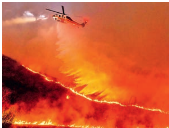
Water is dropped by helicopter on the Kenneth Fire in the West Hills section of Los Angeles on Friday.