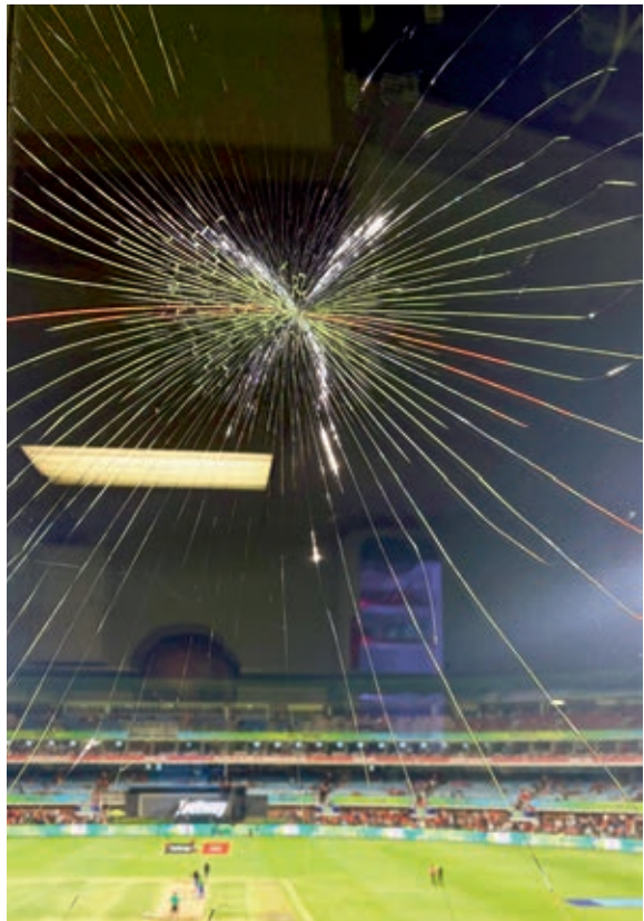
St George's Park press box glass smashed by cricketer Rinku Singh still tells the story of the Indian batter's remarkable hit, in Gqeberha, South Africa.

Changing the cracked window glass won't be an