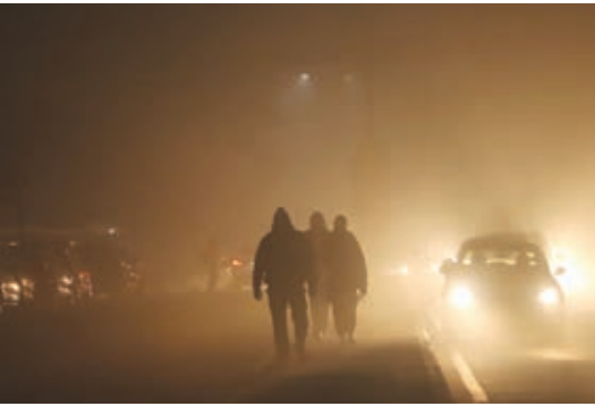
Commuters walk amid low visibility due to fog on a cold winter morning in New Delhi on Friday.

The WMO said the global average surface temperature in 2024 was 1.55 degree Celsius above the 1850-1900 base-line, the period before human activities, such as burning fossil fuels, began significantly impacting the climate. However, a permanent breach of the 1.5-degree Celsius limit specified in the Paris Agreement refers to long-term warming over a 20 or 30-year period. “Today’s assessment from the WMO proves yet again global heating