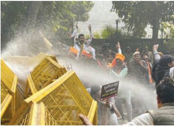
Water cannons being used to disperse the BJP members during a protest against the AAP in New Delhi on Friday for allegedly making "fake" claims regarding registration of voters from Uttar Pradesh and Bihar.

Reacting to the new poll promise by AAP, the BJP slammed Mr Kejriwal and