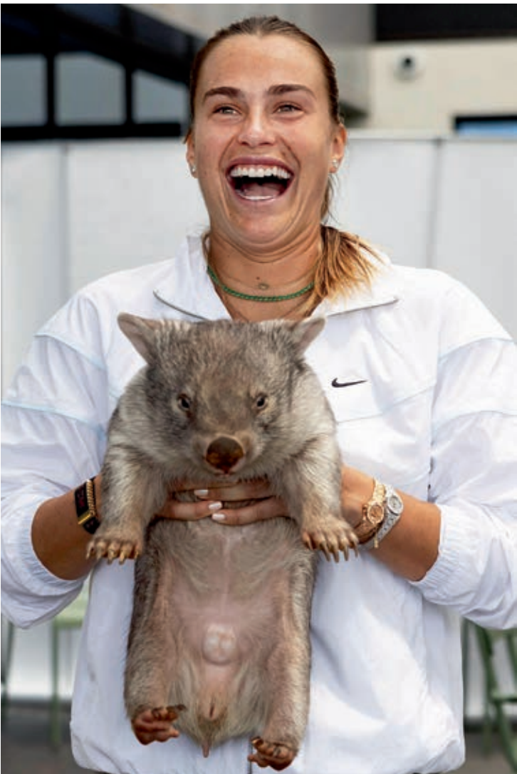
Aryna Sabalenka of Belarus reacts as she holds a wombat, a native Australian animal, ahead of the Australian Open in Melbourne.

Australian Open title and record 25th major, Murray made clear he was not in town for a holiday.