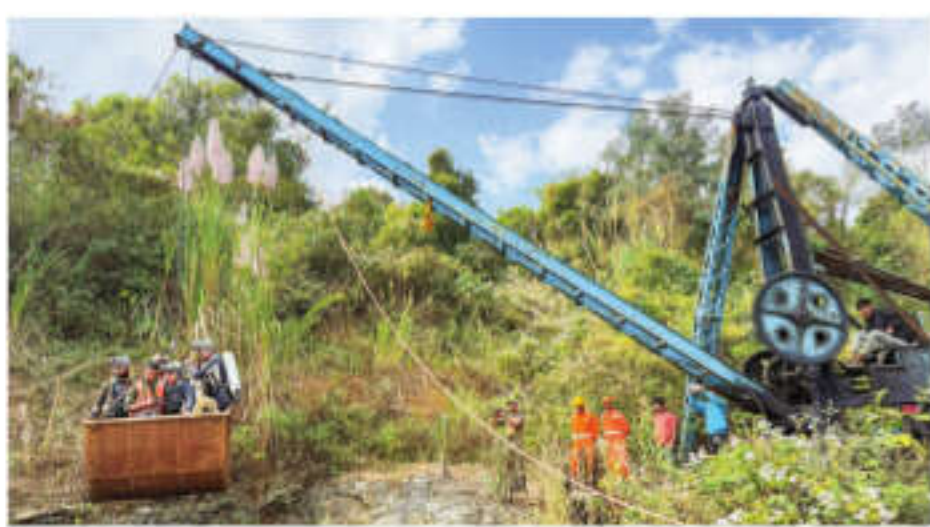
lifeless body from the bottom of the well. Our thoughts and

CM Sarma expressed his condolences on microblogging site X, saying: "21 Para divers have just recovered a