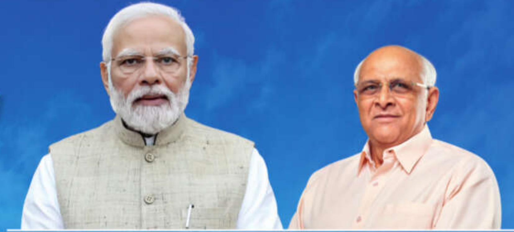
Shri Narendra Modi Hon'ble Prime Minister, India