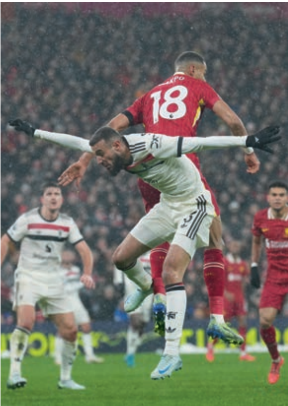
Liverpool's Cody Gakpo (top) and Manchester United's Noussair Mazraoui vie for the ball during their English Premier League match at the Anfield Stadium in Liverpool, England, on Sunday.