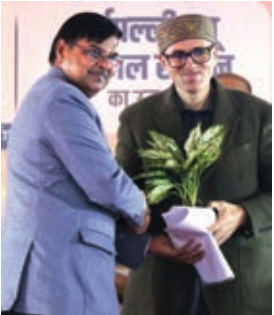
J&K chief minister Omar Abdullah during the inauguration of the new Jammu railway division and other projects in Jammu.

"The new Jammu railway division will be beneficial to all. We anticipate significant benefits, including a surge in trade and tourism, and we will ensure that Jammu reaps the rewards of this development as well," the CM said while speaking at the inaugural ceremony of the newly carved out rail division at Jammu. He added that Jammu will not suffer economic losses due to the direct rail link