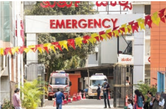
People outside the Emergency of Bangalore Baptist Hospital where two cases of the Human Metapneumovirus were detected on Monday.