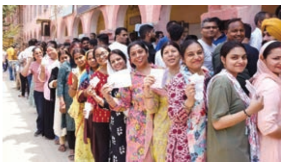
In this file photo women line up outside a polling station in New Delhi.

Mr Kejriwal in a post said, "Large-scale fraud taking place in voter additions and deletions in New Delhi Assembly. CM Atishi ji wrote a letter to CEC presenting evidence and seeking time to meet."