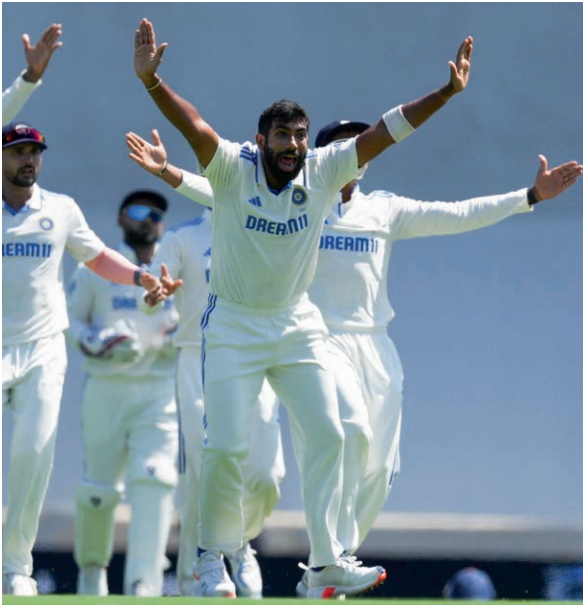
The cupboard in the fast bowling department is bare and it will take some time to prepare another crack line-up that can match up to the aura of Jasprit Bumrah (in pic), Mohammed Shami and Ishant Sharma.

It also confirmed their place in a clash against South Africa that will determine the world's most consistent red-ball side over the last two years from the nine teams contesting the WTC. "To hold the Border-