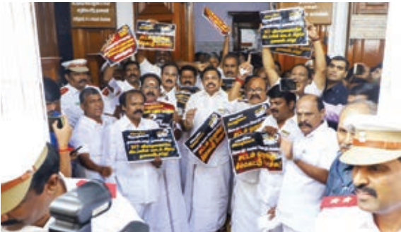
Leader of Opposition in Tamil Nadu Assembly Edappadi K. Palaniswami with party MLAs stages a protest during the Assembly session in Chennai on Monday.