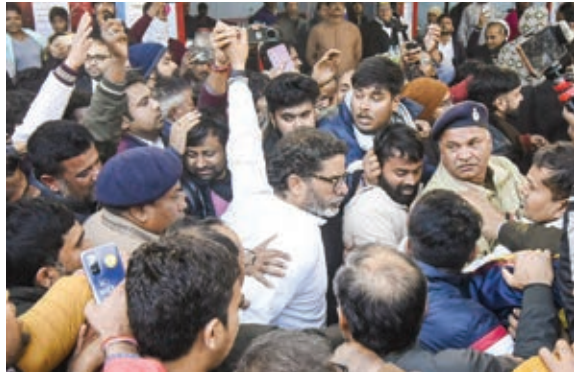
Jan Suraj Party chief Prashant Kishor leaves a local court in Patna on Monday.

The former poll strategist, who started his fast unto death on January 2, demanding, among other things, cancellation of the Combined Competitive