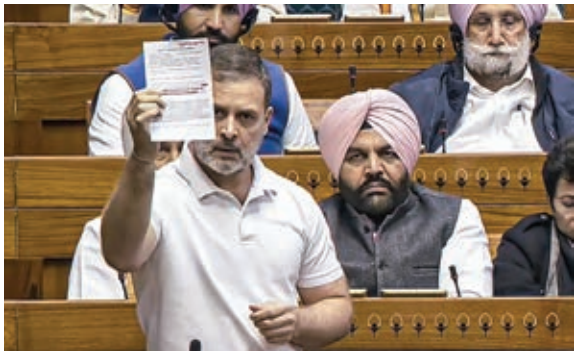
Leader of the Opposition in Lok Sabha Rahul Gandhi speaks in the House during the Winter Session of Parliament in New Delhi on Saturday.

However, Mr Shinde refused to yield, prompt-