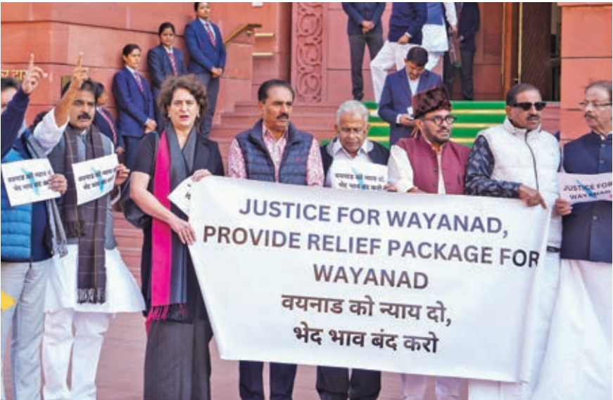
Congress MP Priyanka Gandhi and others stage a protest during the Winter Session of Parliament in New Delhi on Saturday, demanding a relief package for landslide-hit Wayanad.

However, Mr Shinde refused to yield, prompt-