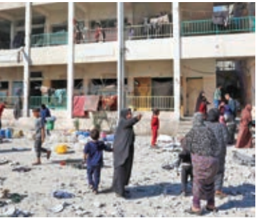
People inspect the damage following an Israeli strike on the UNWRA Al-Majda Wasila Governmental School housing displaced Palestinians, on al-Jalaa Street in Gaza City on Saturday. — AFP

and will not create any obstacle for the agency's inspections and access," Atomic Energy Organisation head Mohammad Eslami was quoted as saying by Iranian media. "We operate within the framework of safeguards, and the agency also acts according to regulations — no more, no less." — Reuters