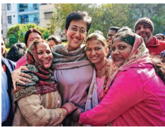
Delhi CM and AAP leader Atishi during 'Rewri Pe Charcha' in New Delhi on Saturday.

Raising concerns about public safety, Mr Kejriwal said, "In the past six months, there have been over 300 bomb threat calls