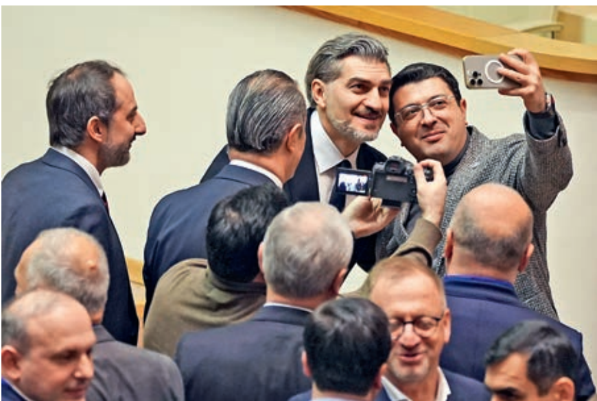
Georgian President-elect Mikheil Kavelashvili (second right) poses for a selfie at the Georgian Parliament, in Tbilisi, Georgia, on Saturday.