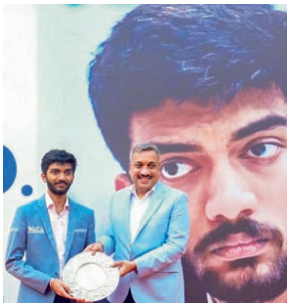
India's High Commissioner to Singapore Shilpak Ambule (right) felicitates World chess champion Gukesh Dommaraju in Singapore on Saturday. — PTI

The five-match series remains locked at 1-1, with India winning the first game in Perth by 295 runs before Australia fought back with a 10-wicket victory in Adelaide. — PTI