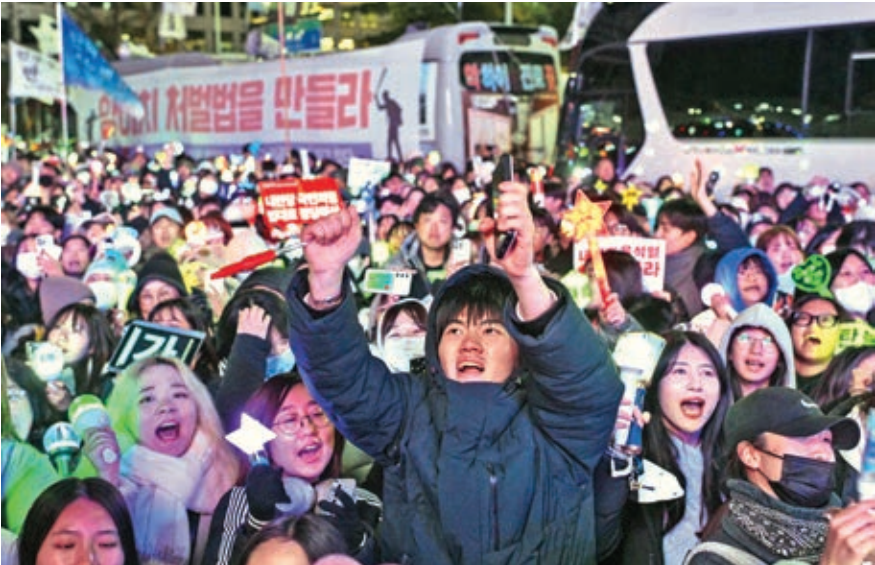
Protesters calling for the ouster of South Korea President Yoon Suk Yeol react after the result of the second martial law impeachment vote outside the National Assembly in Seoul, on Saturday.

It was the second National Assembly vote on Yoon's impeachment after ruling party lawmakers boycotted it last Saturday.