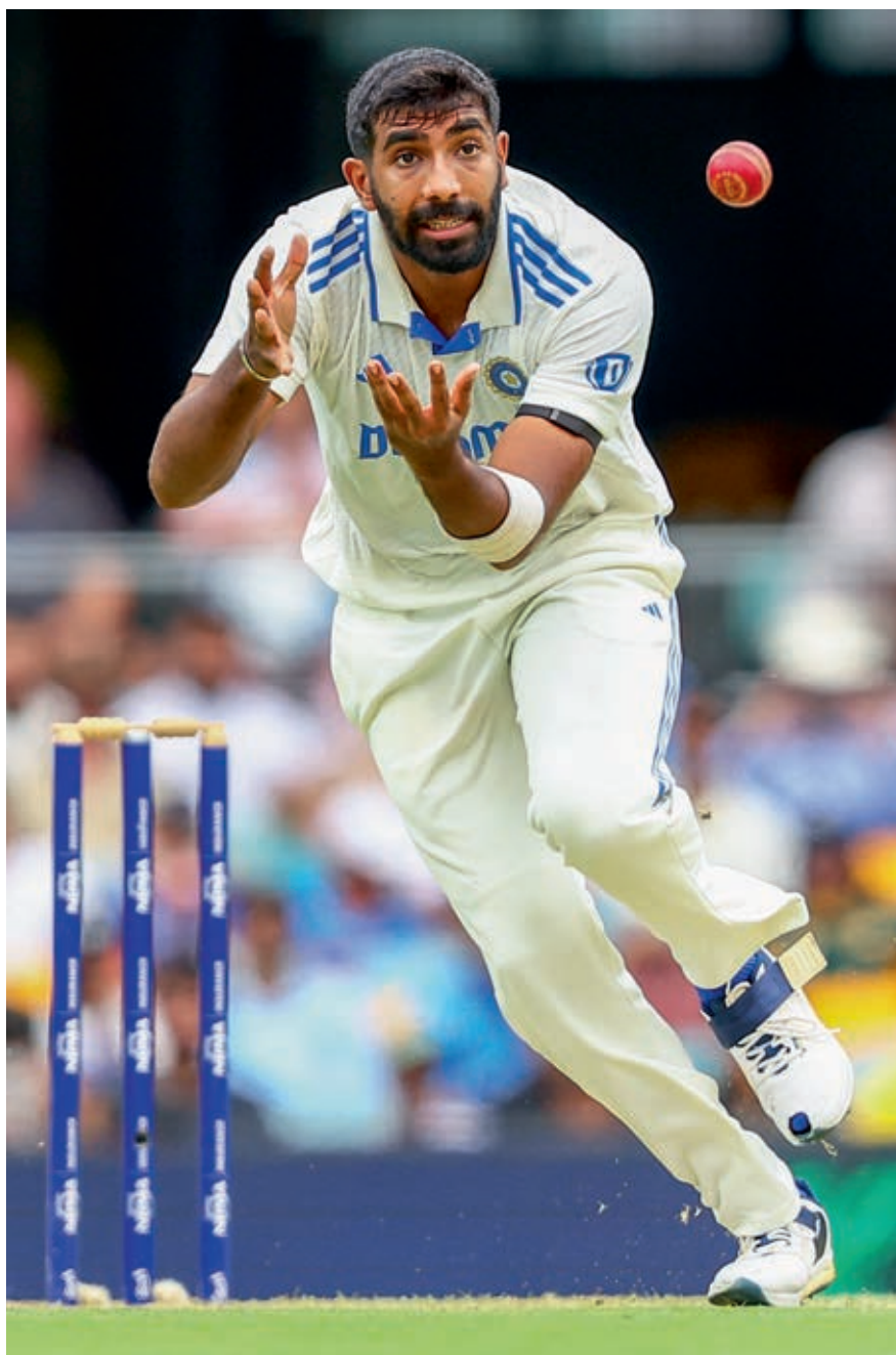
Indian fast bowler Jasprit Bumrah reaches fields a ball off his own bowling during Day One of the third Test against Australia at the Gabba in Brisbane on Saturday.

While McSweeney defended dourly, Khawaja did pull Siraj for a bound-