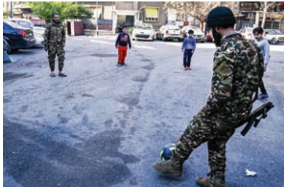
Rebel fighters play football with kids at the entrance of the Syrian General Intelligence Directorate Branch 251, in the capital Damascus, on Saturday.

Yoon's December 3 imposition of martial law, the first of its kind in more than four decades in South Korea, lasted only six hours, but has caused massive political tumult, halted diplomatic activities and rattled financial markets. Yoon was forced to lift his decree after parliament unanimously voted to overturn it. — Agencies