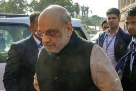
Union home minister Amit Shah during the Winter Session of Parliament in New Delhi on Saturday.

The Union minister is scheduled to land at Raipur airport at 11 pm on Saturday and spend night in a private resort here