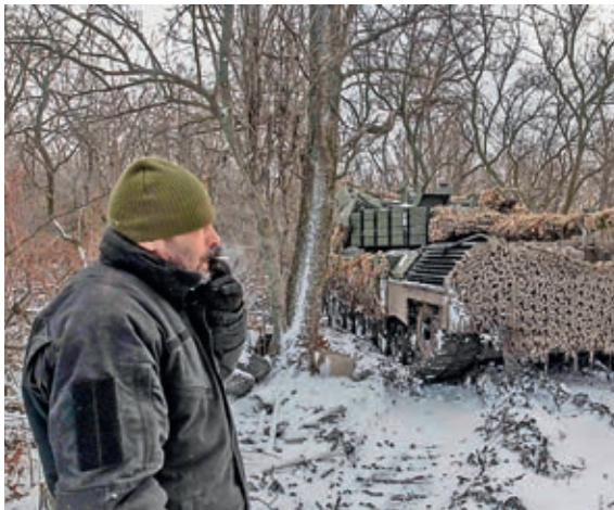
A Ukrainian tank crew member of the 68th Jaeger Brigade smokes next to a Leopard 1A5 tank at the position where they take a break in fighting, near Pokrovsk, the eastern Donetsk region.

Last month President Volodymyr Zelenskyy replaced several other generals, saying changes were needed. Kyiv is also trying to build ties with US President-elect Donald Trump, whose promise to end the war swiftly has raised concerns in Ukraine that it could be largely