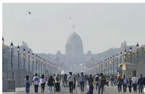
Visitors at the India Gate on a sunny day in New Delhi on Saturday.