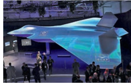
Britain, Italy and Japan will set up a joint company to develop, design and build an advanced stealth jet.

"Peace must be defended and defending peace has a cost, that's why synergies among governments and companies are fundamental, nobody can make it on its own... and (the GCAP) is a terrific example," Leonardo CEO Roberto Cingolani said at the deal signing. The three countries said in November they were discussing opening up the project to other countries.