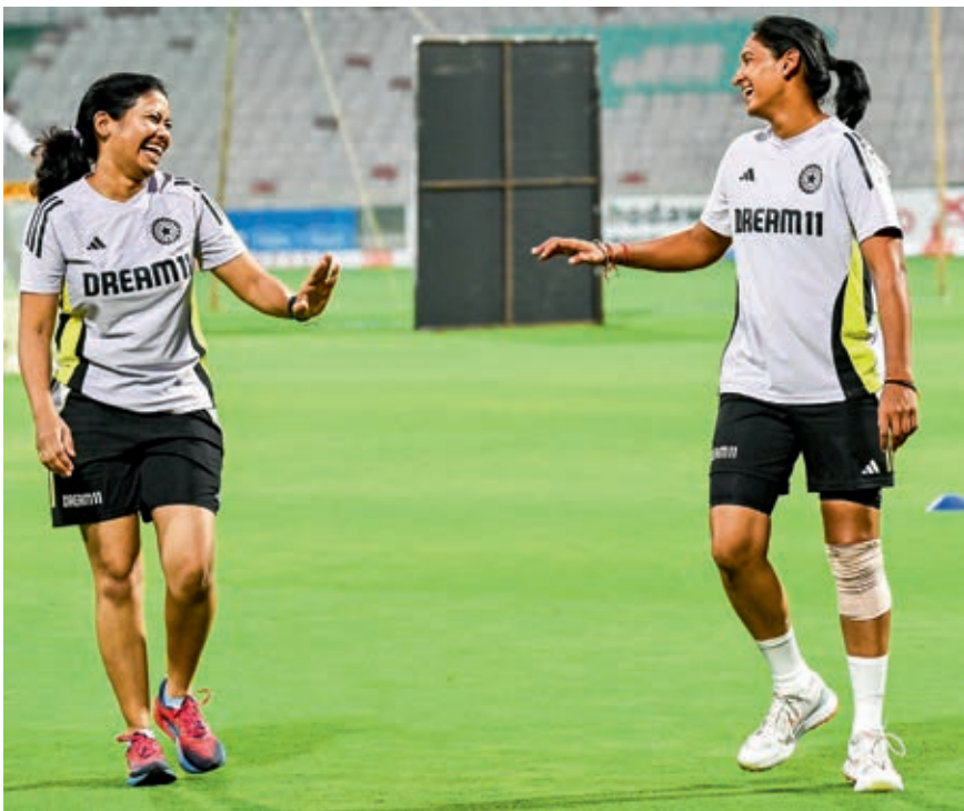
Captain Harmanpreet Kaur (right) shares a light moment with a teammate during a training session of the Indian women's cricket team ahead of their T20 match against West Indies at D. Y. Patil Stadium in Navi Mumbai on Saturday.

Southee, playing his 107th and final Test for New Zealand, reached the milestone in the match against England at the Seddon Park. Southee hammered three sixes in his quick-fire 10-ball 23 which also included one four as New Zealand reached 315 for 9 at stumps on the opening day.