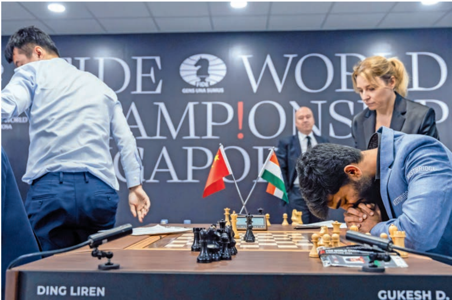
Indian Grand Master D. Gukesh (right) reacts after beating title-holder China's Ding Liren in the 14th and last game of the World Chess Championship in Singapore on Thursday.

Gukesh had entered the match as the youngest ever challenger to the world crown after winning the Candidates tournament earlier this year. — PTI