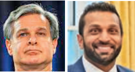
Christopher Wray (L) and Kash Patel

The move has been welcomed by Trump. “After weeks of careful thought,