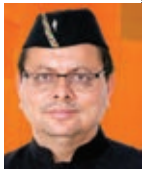
Pushkar Singh Dhami

Uttarakhand chief minister Pushkar Singh Dhami on Thursday announced that his government is working towards implementing the country's "first" yoga policy. It will play an important role in bringing about a new revolution in the field of health by bringing ayurveda and yoga together on a big scale, he said. Addressing the 10th Ayurveda Congress and Arogya Expo 2024 in Dehradun, which began on Thursday, Mr Dhami described Uttarakhand as the land of Ayurveda since ancient times because of its herbal wealth. More than 3,000 ayurveda experts and delegates from 50 countries are attending the three-day event, with Uttarakhand being the first Himalayan state where the event is being held. "We will be the first state in the country to put in place our own yoga policy. The policy will play a crucial role in integrating ayurveda and yoga as key aspects of wellness and the healthcare sector. This is a proud moment for Uttarakhand and my government to make this announcement," the Uttarakhand CM said. Mr Dhami also thanked Prime Minister Narendra Modi for providing the state an opportunity to host the event.