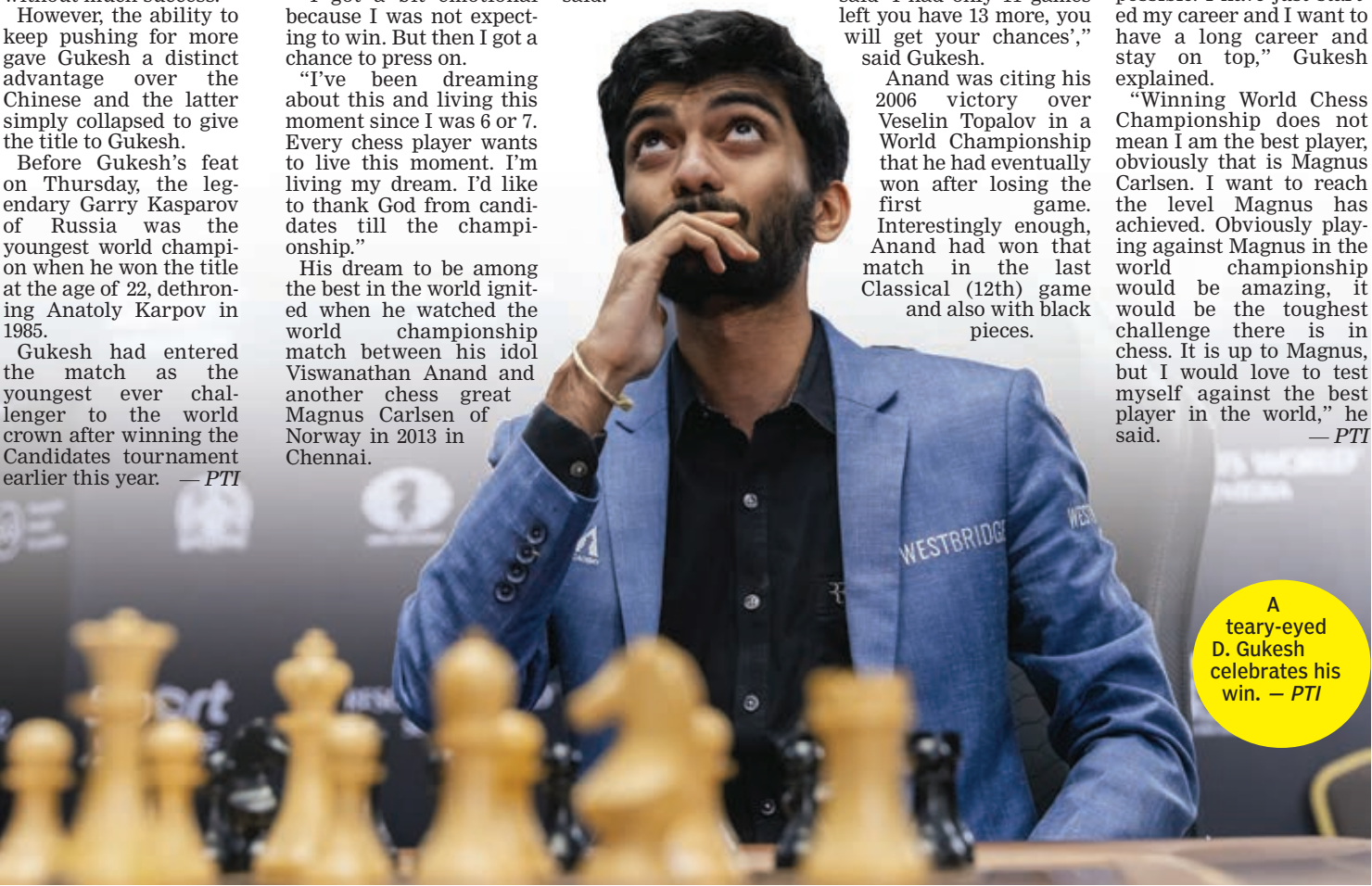
A teary-eyed D. Gukesh celebrates his win.

"Winning World Chess Championship does not mean I am the best player, obviously that is Magnus Carlsen. I want to reach the level Magnus has achieved. Obviously playing against Magnus in the world championship would be amazing, it would be the toughest challenge there is in chess. It is up to Magnus, but I would love to test myself against the best player in the world," he said.