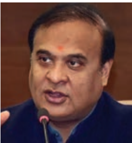
Himanta Biswa Sarma

He stated that the state government decided to issue a standard operating protocol for future issuance of Aadhaar cards, which will make it mandatory for one to furnish their NRC Pointing