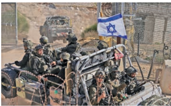
Israeli soldiers with the national flag stand on an armoured vehicle after crossing the security fence near the so-called Alpha Line, in the town of Majdal Shams, on Thursday.

The votes culminated two days of speeches overwhelmingly calling for an end to the 14-month war between Israel and the militant Hamas group. Israel and the US were in a tiny minority speaking and voting against the resolutions.