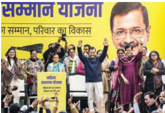
Delhi chief minister Atishi with AAP national convener Arvind Kejriwal during an event outside the party office in New Delhi on Thursday.

With an eye on the upcoming Delhi Assembly elections, AAP national convener and former chief minister Arvind Kejriwal on Thursday announced that the monthly allowance to women under the Mahila Samman Rashi Scheme would be increased to ₹2,100 from ₹1,000 if his party returns to power. The scheme, under which the AAP-led Delhi government announced ₹1,000 per month in the budget this year, was approved by the Cabinet headed by chief minister Atishi on Thursday. However, the initial payment of ₹1,000 will be credited only after the elections, Mr Kejriwal said, pointing out the poll dates to be announced in 10-15 days, thus making it impossible to transfer the money now. An amount of ₹2,000