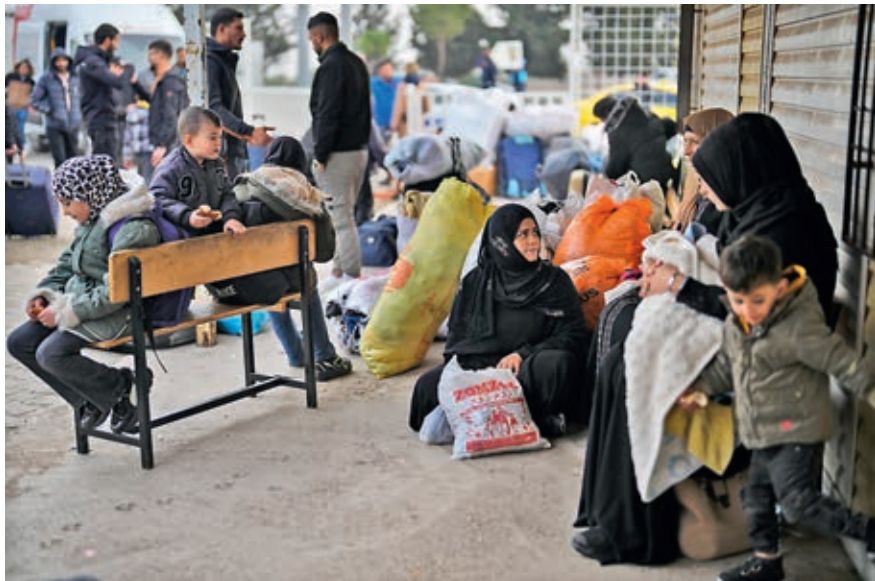
Syrians wait to cross into Syria from Turkey at the Oncupinar border gate, near the town of Kilis, in southern Turkey, on Thursday.

Mohammed al-Bashir, who headed the rebels’ self-proclaimed “Salvation Government” in their northwestern bastion of Idlib, as the country’s transitional Prime Minister until March 1.