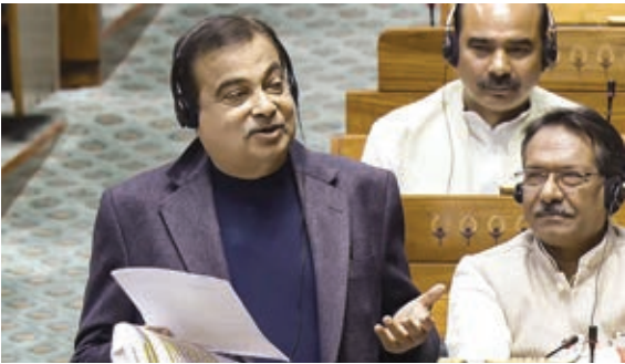
Union transport minister Nitin Gadkari speaks in the Lok Sabha during the Winter Session of Parliament in New Delhi on Thursday.

"Forget about reducing the number of accidents, I have no hesitation to