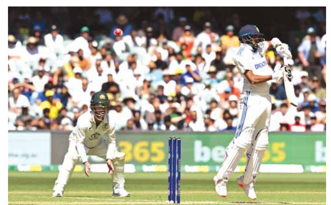
India's Mohammed Siraj (right) evades a short ball from Australia's captain Pat Cummins on the third day of the second Test at the Adelaide Oval vesterday.

Defeat was another painful memory of Adelaide for India, who also crashed within three days in 2020 when they were bundled out for 36 - their lowestever Test score.