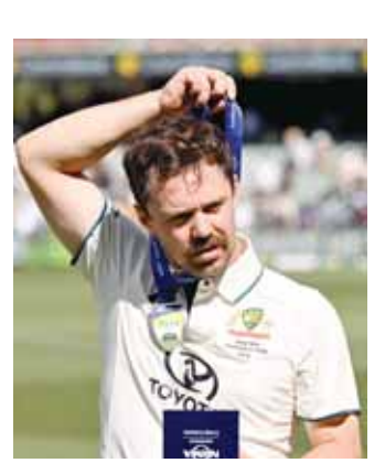
Australia's Travis Head holds his Man of the Match medal yesterday.

Victory capped a fighting turnaround for Australia after being crushed by 295 runs in the first Test, which sparked fierce criticism over whether the topranked but ageing team could still