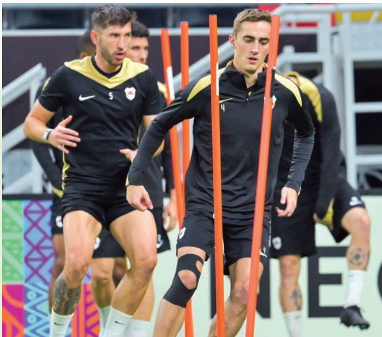
Al Rayyan players in action during a training session yesterday.