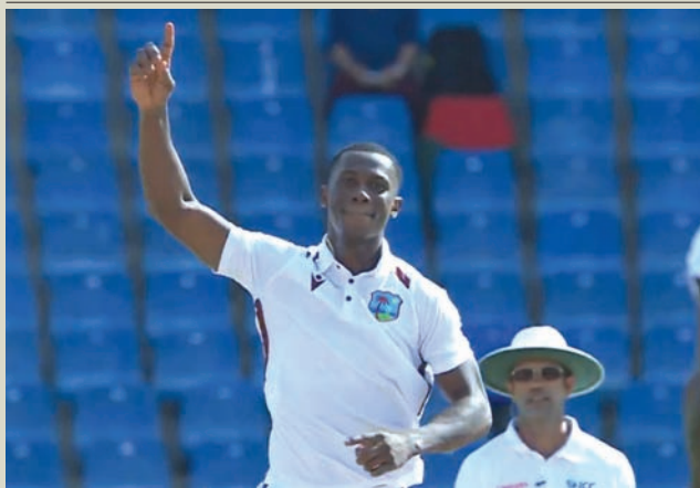
West Indies' Shamar Joseph celebrates a wicket on day three of the first Test against Bangladesh in North Sound, Antigua and Barbuda, yesterday. Bangladesh were 203 for 6 wickets an hour after lunch. Earlier West Indies declared at 450 for 9 wickets. Justin Greaves hit a maiden Test century as West Indies piled on the runs against Bangladesh to take command of proceedings.