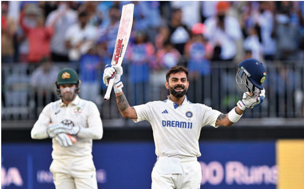
India's Virat Kohli celebrates reaching his century during day three of the first Test against Australia at Optus Stadium in Perth yesterday.

aided by a flattening pitch, Jaiswal brought up his fourth test hundred within the first hour audaciously upper-cutting Hazlewood (1-28) to deep fine leg.