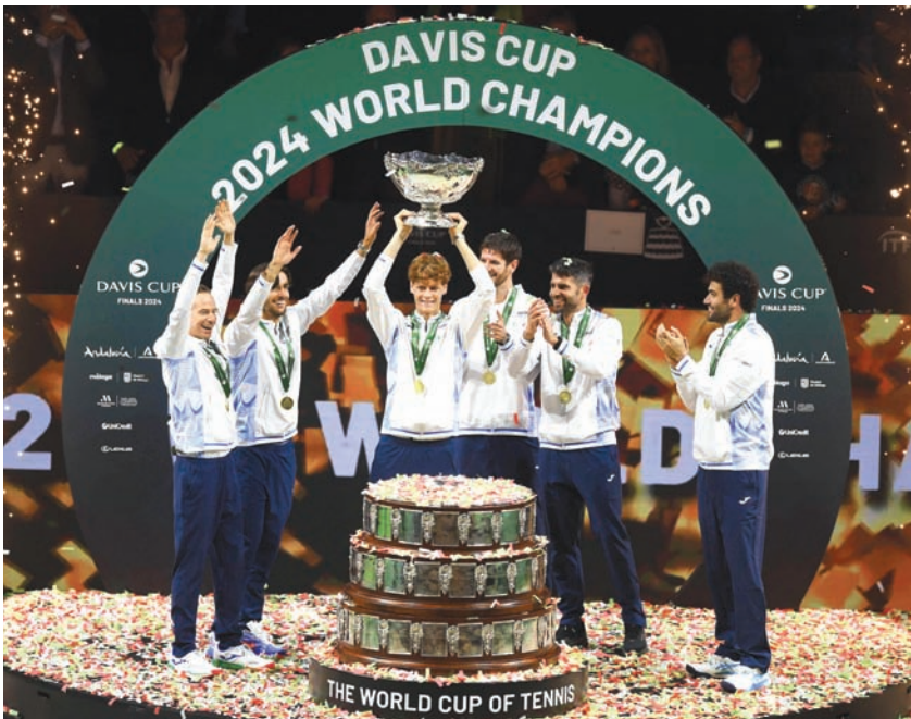
Italy’s Jannik Sinner raises the trophy with teammates after winning the Davis Cup Finals at the Palacio de Deportes Jose Maria Martin Carpena arena in Malaga, southern Spain, yesterday.

Van de Zandschulp, who ended Rafa Nadal’s glittering career earlier in the week, never got going against an inspired Berrettini. Sinner was kept on his toes during a closely fought first set but eventually overwhelmed Griekspoor in the second to maintain his perfect record during this week’s competition.