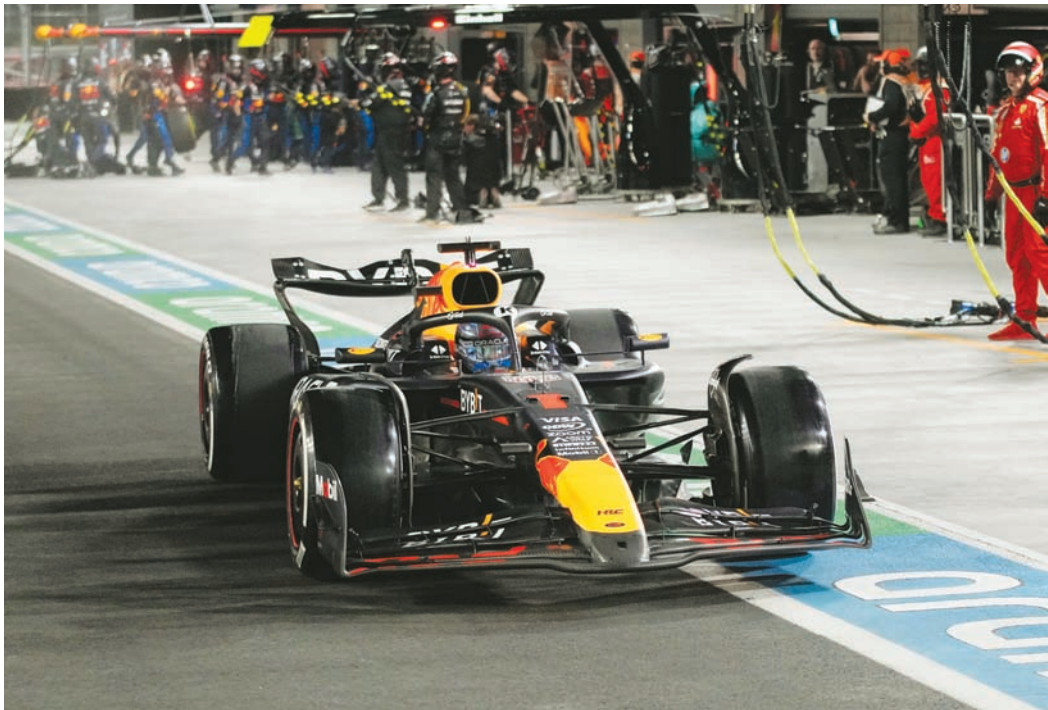
Red Bull’s Max Verstappen is seen in the pits during the race at Las Vegas Grand Prix in Las Vegas yesterday.

“I was planning on flying in a couple of hours but I’m definitely