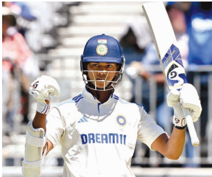
India's Yashasvi Jaiswal celebrates as he reaches 150 runs on day three of the first Test against Australia in Perth yesterday.