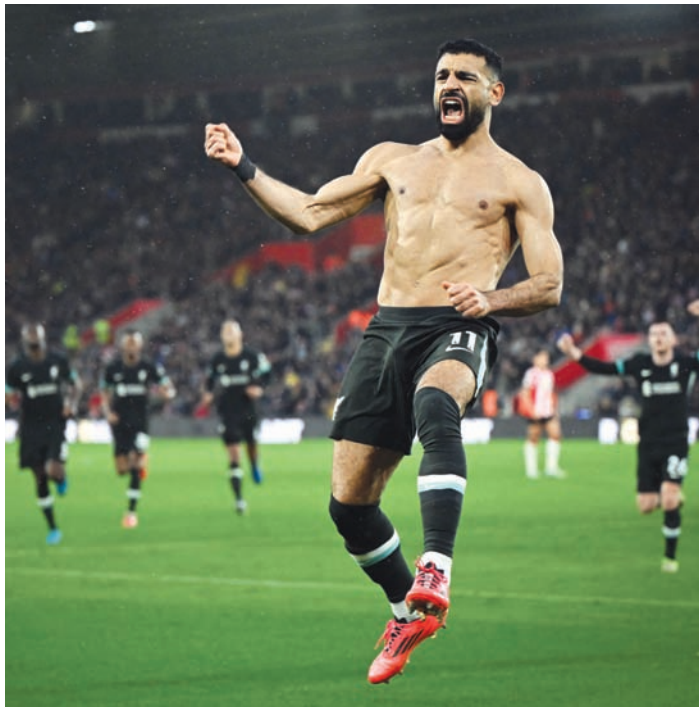
Liverpool's striker Mohamed Salah celebrates after scoring his team's third goal during the English Premier League match against Southampton at St Mary's Stadium in Southampton yesterday.