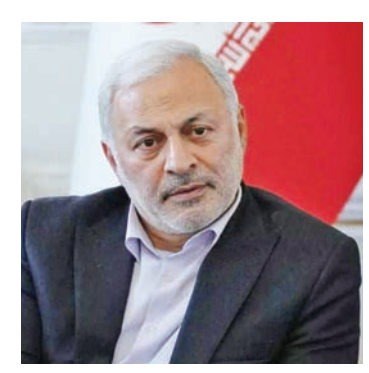
Deputy Foreign Minister for Consular Affairs Vahid Jalalzadeh

The Iranian Foreign Ministry has emphasized its commitment to safeguarding the well-being and rights of its citizens abroad and has vowed to pursue this case through appropriate diplomatic and legal channels.