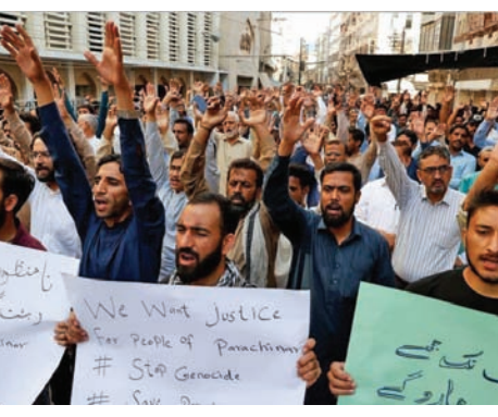
Armed extremists laid siege to Parachinar between 2007 and 2012, hindering the supply of essentials which led to the tragic loss of hundreds of lives.

The recent developments underscore the urgent necessity for the Pakistani government with the help of peace activists, civil society organizations, and high-profile figures to draw up