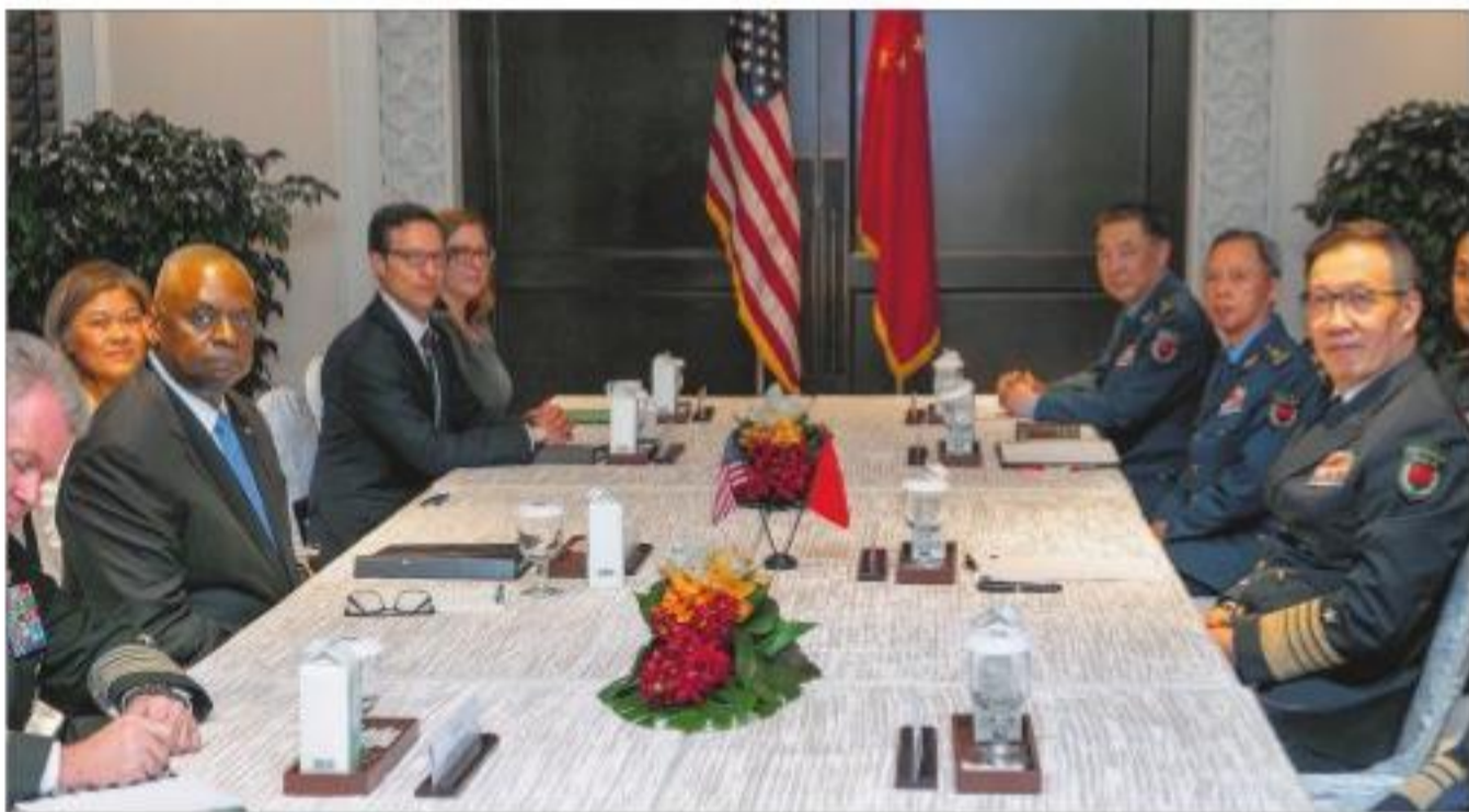
IN FULL GLARE: The recent Shangri-La Dialogue has highlighted to the world a facet of China's behaviour that India has experienced for a long time.

The most significant observation was that China seemed to have unilaterally usurped the mantle of leadership of Asia-Pacific, articulating its