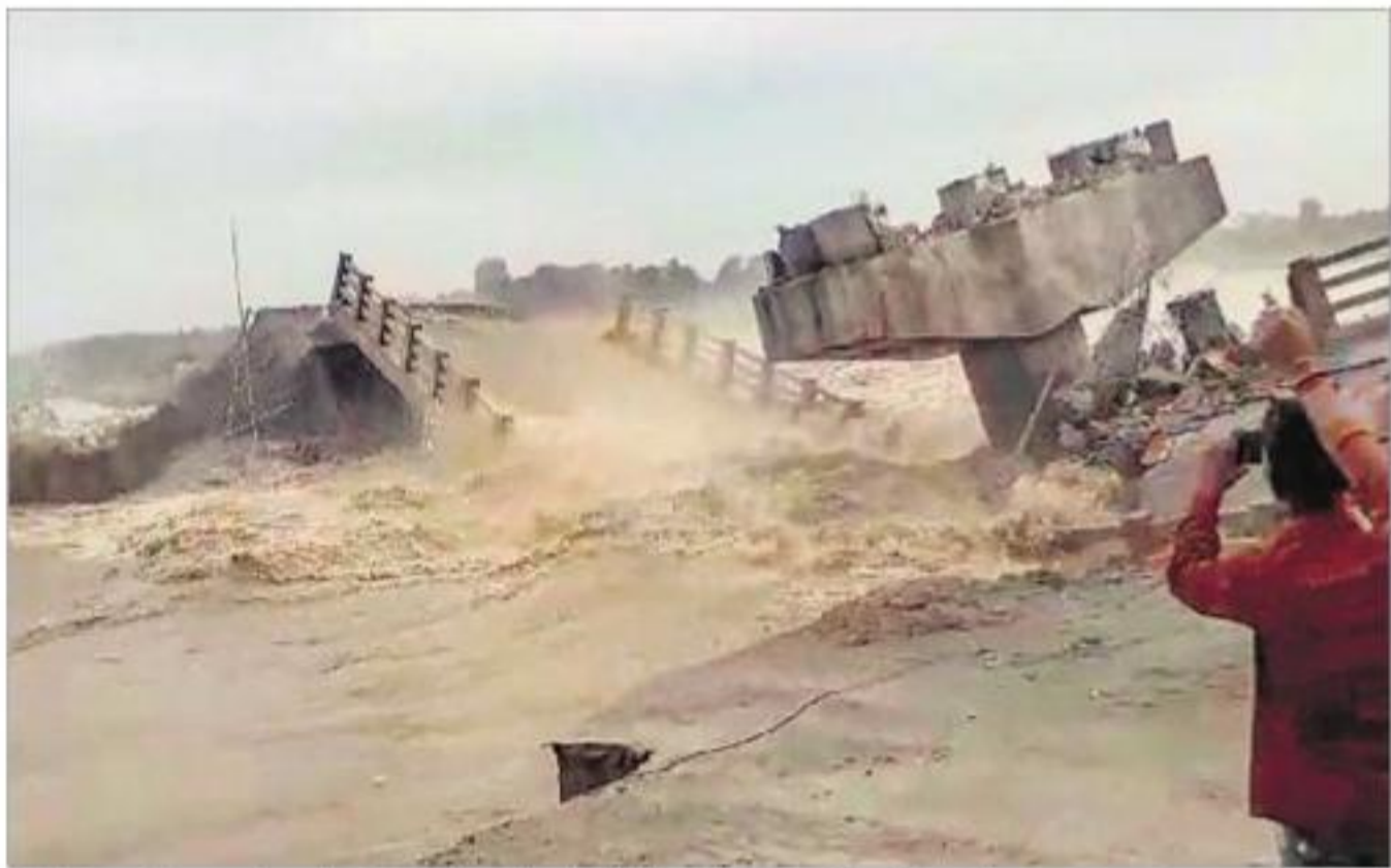
A bridge collapses into the Bakra river in the Sikti block area of Araria in Bihar on Tuesday.