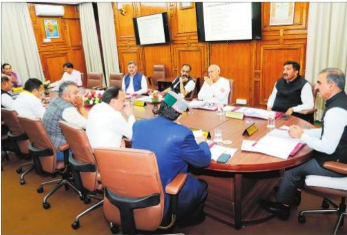
Chief Minister Sukhvinder Singh Sukhu presides over the Cabinet meeting in Shimla on Tuesday.

In another significant development, the Cabinet gave nod to giving one-time relaxation of one year in the upper age limit to candidates appearing for recruitment in 1,226 posts of constable in the Police Department. Now, general candidates between the age of 18 and 26 years, SC/ST, OBC, Gorkhas, distinguished sportspersons between 18 and 28 years and Home Guards between