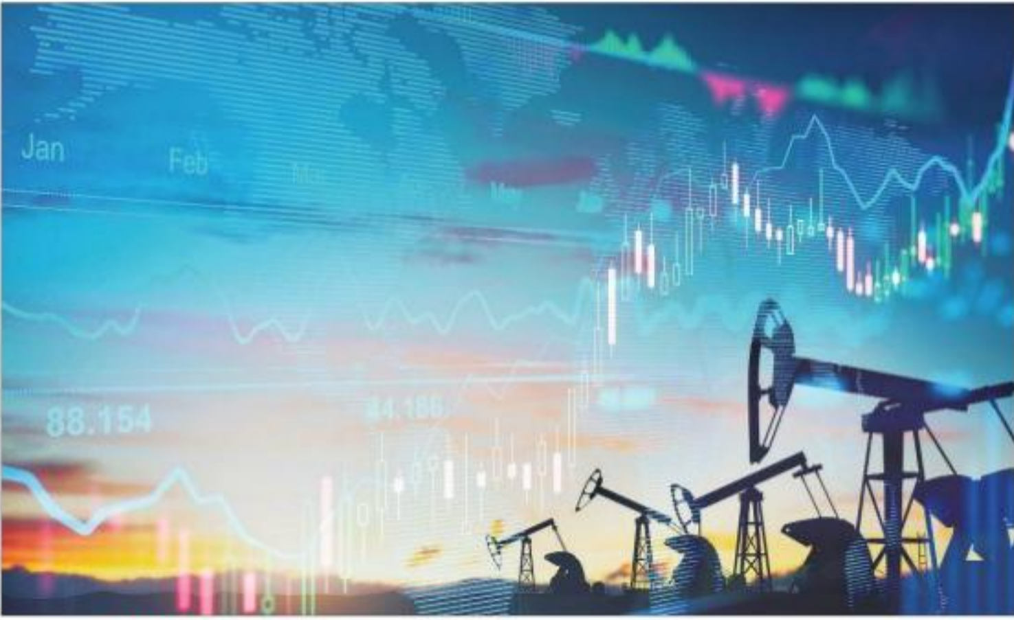
BEARISH: It is a favourable time to bring petroleum products under the GST ambit.

The outlook on the oil front had in April been rather dismal. At the time, crude prices had shot up to $90 per barrel for the benchmark Brent crude after having been below $80 since January. The spike occurred due to an escalation of the West Asia crisis, with Iran launching strikes against Israel. Prospects looked dim then for any improvement in view of deepening