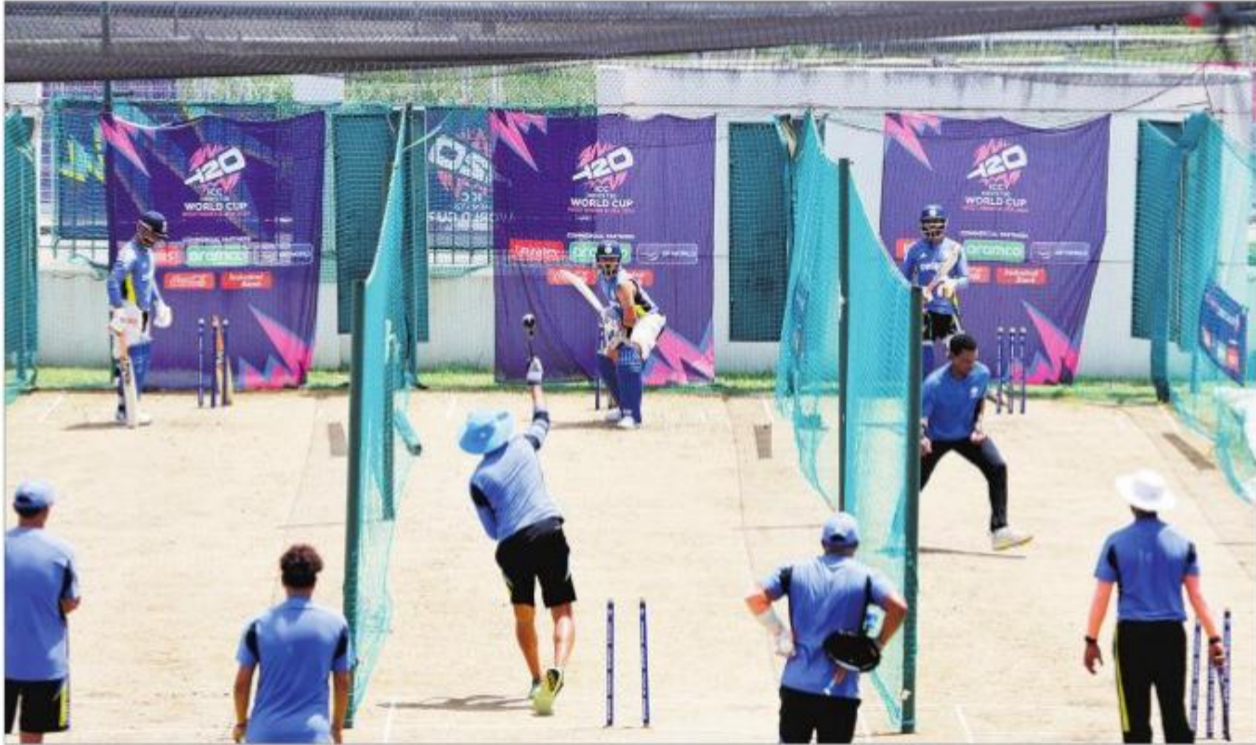
India's cricketers during a practice session in Barbados; BELOW: Coach Rahul Dravid inspects the pitch.

The Indian team had an extended practice session on Monday with senior players like Virat Kohli and Rohit spending more-than-usual time in the nets. "There is real keenness in the group to go and do something special. That's a good way to start the second stage. It clearly shows that everyone wants to make a difference and we take our skill sessions quite seriously," Rohit said. "There is something to achieve in every skill session that you do," he added. The Indian team endured hostile batting conditions during the US leg due to the drop-in pitches used by the organisers. Rohit said the Caribbean leg brings with it a sense of familiarity and his team would look to make the