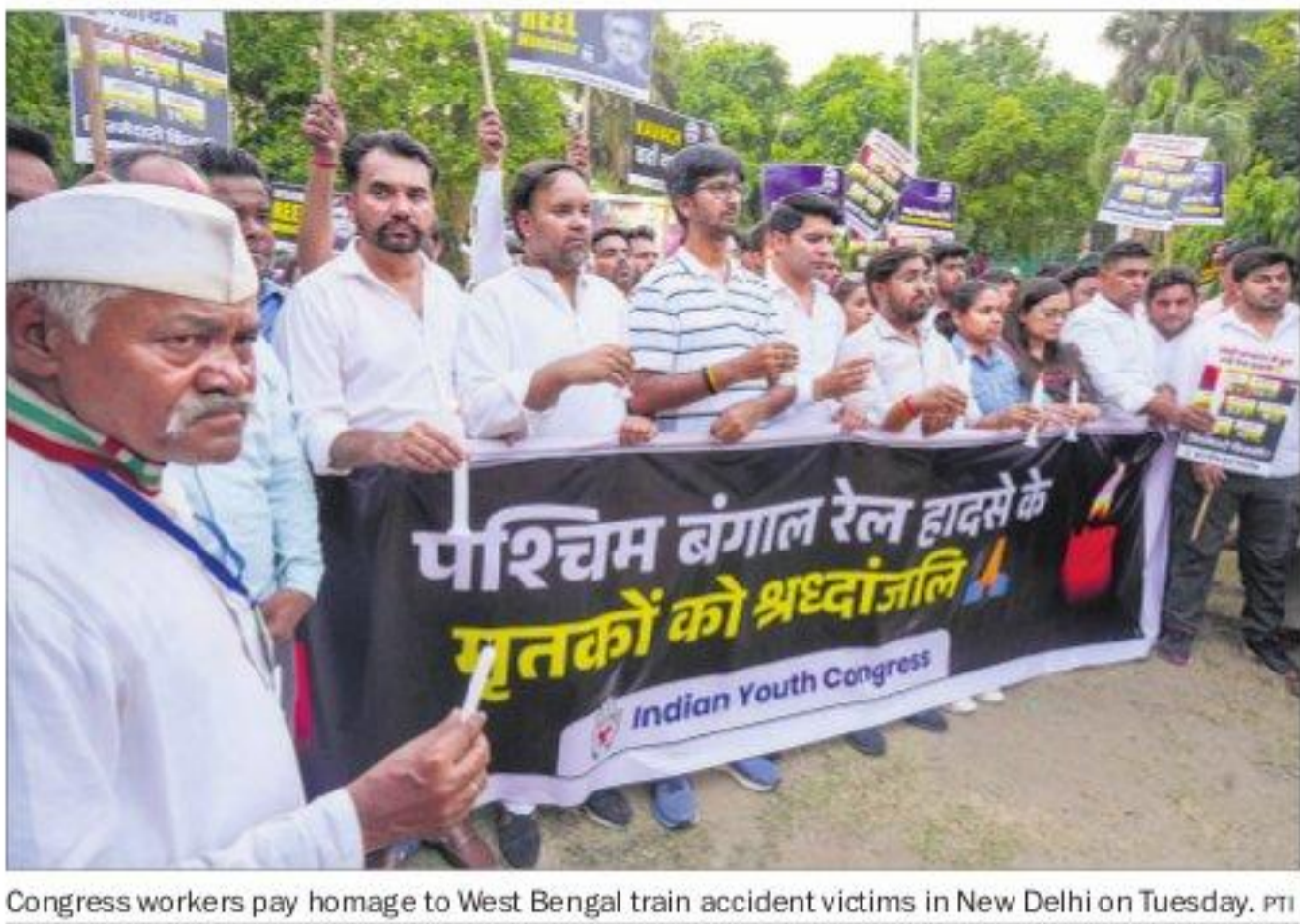
Congress workers pay homage to West Bengal train accident victims in New Delhi on Tuesday.