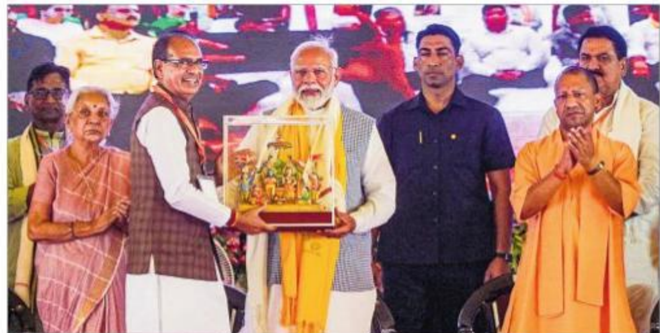
PM Narendra Modi being felicitated by Union minister Shri Singh Chouhan in Varanasi on Tuesday.