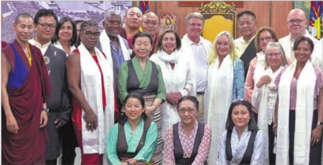
The US delegation at the Tibetan Parliament-in-exile in Dharamsala on Tuesday.

DHARAMSALA, JUNE 18 A high-profile US Congressional delegation on a visit here and the Speaker of the Tibetan Parliament-in-exile, on Tuesday, "targeted" China on the issue of autonomy for Tibet. Reacting to the US delegation's visit to Dharamsala, China said it was "gravely concerned" and asked the US to honour commitments that it made to Beijing on the issues related to Tibet of not having any contact with the Dalai Lama group and stop sending the 'wrong signal' to the world. The delegation, which includes former US House Speaker Nancy Pelosi, is scheduled to meet Tibetan spiritual leader Dalai Lama here on Wednesday. The meeting will be at the main Buddhist temple in this hill town. Speaking in the House of the Tibetan Parliament-in-exile, Michael McCaul, Chairman of the Foreign Affairs Committee of the US House,