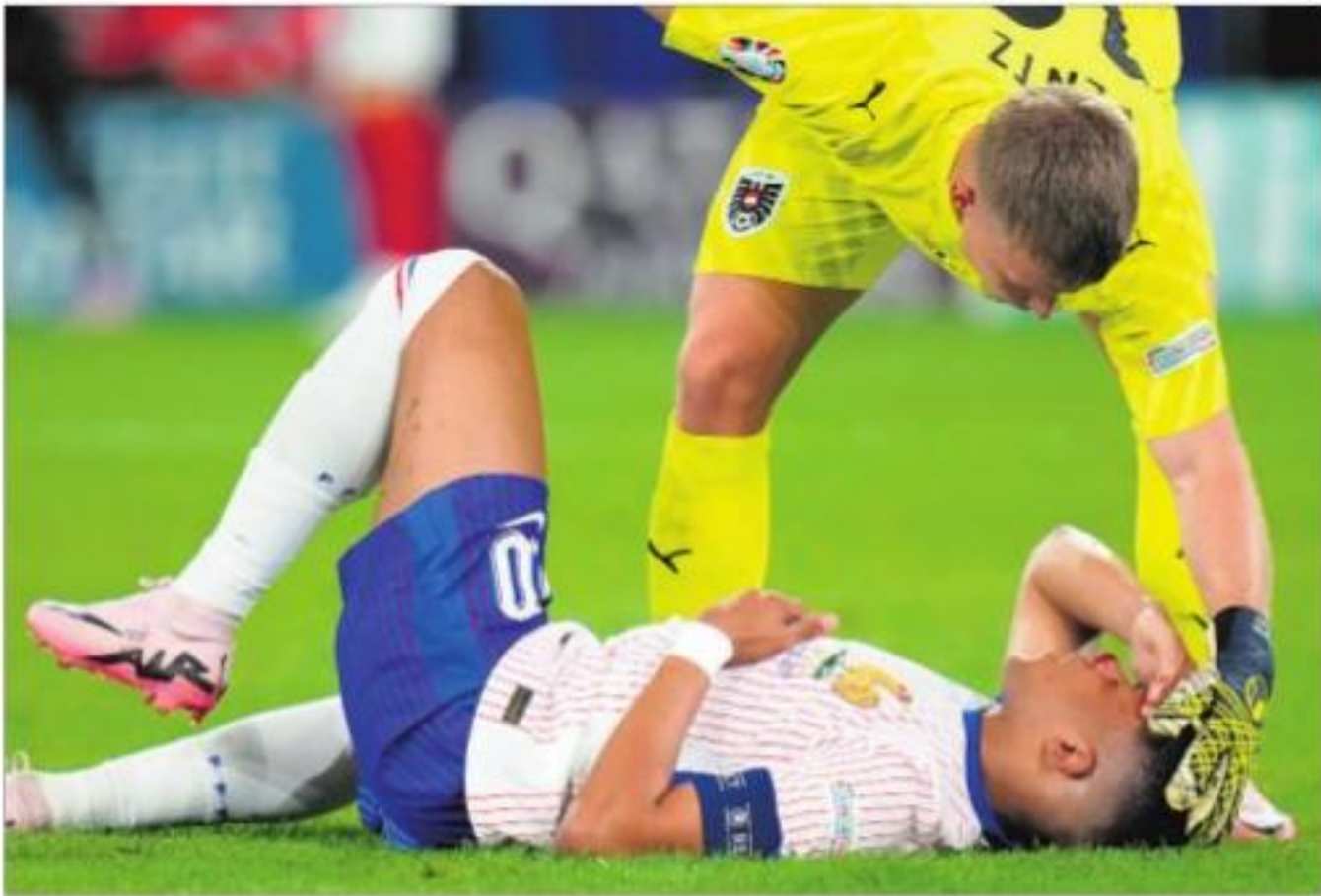
France's Kylian Mbappe after suffering an injury during their match against Austria.

DUESSELDORF, JUNE 18 France delivered a 100th victory for manager Didier Deschamps as they edged a tenacious Austria side 1-0 in their opening Group D match at Euro 2024 on Monday but it came at a cost as talisman Kylian Mbappe suffered a broken nose. It was by no means a vintage performance and France required an own goal by Austria defender Max Wober shortly before half-time to secure the three points that put them level with the Netherlands whom they face next on Friday. However, three years after bowing out of Euro 2020 in the last-16 to Switzerland on penalties, France offered enough evidence to suggest they will be go much deeper in Germany with returning midfielder N'Golo Kante pulling off a magnificent performance. It proved a decidedly mixed night for captain Mbappe though as he was left still searching for his first goal in a European Championship after some