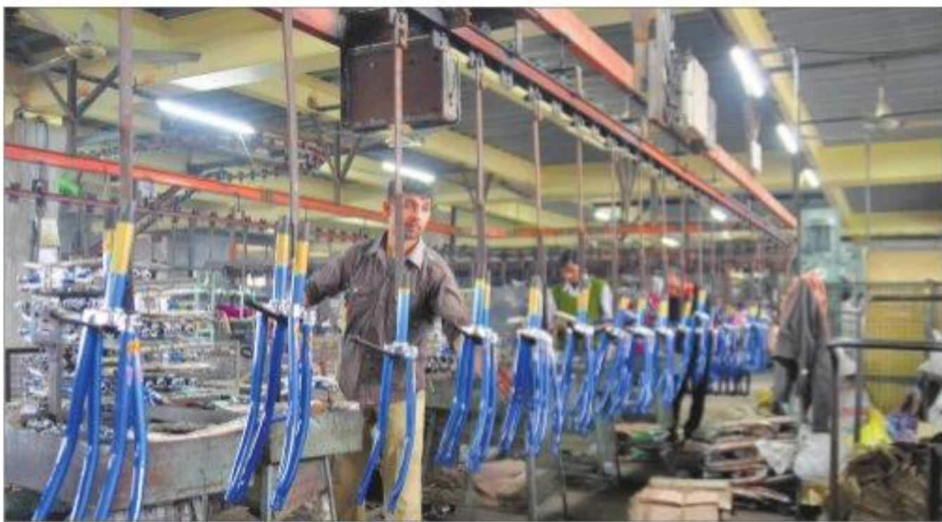
WORRISOME: Deficiency of human capital as well as investment is a major area of concern.

straint is the dysfunctionality of the fiscal policy. It was in the mid-1980s that the revenue-surplus state turned revenue-deficit for the first time. It was the peak period of turmoil in Punjab when most of the organisations and institutions turned non-functional, including the revenue collection machinery, along with the cost of deployment of Central security forces. This was a double burden on the public exchequer and the state government resorted to borrowings. Despite three decades of elected governments without a break, Punjab has gone deeper into debt. The state has accumulated more than Rs 3.51 lakh crore debt (47 per cent of the debt-to-GSDP ratio). Out of the total borrowings, nearly 92 per cent go to