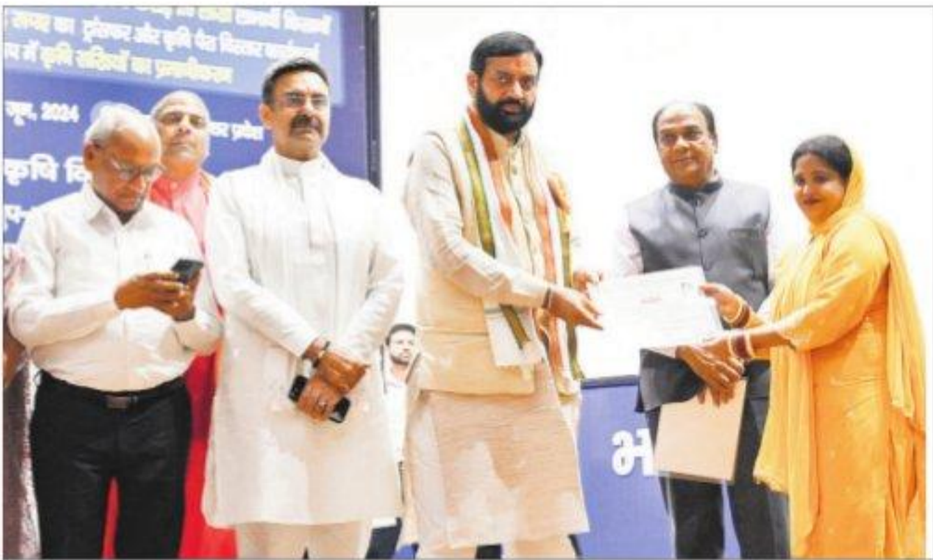
CM Nayab Singh Saini during the state-level programme at ICAR-NDRI in Karnal on Tuesday.

KARNAL, JUNE 18 Chief Minister Nayab Singh Saini today claimed that with the release of the 17th instalment of the PM-Kisan Scheme from Varanasi by PM Modi, 16 lakh farmers of Haryana had received Rs 335 crore under the scheme. “It is Modi’s vision to strengthen marginal farmers by raising their income and reducing financial stress,” said Saini, while addressing farmers at a state-level PM Kisan Sammelan at the ICAR-NDRI auditorium here. The event was organised concurrently with the Varanasi event, where Modi released the instalment today.