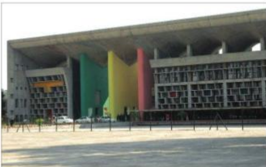
The court rapped the State for its narrow interpretation of “police station” aimed to exclude special investigation units and other premises from the obligation to install CCTV cameras