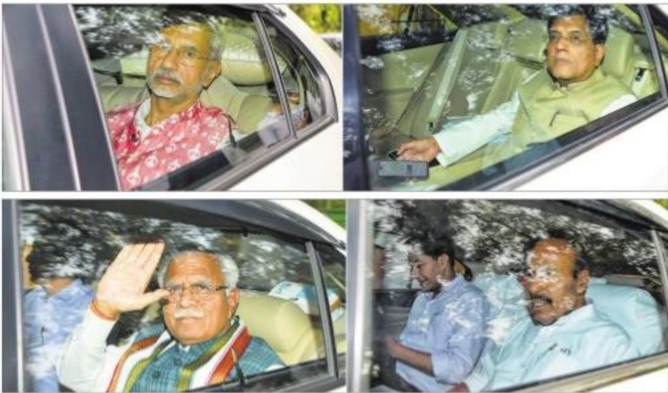
(Clockwise from top) Union Ministers S Jaishankar, Piyush Goyal, Virendra Kumar and Manohar Lal Khattar arrive at the residence of Defence Minister Rajnath Singh in New Delhi on Tuesday.

NEW DELHI, JUNE 18 Defence Minister Rajnath Singh, who is deputy leader of the House in Lok Sabha, on Tuesday chaired a meeting of senior ministers and some allies to deliberate on the strategy for the upcoming Parliament session. Sources said discussions also centred on probable candidates for the election of the Lok Sabha Speaker and Deputy Speaker's post. Union ministers S Jaishankar, Manohar Lal Khattar, Bhupender Yadav, Piyush Goyal, Dharmendra Pradhan, Kiren Rijiju, Annapurna Devi, JD (U)'s