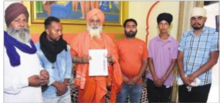
BOOK TRAVEL AGENTS, SAY RS MP