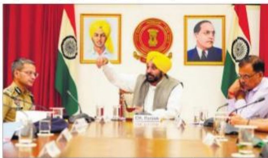
CM Bhagwant Mann holds a meeting with police officers in Chandigarh.

As many as 10,000 "low-ranking" officials have been transferred over the past three days. The policemen found guilty will be dismissed from the service and the drug peddlers' property confiscated within a week. Instructions were given to all SSPs and