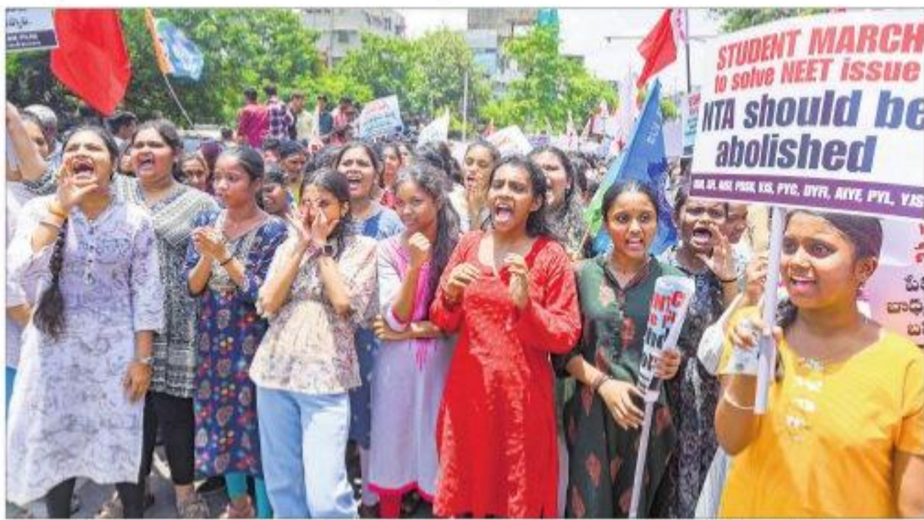
Members of various student unions protest over the NEET irregularities in Hyderabad.

The Bench was hearing two separate petitions raising grievances, including on grace marks given to students in the examination held on May 5. "We all know