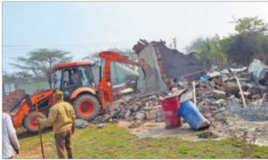
An unauthorised construction that was demolished by the Forest Department in January.

An official said while notices had already been issued, the action was proposed to be taken after a green signal and the availability of a police team. Owners of nearly 100 such constructions had already been