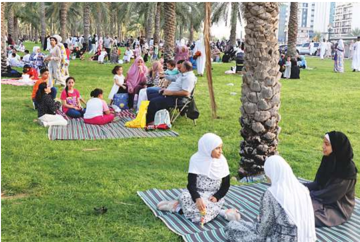
■ Above & left: Families and friends gather at a park in Sharjah. The pleasant weather is an opportunity for residents to spend quality time with loved ones in public parks. ■ Below: Visitors at Dubai's Mall of the Emirates on the first day of the Eid holidays. Malls across the UAE are filled with shoppers and visitors taking advantage of the deals and entertainment options.