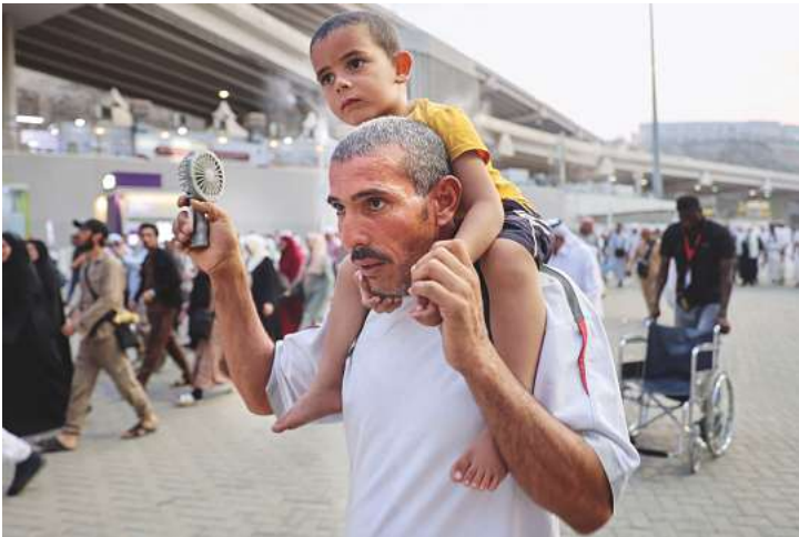
■ The Haj is increasingly affected by climate change. A Saudi study published last month said that regional temperatures were rising 0.4C each decade. Pilgrims in Mina poured bottles of water over their heads yesterday as authorities handed out cold drinks and fast-melting chocolate ice cream.