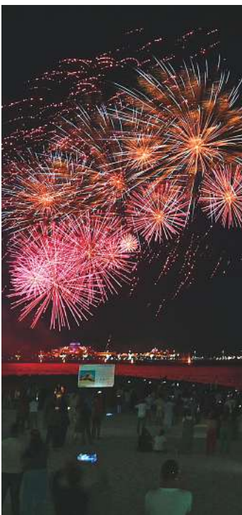
■ Left: Residents enjoy the Eid Al Adha fireworks at Riverland Dubai. Laser shows are happening every night of Eid at 7.30pm, 8.20pm, and 9.30pm. ■ Above: A fireworks display at Abu Dhabi Corniche. A host of shows and performances have been lined up this Eid Al Adha.