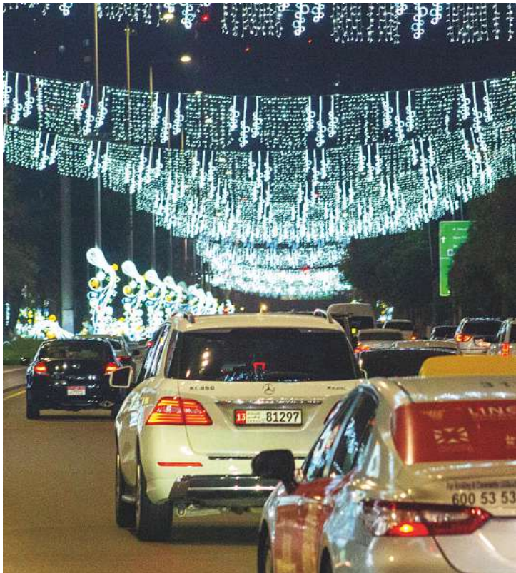
■ Above: A group of Bangladeshi expats dressed in kandouras take a selfie in a Sharjah park. ■ Top: Residents are flocking to Dubai's beaches, turning their vacation into a cool and memorable escape. ■ Right: Abu Dhabi's Corniche Street wears a festive look with special Eid Al Adha lighting and decorations greeting motorists.