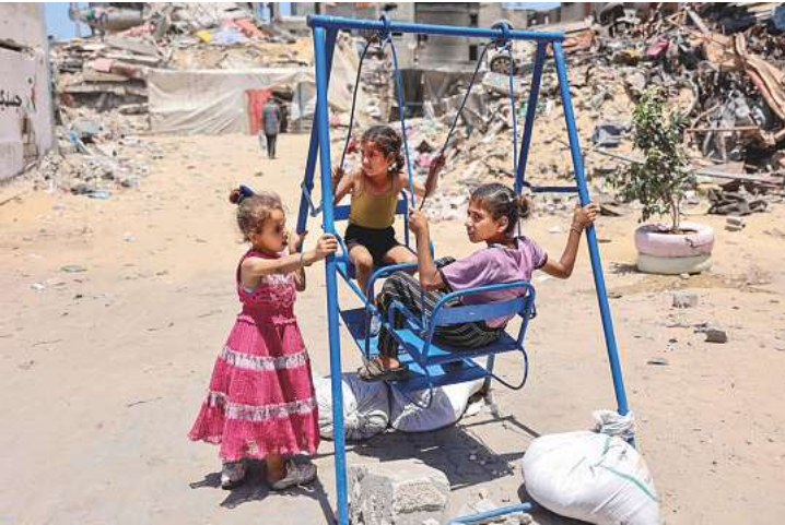
■ Children play in a camp for Palestinian refugees in Gaza Strip yesterday, amid the conflict between Israel and Hamas.

Saudi Arabia recommended organisers to guide and educate pilgrims to adhere to safety guidelines.