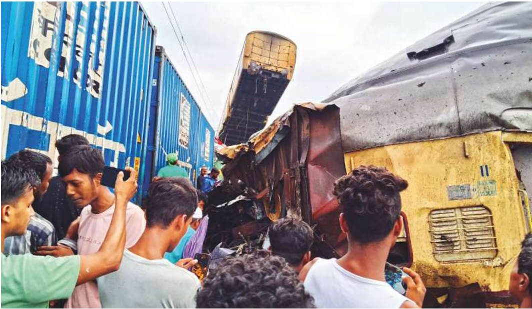
■ People gather at the site where a goods train rammed into the Kanchenjunga Express train, in Darjeeling, West Bengal, yesterday.

Murthy pointed to several studies, including a 2019 American Medical Association study published in JAMA that showed teens who spend three hours a day on social media double their risk of depression. Teens spend nearly five hours a day on social media apps, according to a Gallup poll. Murthy said it’s time for Congress to get serious about curbing children’s use of social media.