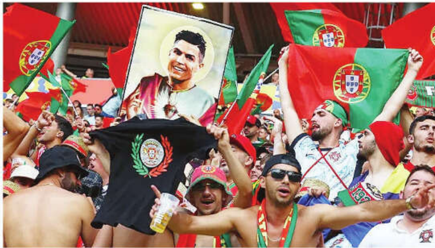
VIVA PORTUGAL: Portugal fans with a picture of Cristiano Ronaldo ahead of their match against the Czech Republic at Leipzig stadium in Germany.

The source added that Chief Minister Pramod Sawant was apprised about this CCTV surveillance system. Following his approval, the departments of Information Technology and Home interacted on this and started the process of setting up this system at all entry/exit points in the State.