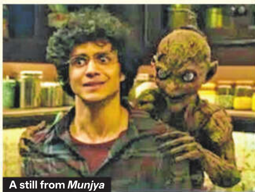
A still from Munjiya

A. We had extensive workshops since I had to imagine