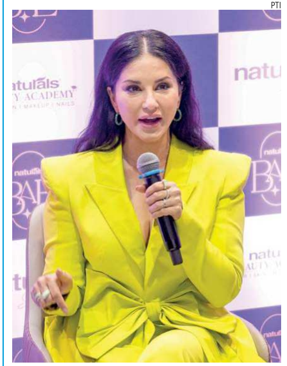
Actor Sunny Leone speaks during the inauguration of the flagship store of Naturals Naturals BAE (Beauty and Experiences), a hair and beauty salon chain in Bengaluru, on Tuesday