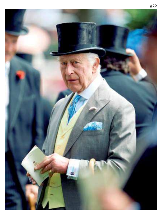
Britain's King Charles III reacts as he arrives to attend the first day of the Royal Ascot horse racing meeting in Ascot, west of London, on Tuesday