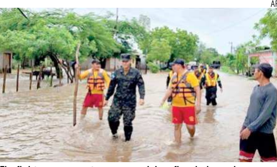
Firefighters carry out rescue work in a flooded area in Nacaome, Valle department, Honduras, in Central America

were killed in flooding and landslides between Friday and Sunday, Amaya added. On Sunday, Congress ap-