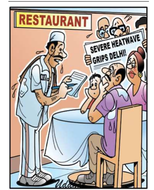
Just order raw eggs, they'll be boiled automatically!