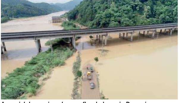
An aerial drone view shows a flooded area in Dongping Township of Zhenghe County, Nanping City in southeastern China's Fujian Province, on Tuesday

CCTV footage showed upturned cars and damaged buildings near Meizhou,