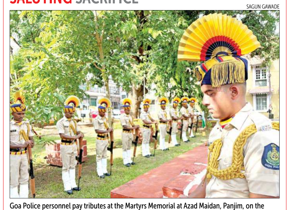
occasion of 78th Goa Revolution Day