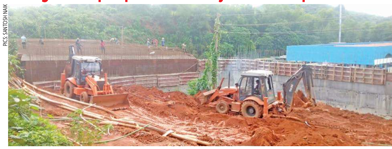
Earth moving machinery undertaking the landfilling work for a ramp to the underpass at the Khandepar-Opa Junction, on Tuesday

The closure of the junction by the NH authorities caused inconvenience to locals and buses travelling from Safa Masjid junction to KTC bus