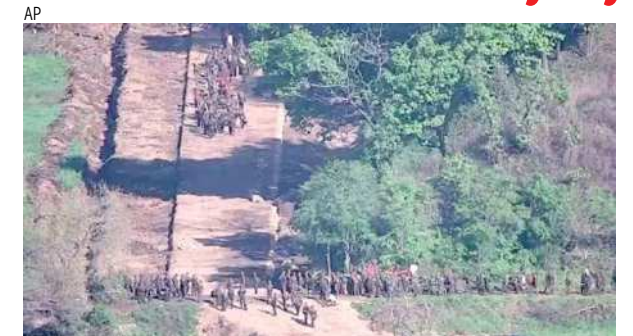
North Korean soldiers work at an undisclosed location near the border area, as seen from a South Korean guard area

Around 20 to 30 North Korean soldiers who were doing construction work crossed the military demarcation line that serves as the border between the two countries in the Demilitarized Zone, according to South Korea's Joint Chiefs of Staff. The soldiers retreated after the South broadcasted warnings and