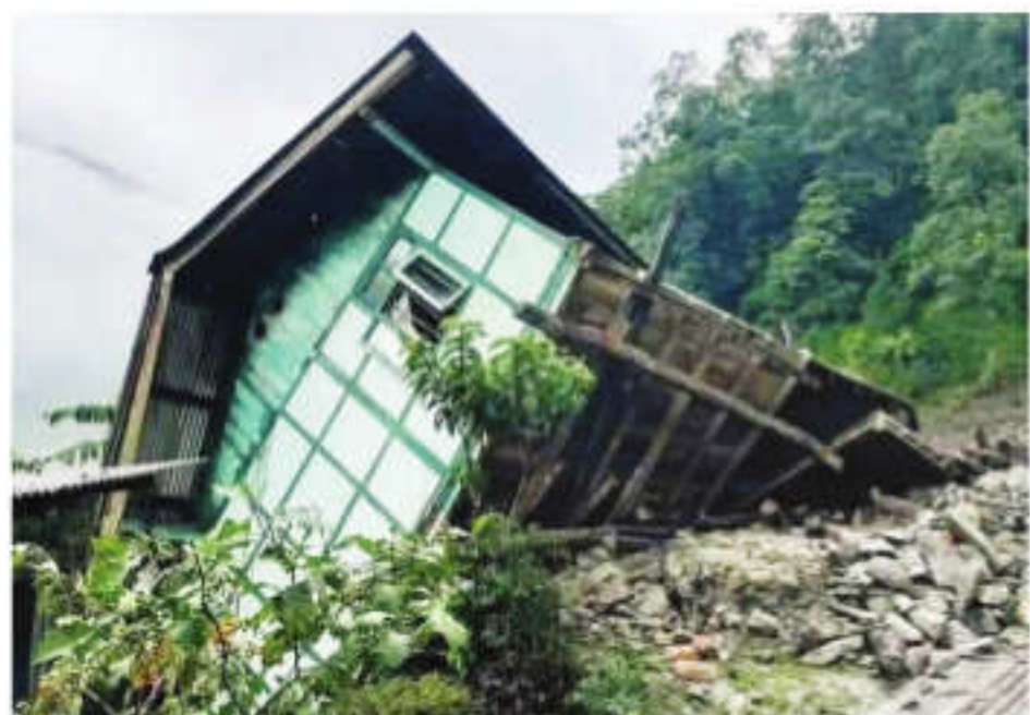
STATESMAN NEWS SERVICE SILIGURI, 13 JUNE

Tour operators said some 800 tourists and over 100 vehicles are currently stuck in the affected regions of north Sikkim