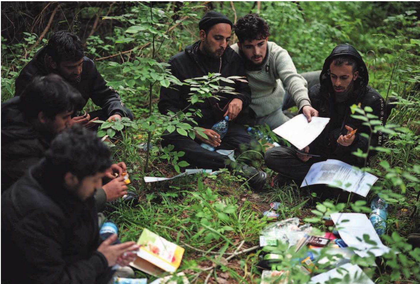
Migrants, mainly from Yemen, receive help from humanitarian activists as they fill out migration documents in the forest near Grudki, Poland, on Tuesday.