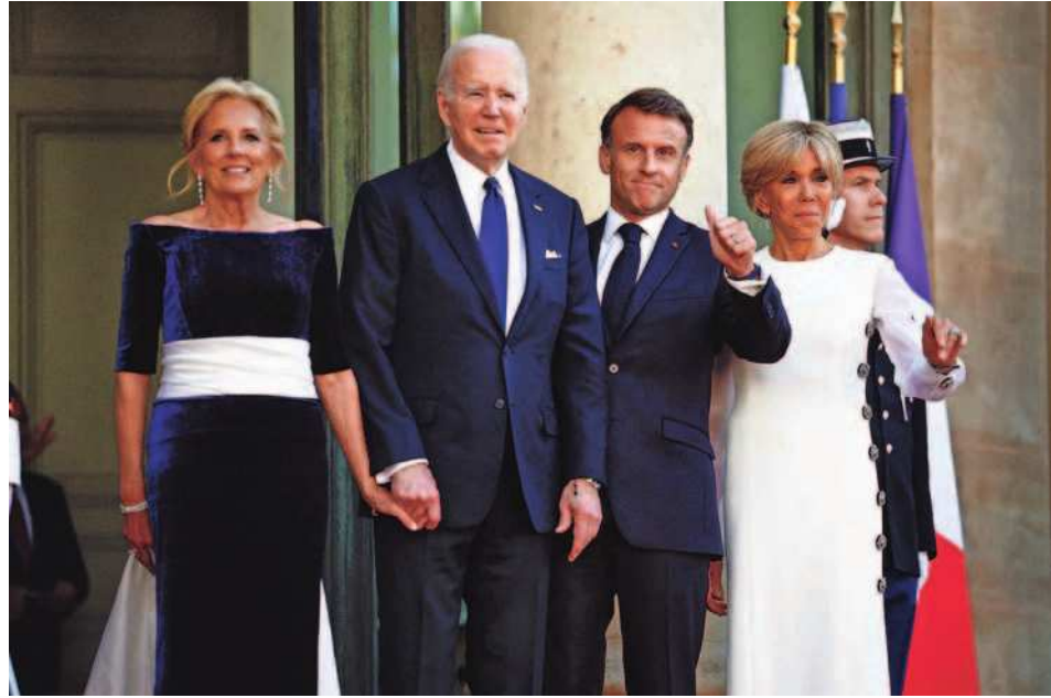
From left, first lady Jill Biden, President Joe Biden, French President Emmanuel Macron and his wife, Brigitte Macron, arrive for a state dinner at the Elysee presidential palace in Paris on Saturday.

Biden said if Putin succeeds in his war with Ukraine, he would not stop