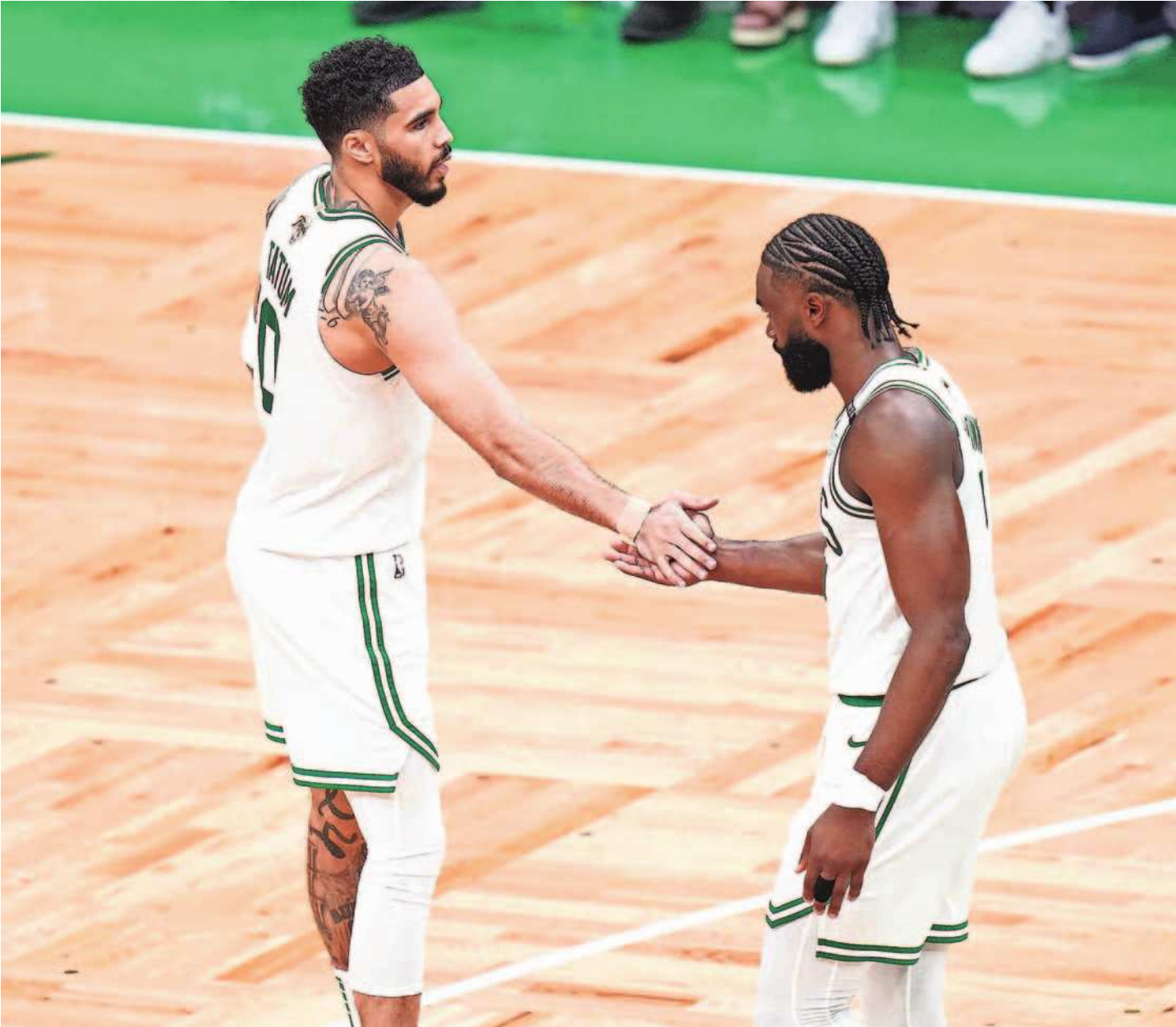
Celtics guard Jaylen Brown, right, and forward Jayson Tatum react in the second quarter of Game 1 of the NBA Finals against the Dallas Mavericks on Thursday in Boston.

in 21 minutes off the bench. Tatum finished with 16 points, 11 rebounds and five assists. Luka Doncic went for 30 points and 10 boards for Dallas, but Kyrie Irving was held to just 12 points on 6-of-19 shooting. Irving missed all five of his 3-point attempts and committed three turnovers while being taunted by Boston fans all night. Irving is now 0-11 in his past 11 games against the Celtics, a losing streak that he is confident he can shed on Sunday. “Just got to calm our nerves, poise our nerves a little bit and also just be aware of the environment that we’re in,” Irving said. “It’s going to be high intense from who we’re going against. It’s going to be very physical. Some things are going to be called, some things aren’t. “So I think we got all that experience in Game 1, and we’re looking forward to the challenge in Game 2 to playing better, and being who we have been since post-All-Star break. ... We’re the only two teams playing, so we’re proud of ourselves, but we’re not satisfied.” Most of the Mavericks’ struggles stemmed from a lack of ball movement, as Dallas finished with only nine assists – the fewest by any team in a game this season. Kidd is hoping for a more fluid performance in Game 2. “I thought we were too much one-on-one. We’ve got to move bodies. We’ve got to move the ball. Multiple guys got to touch the ball,” Kidd said. “We were just too stagnant, and that’s not the way we play. So, we’ve got to be better (Sunday).”