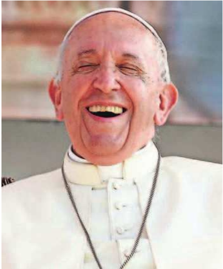
The Vatican said Pope Francis “recognizes the significant impact that the art of comedy has on the world of contemporary culture.”

“He said he would see what his time was like,” Goldberg said joking, when asked if the pope had accepted her offer.