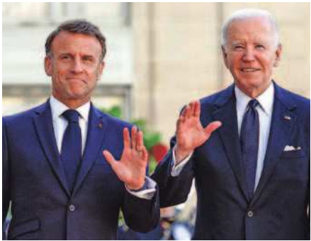
French President Emmanuel Macron and President Joe Biden wave ahead of a state dinner in Paris on Saturday.