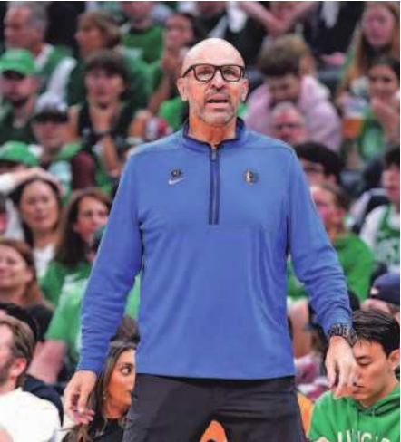
Dallas Mavericks coach Jason Kidd looks on during Game 1 of the NBA Finals against the Celtics on Thursday in Boston.