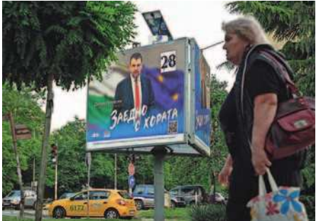
A woman walks past an election poster in Kardzhali, Bulgaria, on Friday. Bulgarians are heading to the polls on Sunday.

Bulgarians will also be choosing their representatives for the European Parliament, but election fatigue could be an issue. In the Gallup poll, only 40% of respondents said they planned to vote.