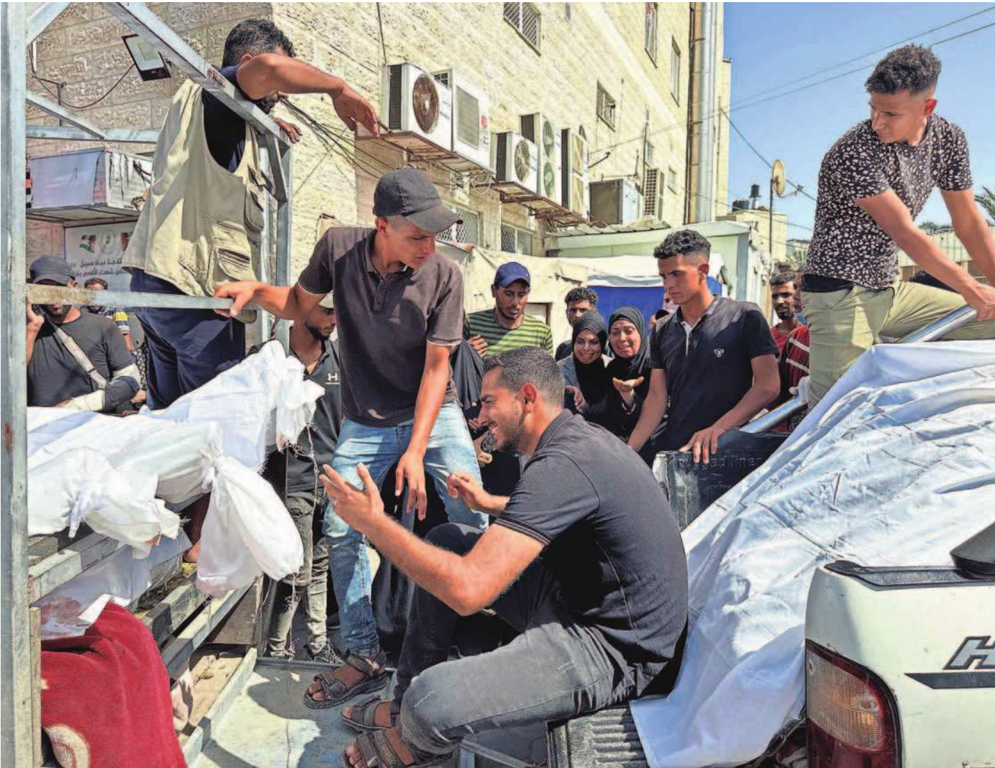
Mourners react during a funeral for Palestinians killed in Israeli strikes in Deir al-Balah, Gaza Strip, on Saturday.

A different picture unfolded back in Gaza, where Palestinian health ministry officials and local medics said an Israeli military assault in Nuseirat had killed