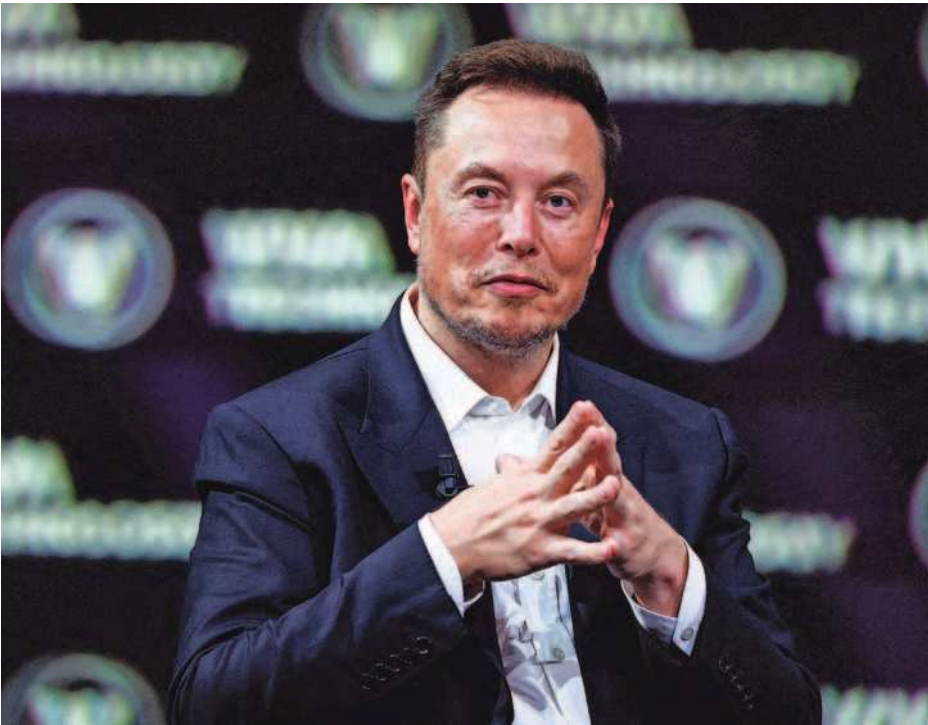
Tesla shareholders will vote on CEO Elon Musk’s pay at their annual meeting scheduled for Thursday.

shareholder proposal calling on Tesla to adopt a freedom of association and collective bargaining policy, a win for labor unions seeking to assert their influence over the U.S. carmaker.