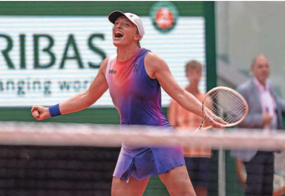
Iga Swiatek celebrates winning the French Open women’s singles final against Jasmine Paolini on Saturday in Paris.

earned a World Series ring as a member of the 2008 Philadelphia Phillies, ranks this accomplishment right alongside his personal on-field achievement. “I would put it right up there with winning on the biggest stage. Horse racing is the most underrated sport in the world bar none,” Werth said. “You’ve got the Derby, the Preakness and the Belmont – and we just won the Belmont. This is as good as it gets in horse racing and as good as it gets in sports.”