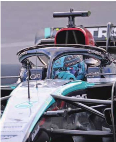
Mercedes driver George Russell races during qualifying for the Canadian Grand Prix on Saturday in Montreal.

Red Bull and Verstappen will not be waving the white flag, however, and the Dutchman showed that his team are