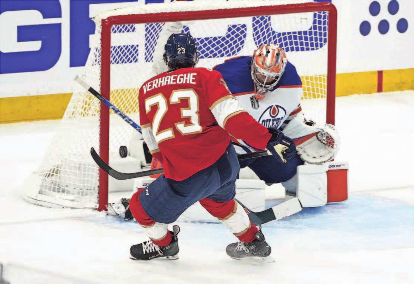
Florida Panthers forward Carter Verhaeghe scores against Edmonton Oilers goaltender Skinner Stuart during the first period of Game 1 of the Stanley Cup Final on Saturday in Sunrise, Fla.

Florida’s other shutout during this year’s playoffs came in the opener of the Eastern Conference finals against the