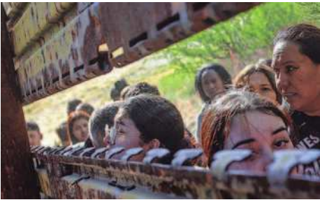
Migrants look toward the U.S. through a gap in the border wall before crossing into Boulevard, Calif., last month.

U.S. Border Patrol arrested around 3,100 people crossing illegally, down roughly 20% from the days before, the official said, requesting anonymity to discuss preliminary figures.