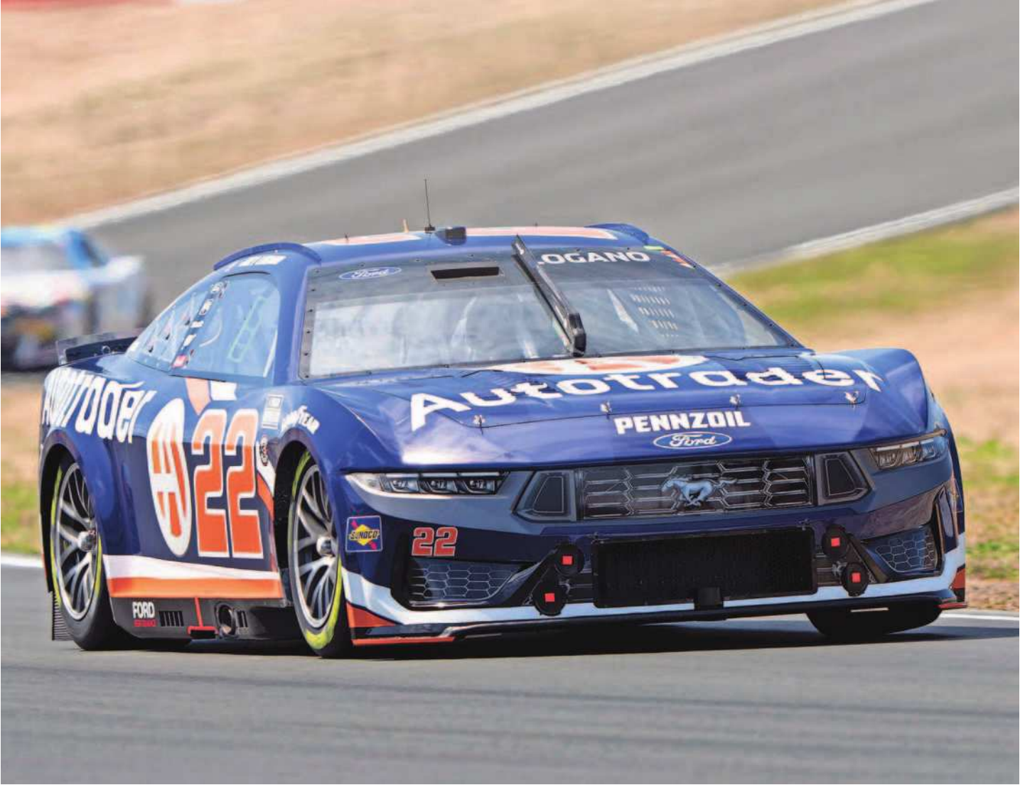
NASCAR Cup Series driver Joey Logano races around Sonoma (Calif.) Raceway on Saturday during qualifying for Sunday's Toyota Save Mart 350.