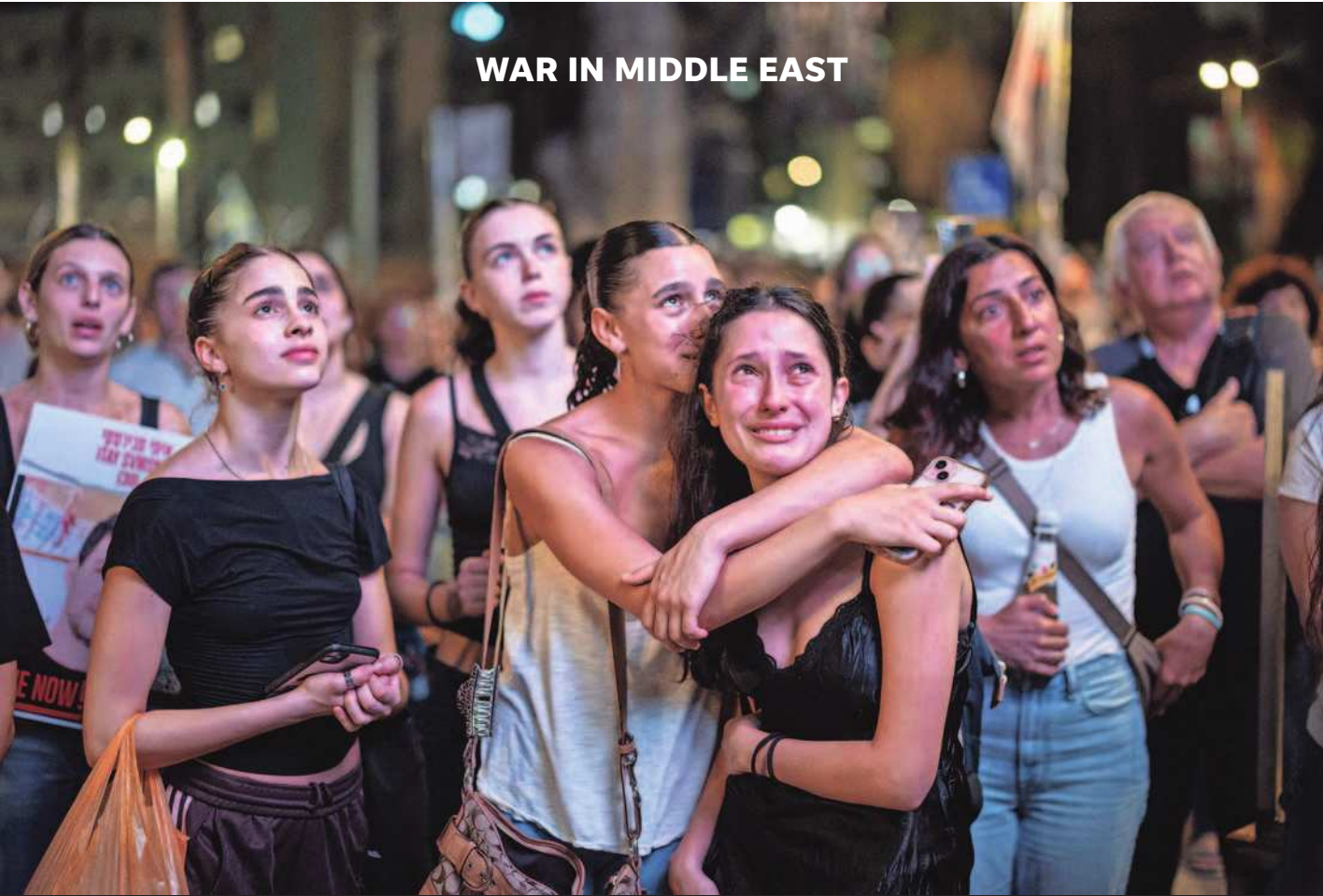
WAR IN MIDDLE EAST

INSIDE South Korea's young shamans helping revive ancient tradition. 4NN