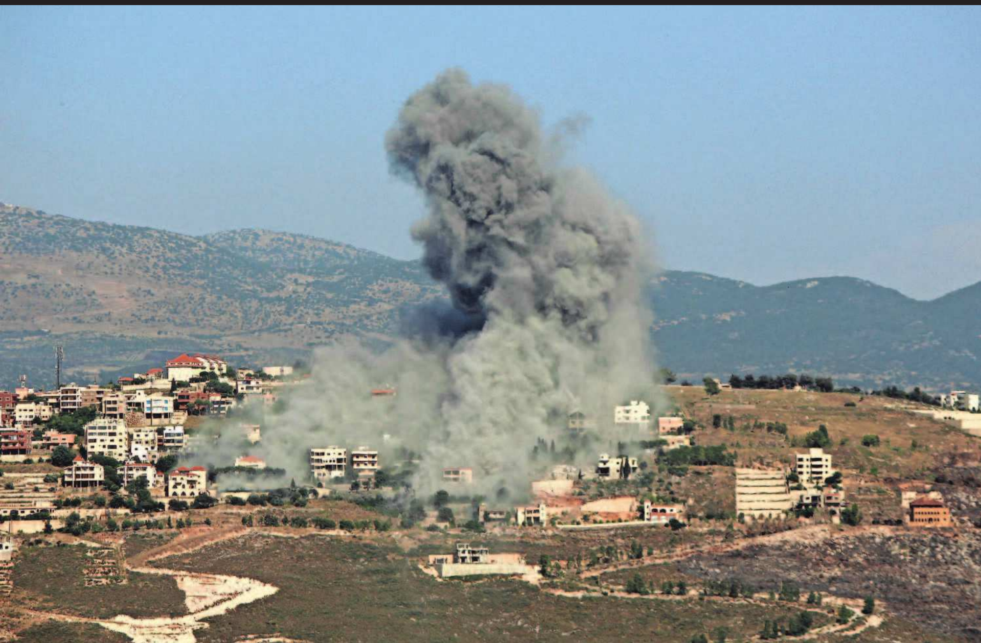
Smoke billows from the site of an Israeli airstrike in the southern Lebanese village of Kham on Saturday.