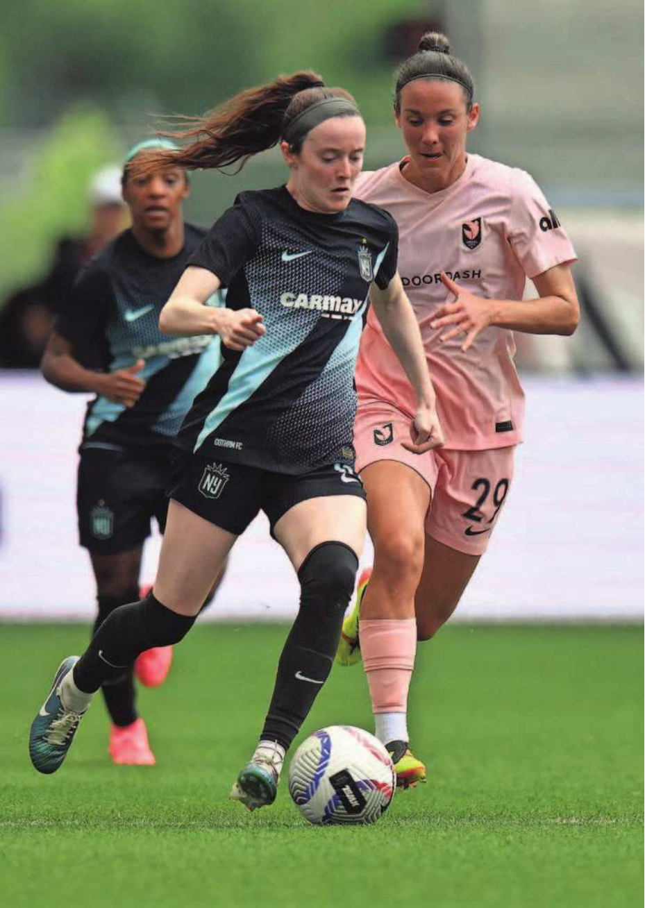
NJ/NY Gotham FC midfielder Rose Lavelle, front, dribbles the ball against Angel City FC midfielder Clarisse Le Bihan on Saturday.