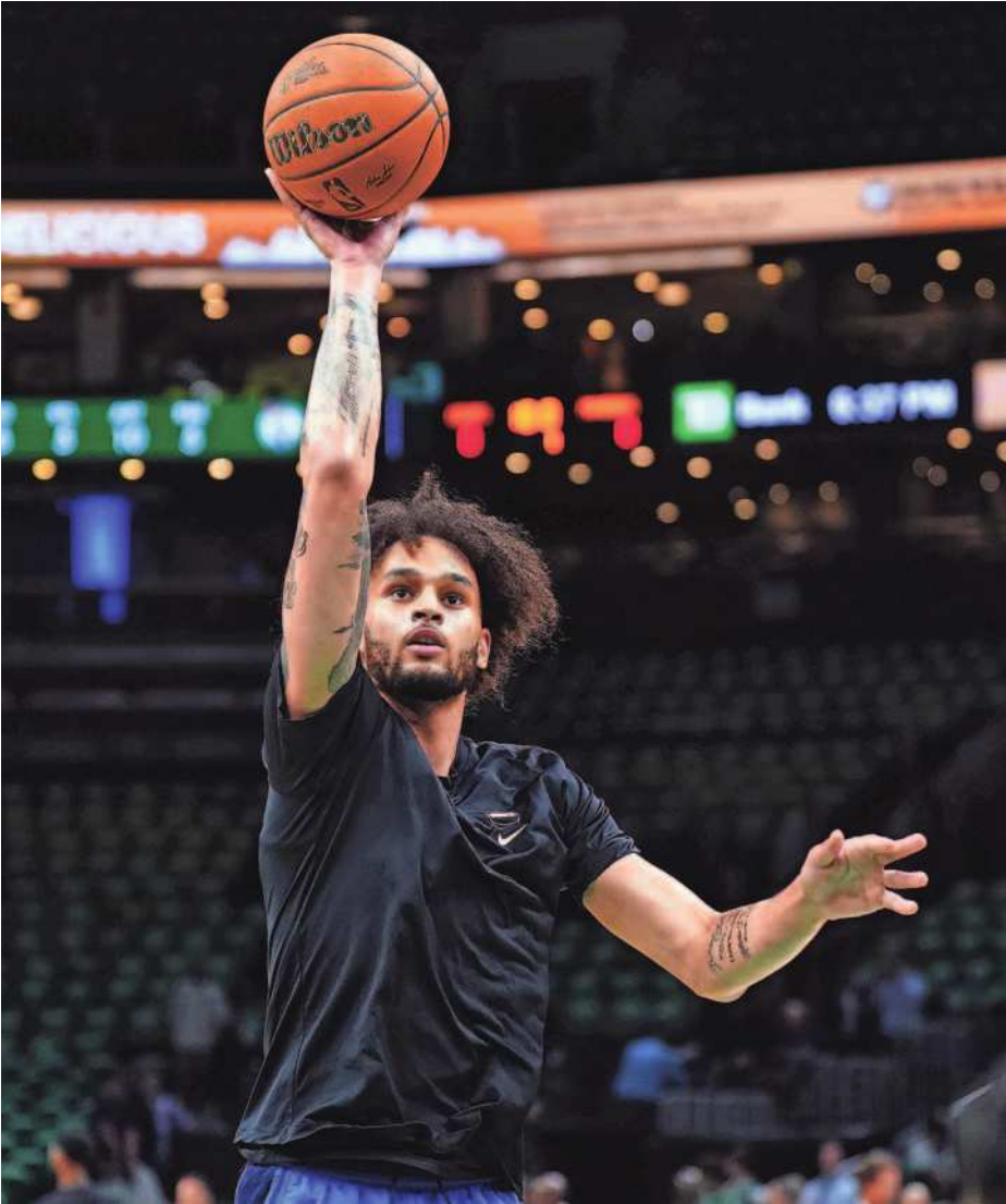
Mavericks center Dereck Lively II warms up before Game 1 of the NBA Finals against the Celtics on Friday in Boston.

So, the Mavs lost a game to Chicago on April 7, 2023 – a game in which Luka Doncic played just under 13 minutes, and Kyrie Irving, Maxi Kleber, Christian Wood, Tim Hardaway Jr., and Josh Green did not play. And they missed the postseason. The league was irate and fined the Mavericks $750,000 for “conduct detrimental to the league in an elimination game,” the NBA said in a news release. NBA executive vice president/head of basketball operations Joe Dumars said the Mavs’ decision “undermined the integrity of our sport,” and their actions “failed our fans and our league.” However ... the Mavericks made a minor draft-day trade, swapping their No. 10 pick for Oklahoma City’s No. 12 pick, and selected Duke center Lively. Lively immediately became a significant part of Dallas’ rotation – an active two-way big man who excels in the pick-and-roll, setting screens, catching lobbs for dunks and protecting the rim. He averaged 8.8 points, 6.9 rebounds, 1.4 blocks and 1.1 assists and shot 74.7% from the field in 23.5 minutes per game as the Mavs went 50-32. With Lively on