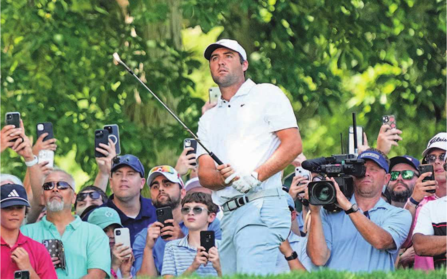
Scottie Scheffler hits out of the gallery on the ninth hole during the third round of the Memorial Tournament on Saturday at Muirfield Village Golf Club in Dublin, Ohio.

blesome hole began with a tee shot into the trees that ricocheted out of bounds. “A really tough break there, but did a good job resetting and bouncing back,” Scheffler said. “Had the nice birdie on 10 and 12 and did a good job kind of staying in the round.” His three-shot lead vanished, but it didn’t take long to move back ahead. Scheffler got on track with a birdie on No. 10. That began a stretch of three birdies in six holes. “I love coming out here and competing against the best players in the world on the best golf courses, and this is obvi- ously a pretty challenging track,” Scheffler said. While any trouble for Scheffler generally seems unusual, he also had a triple-bogey in his most-recent tournament two weeks ago in the first round of the Charles Schwab Challenge. He had been at 11 under for the tournament after Saturday’s sixth hole, where his approach shot from a fairway bunker set up a birdie putt. Morikawa had a bogey-less round. Three of his four birdies came in a stretch from No. 12-15. “I’ve got to go out and put out a round like I did (Saturday),” Morikawa said.