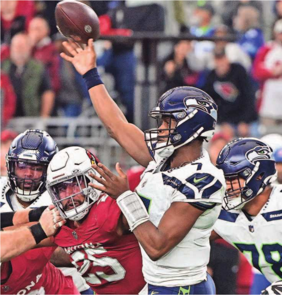
Seattle Seahawks quarterback Geno Smith (7) throws during a Jan. 7 game against the Arizona Cardinals in Glendale, Ariz.