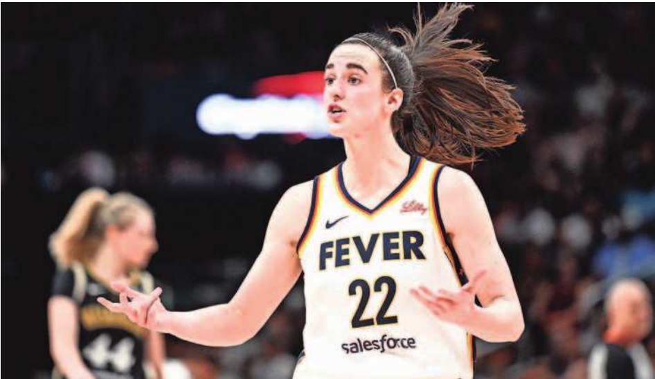
Caitlin Clark reacts to a call in the fourth quarter against the Washington Mystics.

But following Clark would have meant following much more than Clark. She would have introduced all those Olympic viewers and readers — many of whom are not big sports fans and have never watched a women’s Olympic basketball game — to the entire U.S. team. You’ve never watched Breanna Stewart