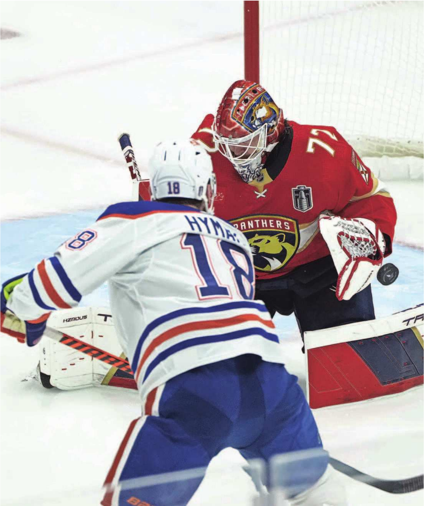
Edmonton Oilers forward Zach Hyman (18) shoots the puck against Florida Panthers goaltender Sergei Bobrovsky during the first period of Game 1 of the Stanley Cup Final on Saturday in Sunrise, Fla.