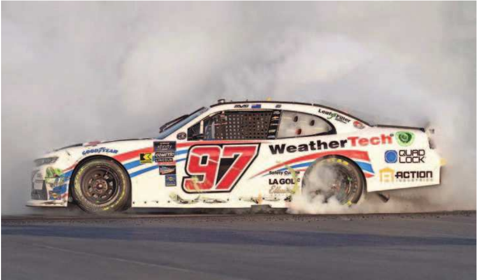
Shane van Gisbergen performs a burnout after winning the NASCAR Xfinity Sonoma 250 at Sonoma (Calif.) Raceway on Saturday.