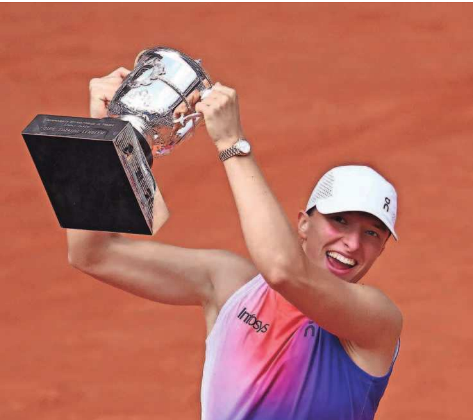
Iga Swiatek celebrates with her trophy after defeating Jasmine Paolini in the French Open women's singles final on Saturday in Paris.