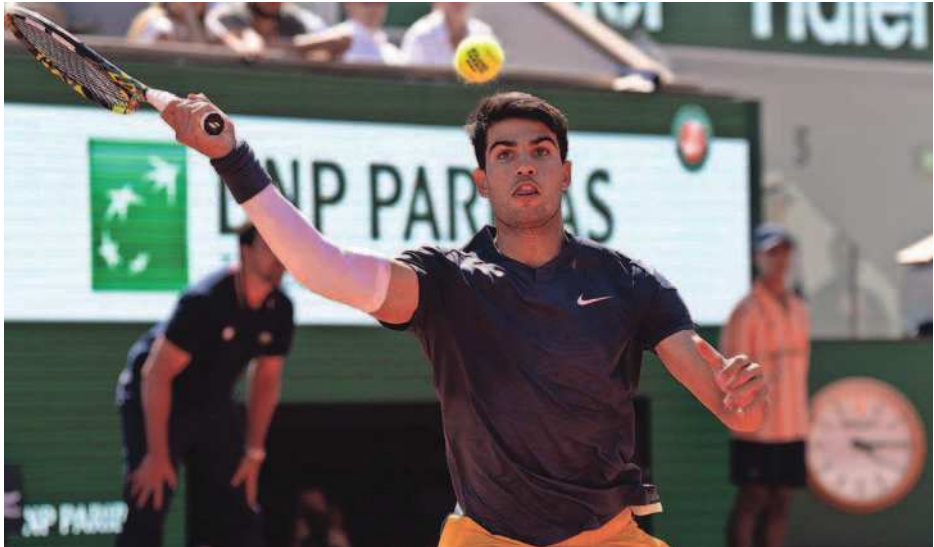
Spain’s Carlos Alcaraz hits a return against Italy’s Jannik Sinner in their men’s semifinal on Friday at the French Open in Paris.

running to my home just to put the TV on and watch the matches here in the French Open,” the 21-year-old said. “I watched a lot of matches. Of course Rafa Nadal. I wanted to put my name on that list of the Spanish players who won this tournament. “Not only Rafa. (Juan Carlos) Ferrero, (Carlos) Moya, (Albert) Costa, a lot of Spanish players, legends from our sport who won this tournament, I really want to put my name on that list, as well.” Fourth seed Zverev, meanwhile, will be looking to settle a score with the tournament itself, having been eliminated in the semi-finals here in the three previous editions while still chasing his maiden Grand Slam title. He has reached the final at a major once previously, at the 2020 U.S. Open. “Going from the U.S. Open final where I was two points away (from victory) to being rolled off in a wheelchair here two years ago”, after suffering an ankle injury against Nadal, “it’s all part of my journey” said the 27-year-old, who won the Rome Masters ahead of the French Open.