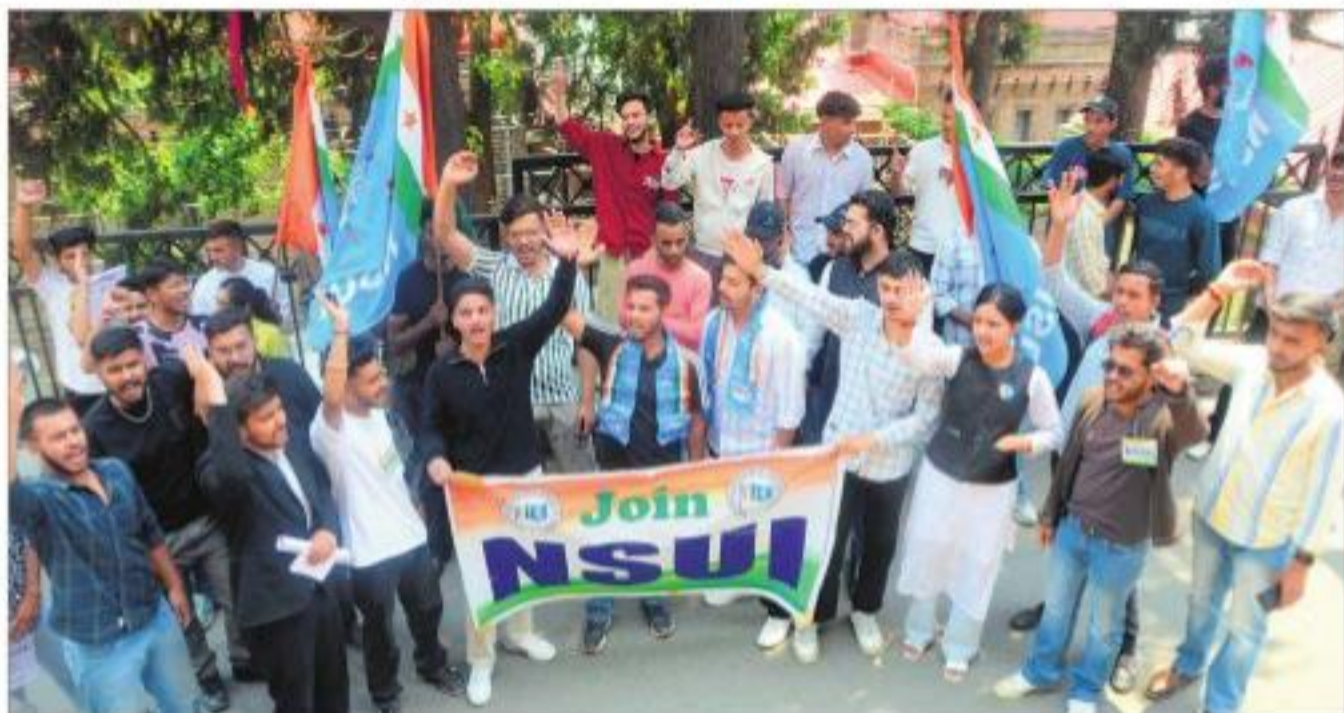
NSUI activists protest the alleged irregularities in the NEET-UG exam, at HPU.

However, no mention of this grace marking scheme was made in the guidelines published by the NTA before the