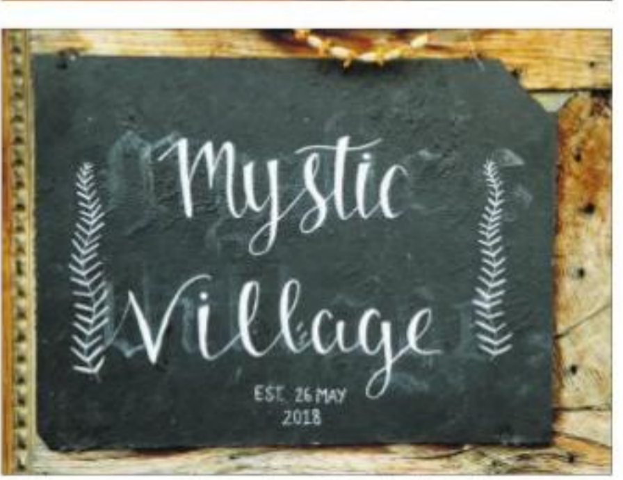
This homestay model not only enriches the visitors' experience but also strengthens the community.