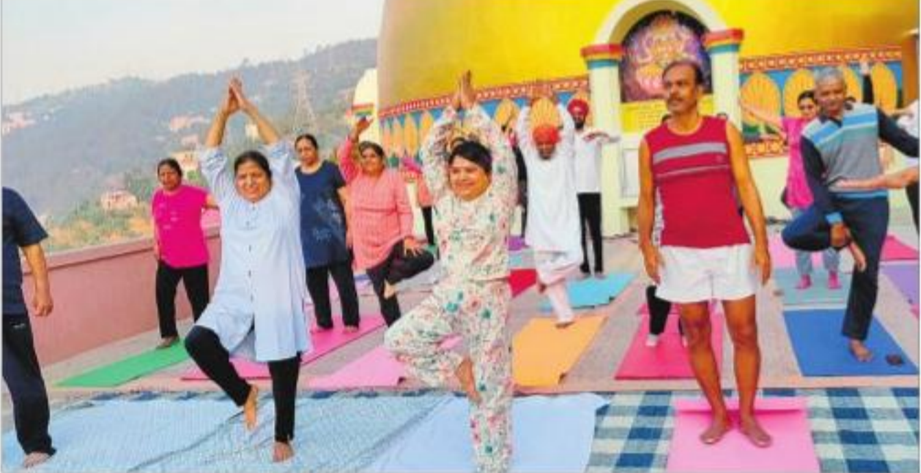
Participants perform asanas during a camp at Yog Manav Vikas Trust.