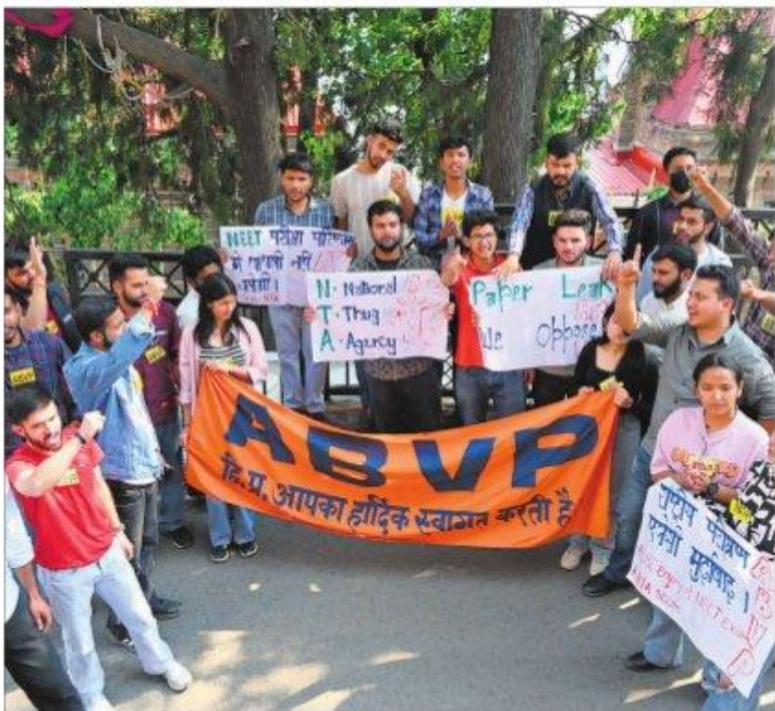
ABVP and (right) SFI activists stage protests against the alleged NEET-UG fraud outside the office of the Deputy Commissioner in Shimla on Wednesday.