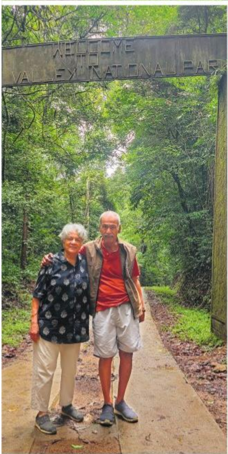
The writer poses with her husband in Silent Valley, five hours away from Coonoor.

IF Charles Lamb were to live in modern times, he would amend his famous quote to say, “The automobile has entered my soul.” It clogs up our cities, sprays carbon into our lungs, turns our environs into a dreadful cacophony of blaring horns, screeching tyres and roaring engines. Yet, few modern inventions have shrunk the planet as the motor car has. Its seductive allure is difficult to resist, especially with Google Maps showing the way.