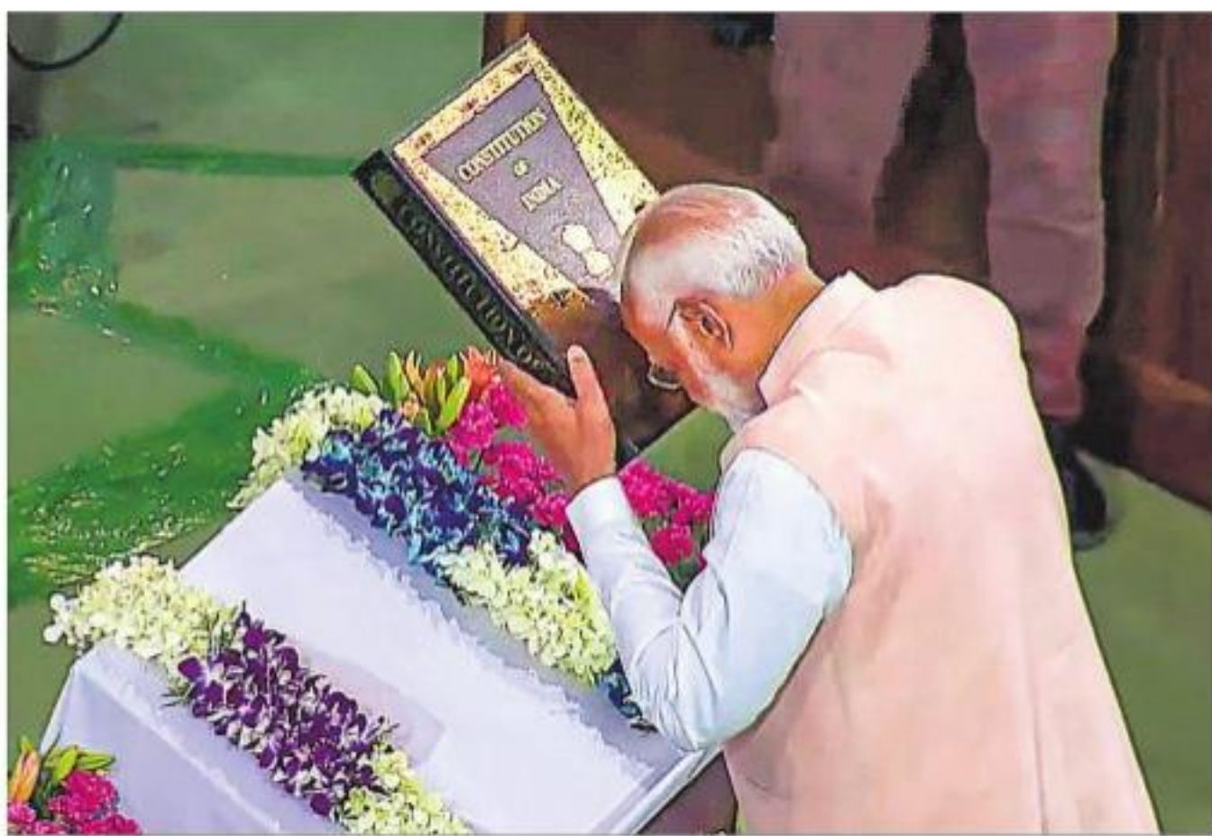
Narendra Modi swears by the Constitution at the NDA parliamentary party meeting in New Delhi.

"The responsibility the NDA leaders have given me today by electing me their leader shows that the NDA's 30-year-old ties of trust are strong. This is an unbreakable bond and my greatest asset... this is an emotional moment for me... Ours is an organic alliance driven by commitment to nation first not by power lust," Modi said in his acceptance speech at the Central Hall of Parliament after the NDA allies elected him the leader of the parliamentary party in a firm show of unity.