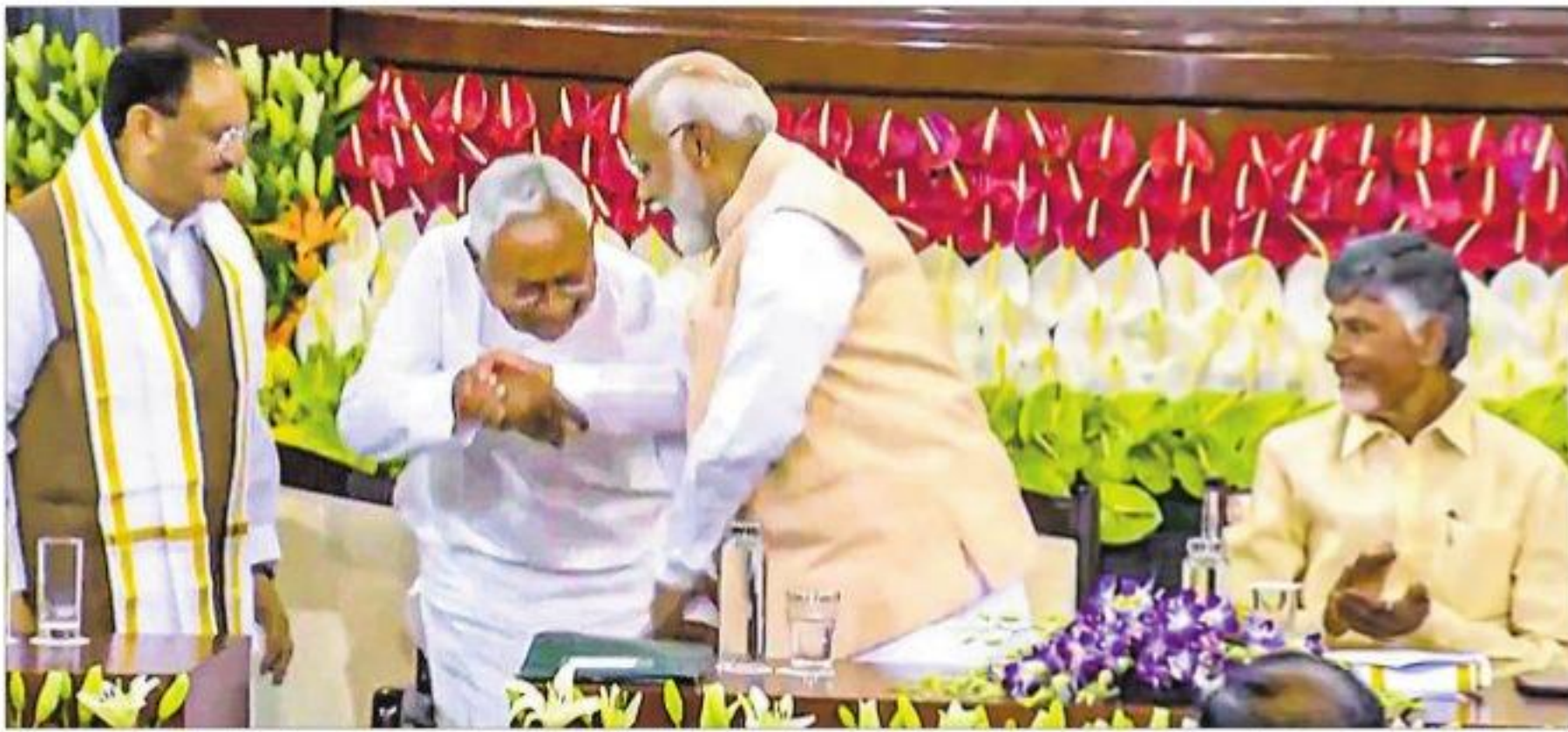
Narendra Modi with Bihar CM and JD(U) leader Nitish Kumar during the NDA parliamentary party meet in New Delhi on Friday.

The bloc's two kingmakers clapped till Modi took his seat on the dais flanked by Naidu on one side and BJP chief JP Nadda on the other. Nine NDA leaders—Naidu, Nitish Kumar, JD(S)' HD Kumaraswamy, Jana Sena's