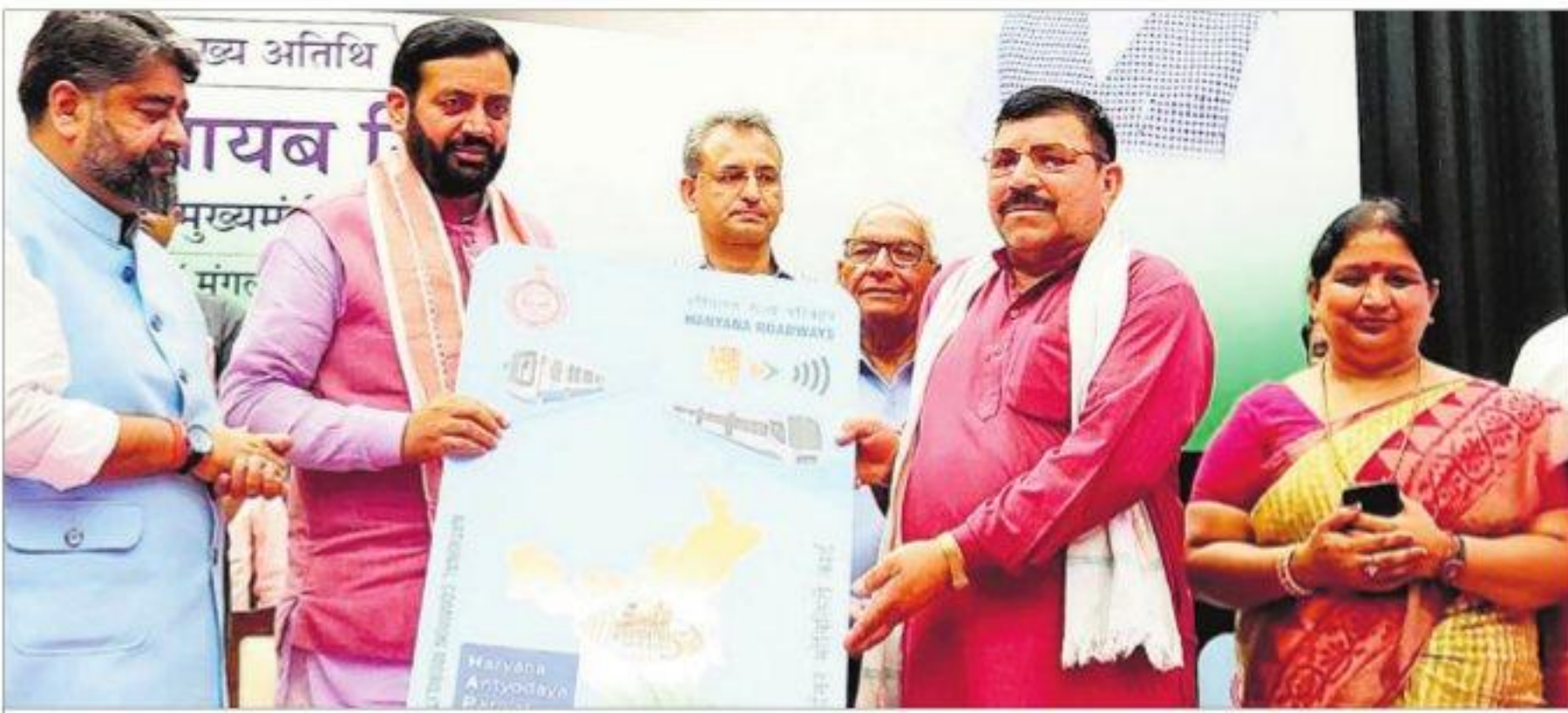
Chief Minister Nayab Singh Saini hands over a HAPPY Card to a beneficiary in Karnal.

Similar events were held simultaneously across the state where state ministers, MLAs, government officials, beneficiaries and senior officials of AU Small Finance Bank participated. An NCMC card enables seamless travel in public transport, making commuting more affordable and convenient for the beneficiaries. Additionally, the card can also be used for various digital payments, thus promoting financial inclusion among the Antyodaya families. “The NCMC cards have been given to the members of the families with annual income of less than Rs 1 lakh to provide the benefits of free travel up to 1,000 km in government buses. A total of 24 lakh fami-