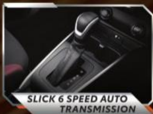
SLICK 6 SPEED AUTO TRANSMISSION