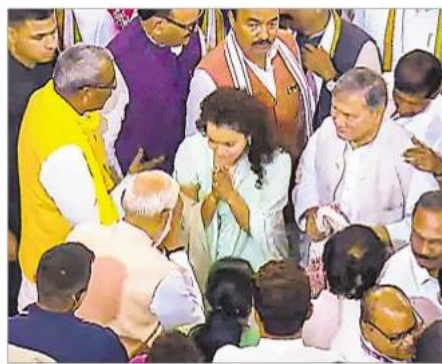
SHOW-STOPPER: Narendra Modi is greeted by Kangana Ranaut at the NDA parliamentary party meeting in New Delhi on Friday.

The SKM (Non-Political) and the Kisan Mazdoor Sangharsh