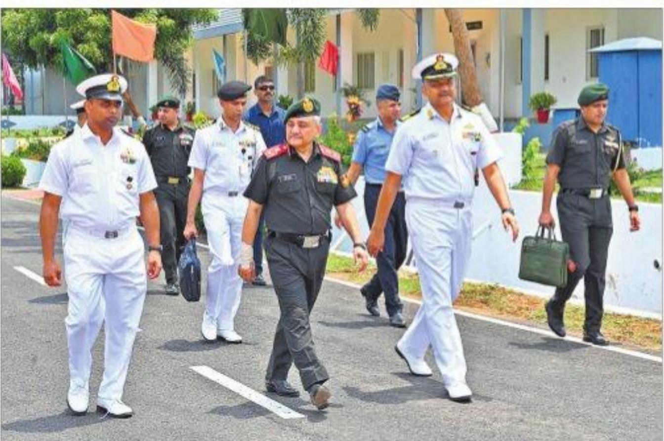
IMPERATIVE: CDS Gen Anil Chauhan (centre) during his visit to INS Chilka in Odisha last week. The Navy's requirements need to be met through adequate funds.

The Indo-Pacific region, increasingly becoming an area of strategic contestation between the US and China, also impacts India as it is one of the major players in this realm. India has land borders exceeding 15,000 sq km, which it shares with seven nations. India also has a 7,683-km coastline and an exclusive economic zone of over 2 million sq km. Internal security challenges do emerge once in a while in J&K and some of our restive northeastern states, while a fading Naxal/Maoist insurgency still persists. China's continuing belligerence towards India and its unending 'salami-slicing' tactics in the border regions are of major security concern for us. Thus, overall, India has to ensure its territorial and economic sovereignty. Since Independence, India has witnessed major conflicts in 1947-48, 1962, 1965, 1971 and the Kargil War in 1999, apart from battling many internal security upheavals, including insurgency in the North-East and, countering terrorism emanating from Pakistan. Despite all these kinetic conflagrations, India has not yet promulgated a National Security Doctrine (NSD). Since the past many years, national security has moved far beyond military activities, prosecution of war or managing internal security problems. Today, national