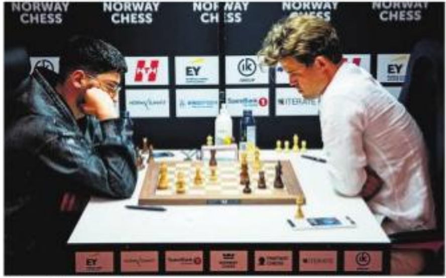
Alireza Firouzja missed a good opportunity to win against Magnus Carlsen in Armageddon.

Praggnanandhaa, despite the loss against Caruana in Armageddon, is still third on 13 points, a point ahead of