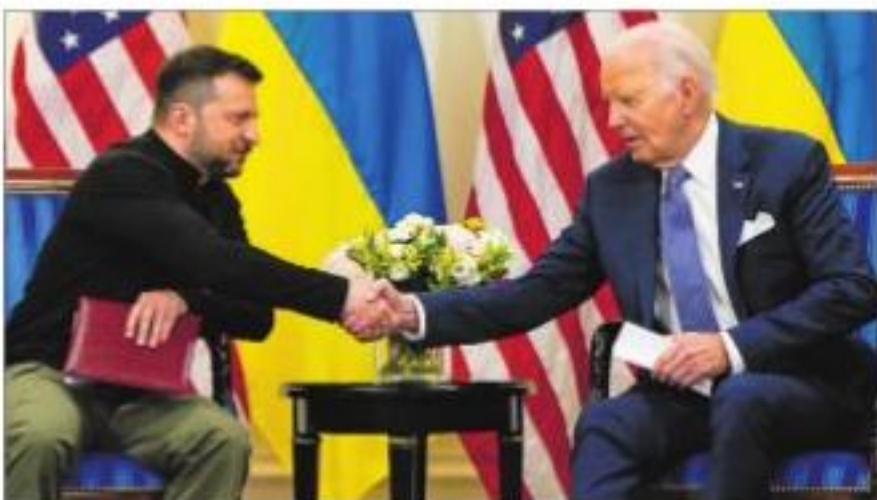
US President Joe Biden shakes hands with Ukrainian President Volodymyr Zelenskyy in Paris on Friday.

PARIS, JUNE 7 US President Joe Biden on Friday for the first time publicly apologised to Ukraine for a monthslong congressional holdup in American military assistance that let Russia make gains on the battlefield. Biden met in Paris with Ukrainian President Volodymyr Zelenskyy, who appealed for bipartisan US support going forward "like it was during World War II." "I apologise for those weeks of not knowing what's going to happen in terms of funding," Biden said, referring to the six-month holdup by conservative Republicans in Congress to a $61 billion military aid package for Ukraine. Still, the Democratic president insisted that the American