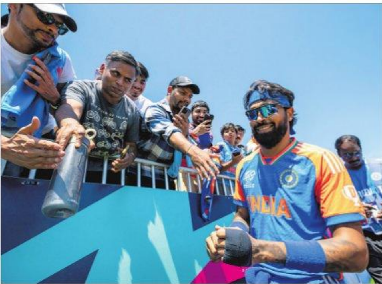
Hardik Pandya has enjoyed considerable success against Pakistan in the past.

"India-Pakistan has always been very exciting, lot of