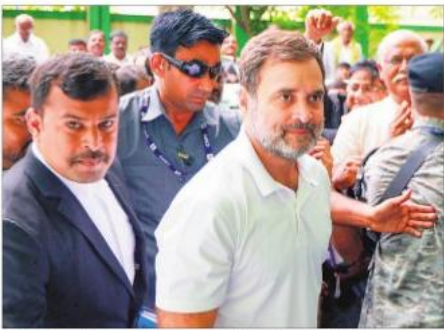
Rahul Gandhi leaves the court in Bengaluru on Friday.

including former CM Basavaraj Bommai, had taken commission to the tune of 75 per cent in Covid kit tender deals, 40 per cent for PWD tenders and 30 per cent for grants to religious organisations. Meanwhile, Rahul also held a review meeting with the winning Congress MPs and the party's Lok Sabha candidates. He sought a report on the performance of the party in the state. Shivakumar said, “He (Gandhi) has tasked three leaders—Siddaramaiah, AICC general secretary Randeep Singh Surjewala and me—to submit the report.” “He has asked the MPs to be with people and go to Delhi only when the Parliament is in the session. We expected five to six more seats,” Shivakumar added. The bypoll will be held for Channarayana, Sandur and Shiggaon constituencies as sitting MLAs from the segments—HD Kumaraswamy (JD(S), ETukaram (Congress) and Basavaraj Bommai (Shiggaon)—were elected as MPs.