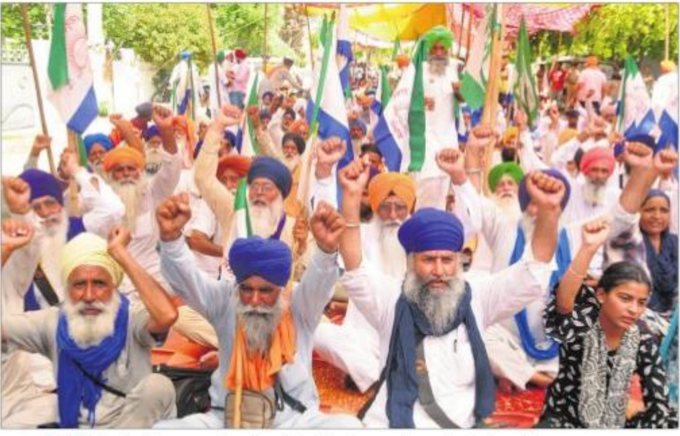
SWAY: The election was yet another test of the farmers' power in state politics.

ue, what would be the implications for the Sikh-majority state? At a time when there has been a large-scale ideological shift to right-wing conservatism, visible in the surge of cultural nationalism in north, central and western India, would Punjab remain immune to it, despite having a sizeable Hindu population? Was there an unmistakable sign of the revival of radicalism in the Sikh community, already indicated by the unexpected win of Simranjit Singh Mann in the 2022 Sangrur bypoll and the Amritpal Singh episode? The election was also seen as a mid-term assessment of the performance of the AAP government, which has a brute majority of 92 in the 117-member House. The poll was yet another test of the farmers' power in state politics. The question was whether the agrarian distress was going to be an issue that would have a significant electoral impact, especially for the BJP and the Akali Dal. Going by the verdict, it is obvious that Punjab's 'exceptionalism' continues in many ways. For one, local issues and candidates continued to determine the electoral choices in the state, even though it was a General Election. The Modi factor did not work in Punjab. BJP candidates and