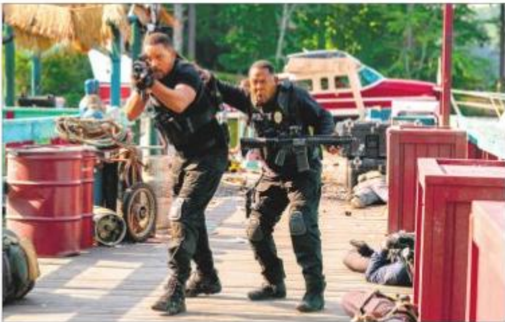
Ageing cops Martin Lawrence and Will Smith (L) provide a laugh riot and action.

This is the fourth movie in the series and there's no let-up here. The ageing buddy-cop duo get into the act and it's a joyride all the way. They still talk motor-mouthed meaningless stuff, the f-words and nether region jokes keep coming, and the action is unique. The writing may be fluff stuff, yet it manages to maintain a balance with the convoluted drama, the incessant bickering and the spaced-out gags. The plot isn't particularly enticing and the narrative gets quite choppy leading up to the big reveal. But once that happens, the wheels begin to spin fast and furious. This film is typical of a big, fat Michael Bay production. Full of energy, some side-splitting laughter and interesting action, 'Bad Boys' has a fair run of excitement! Martin Lawrence as Marcus Burnett has much more to do than in the previous edition — he is quite good in the shootout scene in the food store. Of course, Martin has a lot more to do with food even after he suffers a heart attack and comes back from almost-dead. Will Smith as Mike Lowrey gets married, gets to reunite with his estranged, incarcerated son and