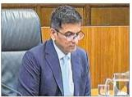
CJI DY Chandrachud.