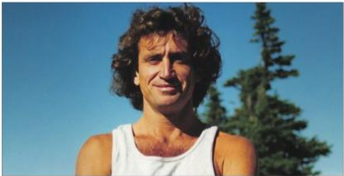
The crime story of a unique robber is told without excessive exaggeration.