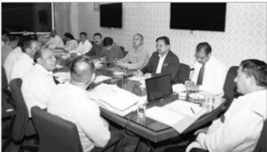
Horticulture Minister Jagat Singh Negi presides over a meeting regarding apple season preparedness with stakeholders in Shimla.

SHIMLA, JUNE 7 With apple harvesting season round the corner, Horticulture Minister Jagat Singh Negi today said freight charges for transportation of apple will be fixed on kilogram and kilometre basis. As of now, the freight is charged on per box basis. The fruit growers have been demanding fixing of the freight on kilogram and per kilometre basis, especially after the introduction of universal cartons from this year. "It's announced every year but the transporters charge freight on the basis of the boxes. Now that apple will be transported in universal cartons, which will have around 20 kg apple, the freight should be charged on the basis of weight,