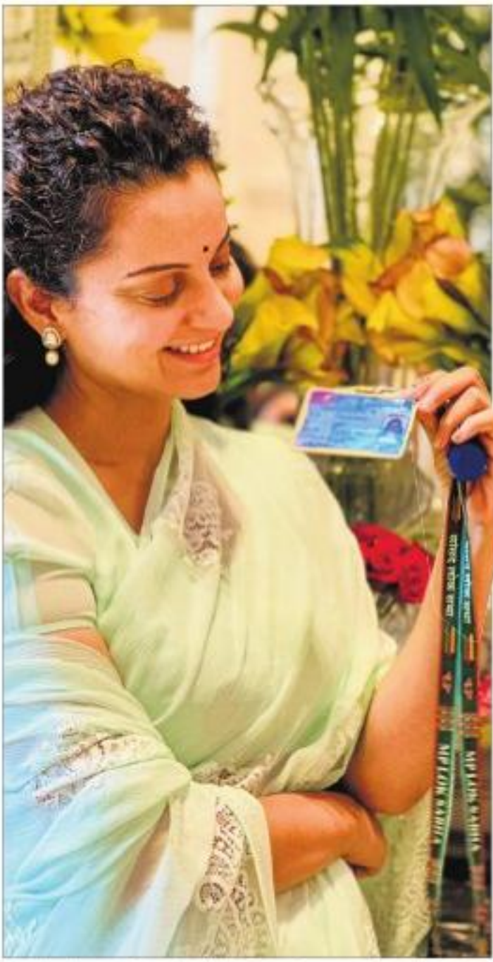
Newly elected BJP MP Kangana Ranaut after the registration process of members of the 18th Lok Sabha.