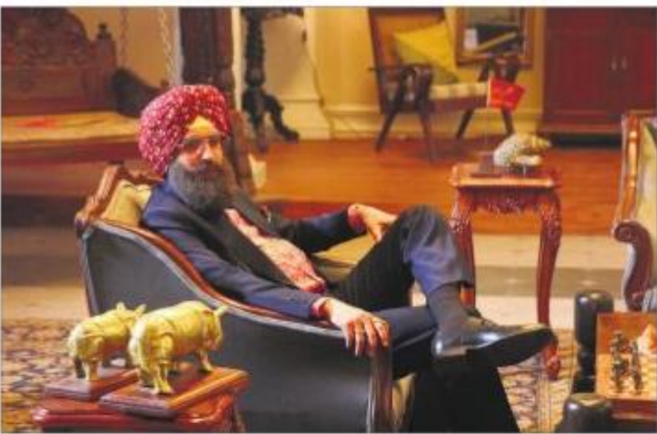
Massey plays a crime reporter, who specialises in sting operations.

n't be wrong to say that they have actually failed here. It's hard for a viewer to see them in a below-average script after a better written and executed project. Among the star cast, only Sunil Grover has a well-etched-out character of a 'drunkard beggar who has a thing for poetry'. He has also been given an interesting backstory and, to our surprise, as the film leaves