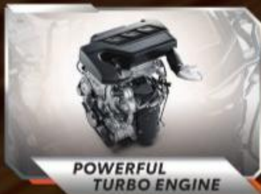
POWERFUL TURBO ENGINE