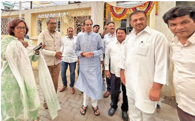
Shiv Sena (UBT) president Uddhav Thackeray with Leader of Opposition in the state Assembly Vijay Wadetiwar, newly-elected Congress MP Varsha Gaikwad and other party leaders during a meeting at Thackeray's residence in Mumbai Friday.

Mr Gandhi apologised to the court on Friday for seeking exemption from personal appearance in the last two hearings. The court accepted his apology and granted him bail on a surety of ₹75 lakhs.