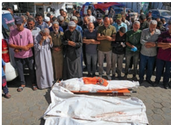
Palestinians pray for people killed in the Israeli bombardment of the Gaza Strip at a hospital in Deir al Balah on Friday.

Hamas said on Friday militants in Deir al-Balah shelled a house where Israeli troops were barricaded, killing some and