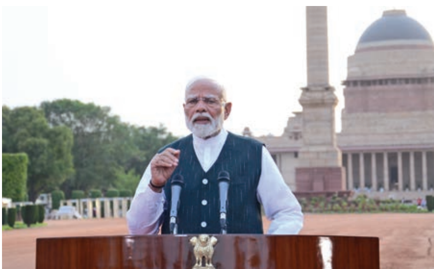
Prime Minister Narendra Modi addresses the media after his meeting with President Droupadi Murmu to stake claim to form the new government at the forecourt of the Rashtrapati Bhavan in New Delhi on Friday.

While Mr Nath was camping in Chhindwara to campaign for his son, Mr Singh was contesting from the Rajgarh LS seat.