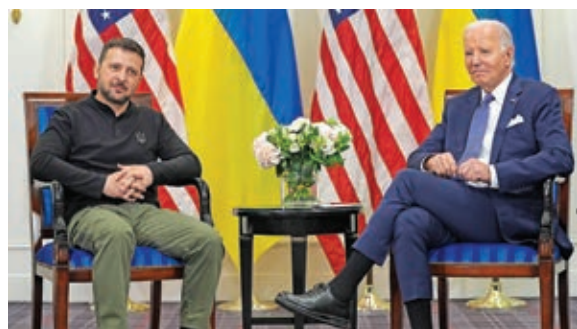
US President Joe Biden meets Ukrainian President Volodymyr Zelenskyy in Paris on Friday.