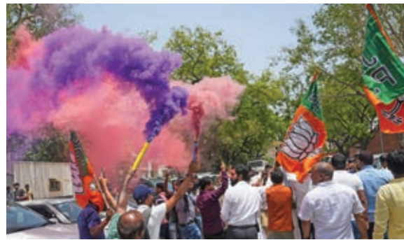
BJP supporters celebrate outside the new Parliament in New Delhi on Friday.

votes in 52 of the 70 Assembly segments spread across seven Lok Sabha constituencies, giving a wake-up call to the AAP.