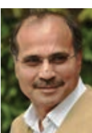
Adhir Ranjan Choudhury

Mr Choudhury claimed, "It is a rumour that the Congress high command is ignoring and sidelining me after my defeat in the polls. Our party president Mullikarjun Kharge has telephoned and invited me to join a crucial working committee meeting on Saturday in New Delhi. I will attend the meeting as a