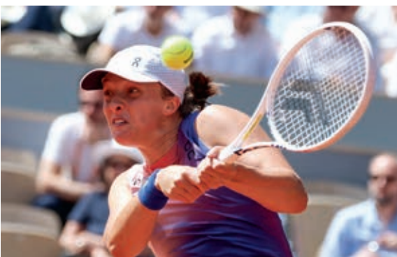
Poland's Iga Swiatek returns to USA's Coco Gauff during their semi-final match of the French Open at Roland Garros in Paris on Thursday.

Swiatek has now won 11 of her 12 matches against Gauff, all in straight sets, and could become only the fourth woman to win four Roland Garros titles in the