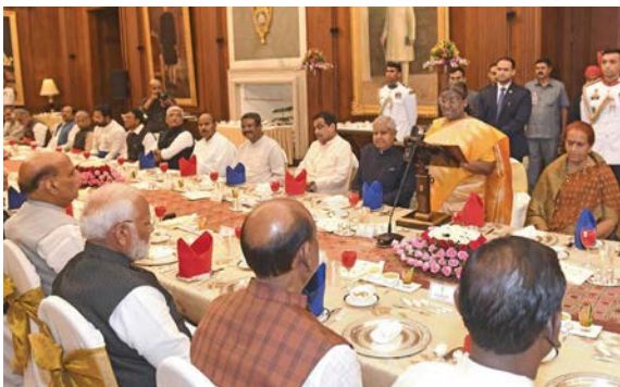
President Droupadi Murmu speaks at a dinner hosted by her for the outgoing Union council of ministers at Rashtrapati Bhavan in New Delhi on Wednesday.

▶ THE BJP-LED NDA pushed through the majority mark of 272 in the Lok Sabha by winning 293 seats. The BJP won 240 seats on its own, 32 seats less than a simple majority.