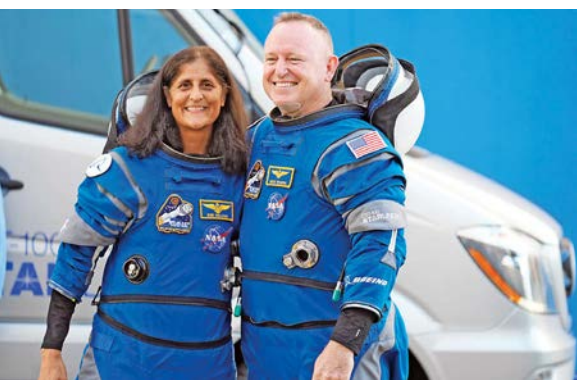
Nasa astronauts Suni Williams, left, and Butch Wilmore pose for a photo.