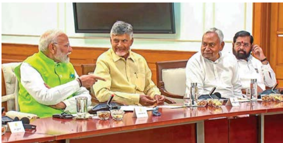
Prime Minister Narendra Modi with TDP president N. Chandrababu Naidu, JD(U) chief Nitish Kumar and Shiv Sena (Shinde) supremo Eknath Shinde during a meeting at 7, Lok Kalyan Marg in New Delhi on Wednesday.