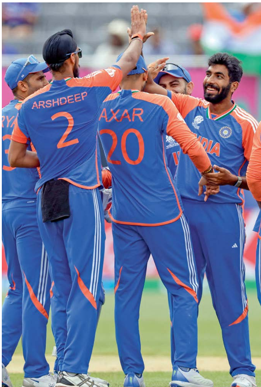
Jasprit Bumrah (right) celebrates after taking the wicket of Ireland batter Harry Tector during their T20 World Cup match at the Nassau County International Cricket Stadium in New York on Wednesday.

Earlier, Indian bowlers were right on target, pinning down rival batsmen and cramping them for space regularly. Hardik Pandya was the most successful, taking three wickets while conceding 27 runs in his four overs - he was also on a hat-trick. Jasprit Bumrah was next