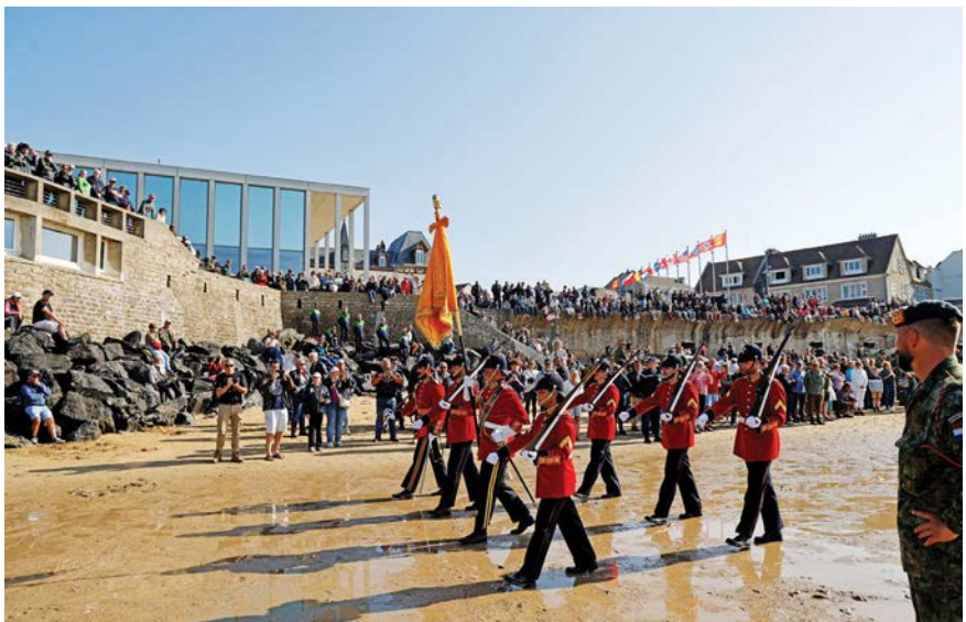
Netherlands troops take part in a ceremony on the beach at Arromanches-les-Bains, northwestern France, on Wednesday. The ceremony is a part of the ‘D-Day’ commemorations marking the 80th anniversary of the World War II Allied landings in Normandy.