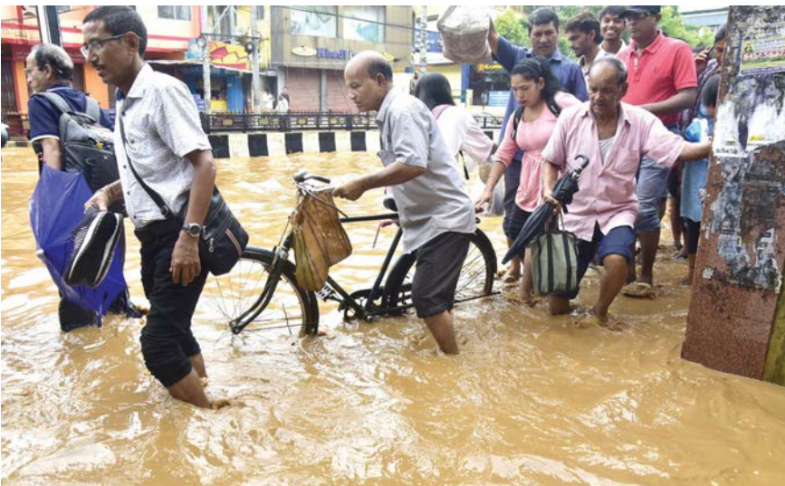
People wade through a waterlogged street after rain at Chandmari area in Guwahati on Wednesday.

Mr Modi also thanked Ukrainian President Volodymyr Zelenskyy for his congratulatory message and said India "will continue to support peace, security and prosperity for everyone in the region", an obvious reference to ongoing global efforts to resolve the Russia-Ukraine conflict.