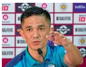
Sunil Chhetri at a press conference in Kolkata on Wednesday.

The 39-year-old Chhetri will hang his boots at the end of this match and would like to ensure that the team enters the final-18 stage of the World Cup qualifiers for the first time.