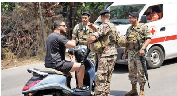
Lebanese soldiers speak to a motorcyclist as they stand guard on a road that leads to the US Embassy in Beirut, on Wednesday. — AP

The knife attack by a 25-year-old originally from Afghanistan injured six people. — Reuters