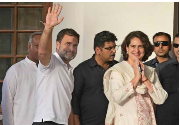
Congress leaders Rahul Gandhi and Priyanka Gandhi Vadra arrive for the INDIA bloc meeting in New Delhi on Wednesday.

Thanking the INDIA bloc partners, the Congress president added, “I welcome all INDIA bloc partners. We fought well, fought unitedly and fought resolutely.”