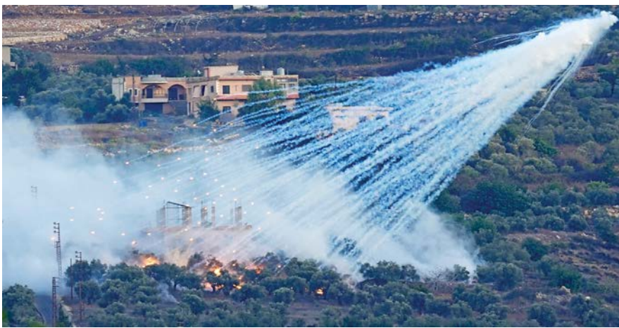
A shell that appears to be white phosphorus fired by the Israeli artillery explodes over a house in al-Bustan, a Lebanese village along the border with Israel.

At least 44 Palestinians have been killed in Israeli military strikes in central Gaza Strip areas since Tuesday, health officials in