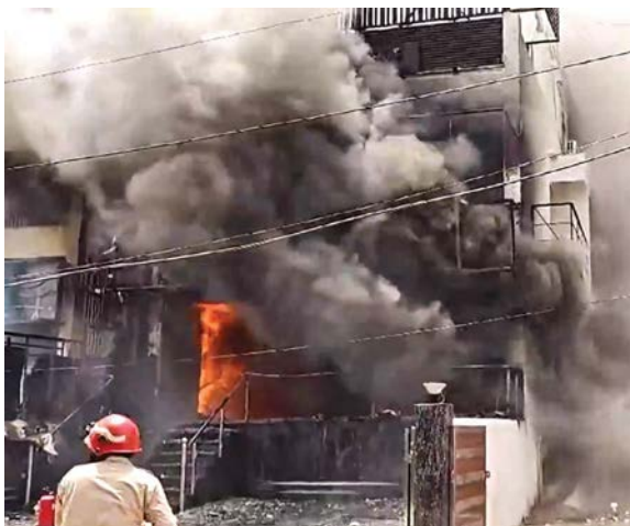
Firefighters douse a fire which broke out at an eye hospital in Lajpat Nagar on New Delhi on Wednesday.

The call regarding the fire at Eye7 Chaudhary Eye Centre on Ring Road was received at 11.30 am and 12 fire tenders were rushed to the spot. Later, more fire tenders were pressed into service, officials said. They said those inside