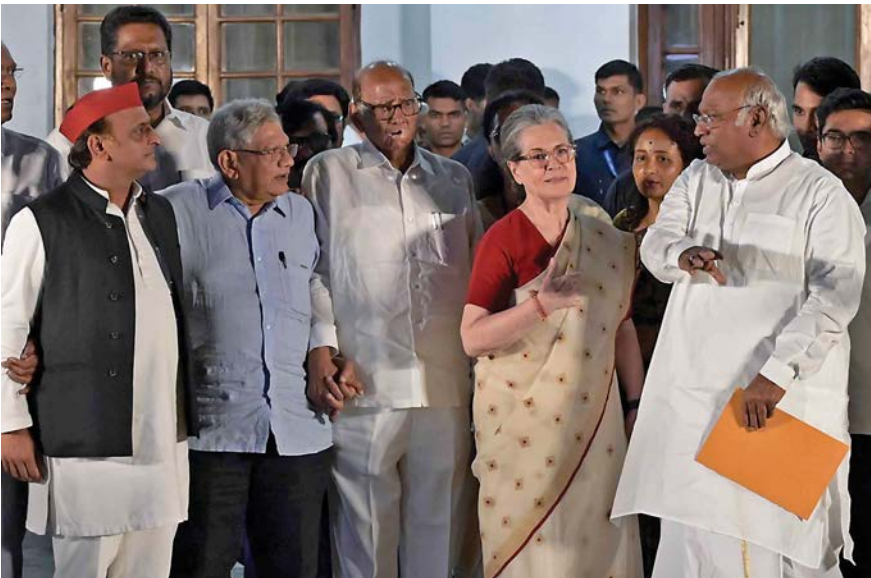
Congress president Mallikarjun Kharge with Sonia Gandhi, NCP chief Sharad Pawar, CPI(M)'s Sitaram Yechury, SP chief Akhilesh Yadav and others after the INDIA bloc leaders' meeting in New Delhi on Wednesday.

Polls currently give centre-left Labour a double-digit lead. To win, Mr Starmer must persuade voters who previously backed the Tories that Labour can be trusted with the UK's economy, borders and security.