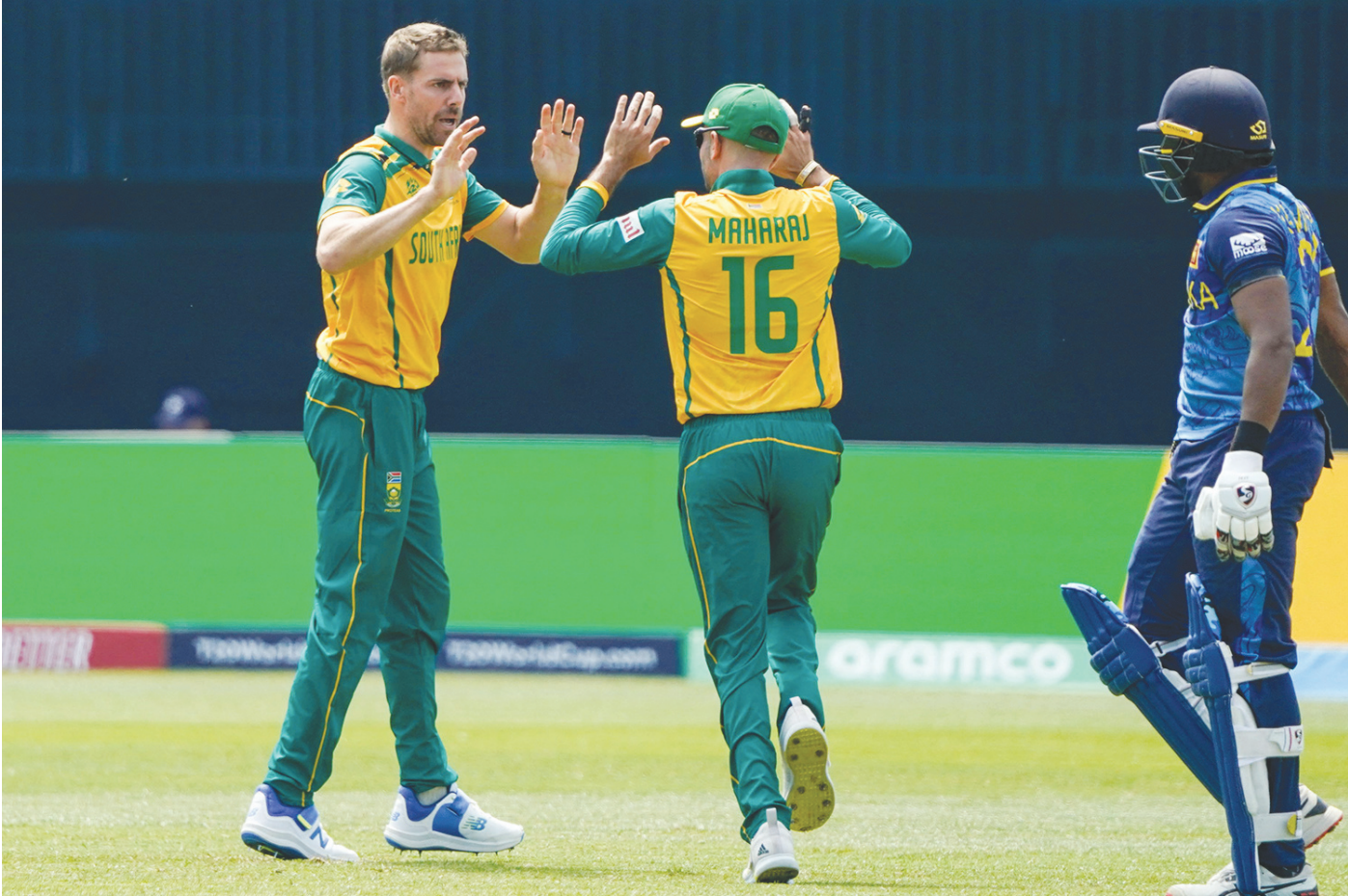
South Africa's Anrich Nortje (left) celebrates with teammate Keshav Maharaj after Sri Lanka's Kamindu Mendis (right) is dismissed during the ICC World Cup 2024, Group D match at Nassau County Stadium in East Meadow, New York, yesterday.

SRI LANKA'S TOTAL OF 77 THEIR LOWEST IN ALL T20 CRICKET