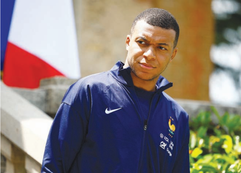
Kylian Mbappe will earn 35mn euros a season, according to reports in Spain.

Mbappe had verbally agreed to move to Real in February and then announced