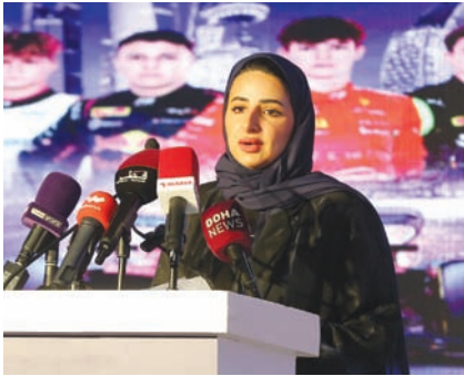
Dr Buthaina al-Janahi, Head of Communication at Qatar Tourism speaks at the ceremony yesterday.

Formula 1 has also announced two additional support races that will add to the excitement of the three-day extravaganza: the F1 Academy. This highly competitive all-female racing series is designed to nurture and propel young female drivers towards higher echelons of competition. It not only showcases the exceptional talent and skill of these athletes but also highlights the fierce