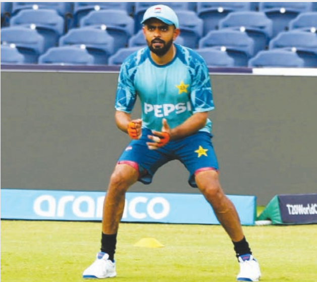
Pakistan captain Babar Azam gets ready for catching practice during a team training session in Dallas, Texas, yesterday. Pakistan, champions in 2009, take on hosts the USA in their first match on Thursday at the T20 World Cup 2024.