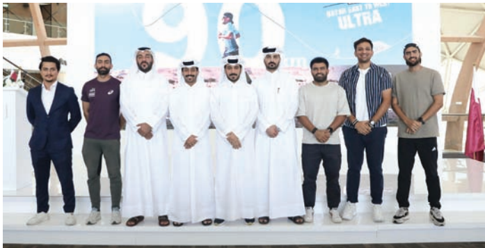
Officials of Qatar Sports For All Federation (QSFA) and sponsors at the end of a press conference held to unveil details of Qatar East to West Ultramarathon 2024.