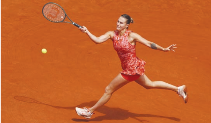
Belarus' Aryna Sabalenka plays a forehand return to US' Emma Navarro during their French Open match in Paris yesterday.

Serbian star took a 2-0 advantage in the fifth, but his opponent rallied to level. Djokovic was left covered in clay after a nasty tumble, sarcastically saying: "Well done supervisors,