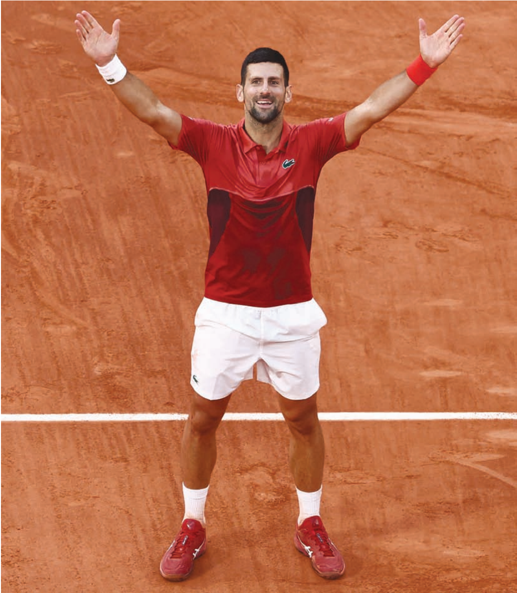
Serbia's Novak Djokovic celebrates after winning his French Open fourth round match against Argentina's Francisco Cerundolo at the Roland Garros Complex in Paris yesterday.

complaining the court was too slippery, before edging to the cusp of a famous win by forging 4-2 in front in the fourth. But, seemingly from nowhere, Djokovic dug deep to break and