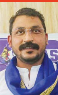
CHANDRASHEKHAR (ASP-KANSHI RAM)