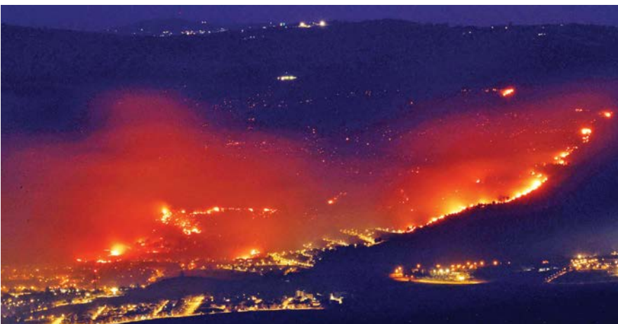
Fires burn as a result of rockets launched from Lebanon into northern Israel, next to the city of Kiryat Shmona near the Lebanon border, on Tuesday.

“We have yet to see a very clear position from the Israeli government towards the principles laid out by Biden,” foreign ministry spokesman Majed al-Ansari said, adding there was no “concrete approval” from either side.