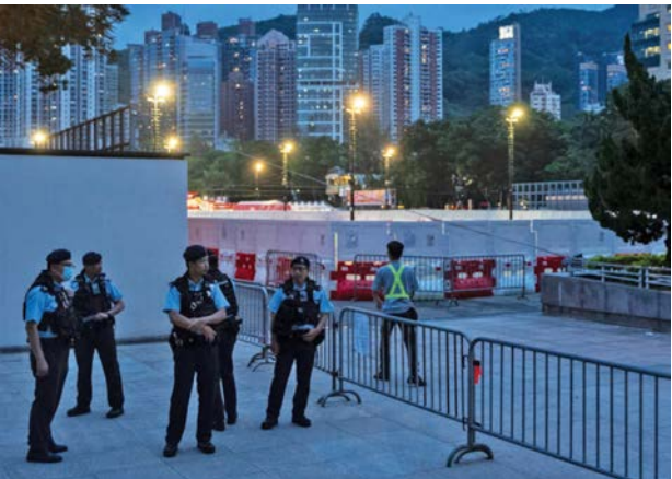
Police officers stand guard near Victoria Park, the city's venue for the annual 1989 Tiananmen massacre vigil, on the 35th anniversary of China's Tiananmen Square crackdown in Hong Kong, on Tuesday.