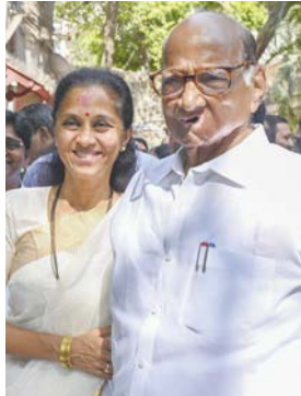
NCP chief Sharad Pawar with Supriya Sule in Mumbai on Tuesday.

With their stellar performance, Sharad Pawar and Mr Thackeray have also proved that they enjoy more confidence among their party supporters than Ajit Pawar and