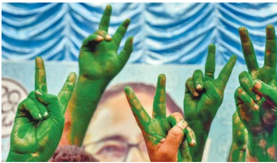
TMC supporters flash victory signs during the counting of votes for the Lok Sabha elections in West Bengal's Murshidabad on Tuesday.

In the Lok Sabha polls, the 29 seats captured by chief minister Mamata Banerjee's party include Jangipur, Berhampore, Murshidabad, Krishnanagar, Barrackpore, Barasat, Basirhat, Dum Dum, Kolkata North, Kolkata South, Joynagar, Mathurapur, Diamond Harbour, Jadavpur, Howrah, Uluberia, Jhargram, Midnapore, Ghatatal, Bankura, Bardhaman-Purba,