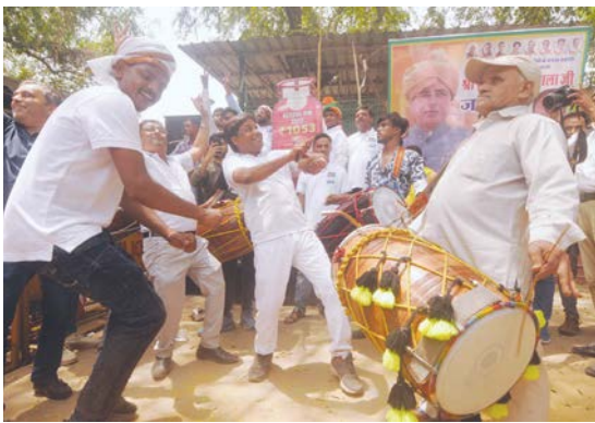
Congress party supporters celebrate at the AICC headquarters in New Delhi on Tuesday.

A high-voltage campaign was led by Prime Minister Narendra Modi. The PM held eight mas-