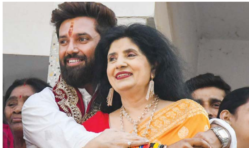
LJP (Ram Vilas) chief Chirag Paswan celebrates with his mother as he leads amid counting of votes for the Lok Sabha elections in Patna on Tuesday. The party won all the five seats it contested.

Senior Bharatiya Janata Party leader and state minister Kailash Vijayvargiya was the election in-charge of the cluster of four LS seats, including Chhindwara, in this election.