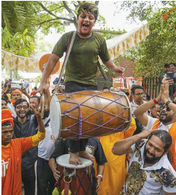
BJP supporters celebrate the party's lead in the Lok Sabha elections at party headquarters as counting of votes underway in New Delhi on Tuesday.

The AAP contested East Delhi, West Delhi, New Delhi, and South Delhi seats but could not win any seats. Its vote share, however, was 24.14 per cent as compared to 18.2 per cent in 2019 polls.