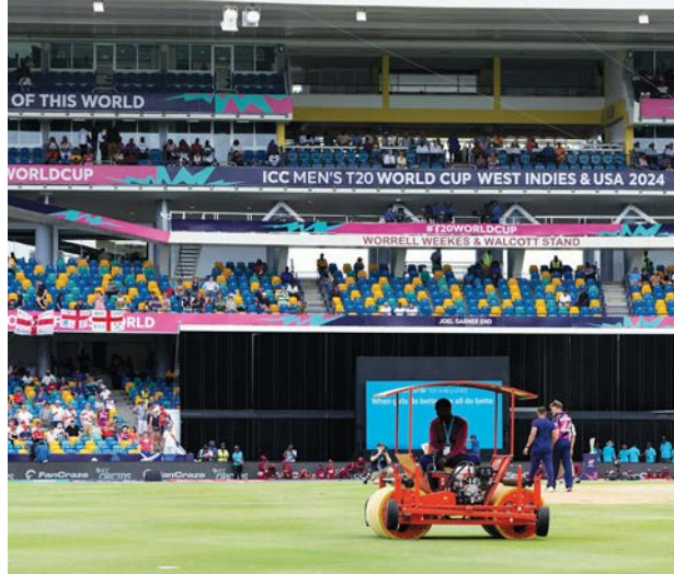
Ground staff mop the field after rain delayed the start of the match between England and Scotland in the T20 World Cup at the Kensington Oval in Barbados on Tuesday.

India will play their opening Group A match of the World Cup against Ireland at the Nassau County International Cricket Stadium here on Wednesday before taking on Pakistan at the same venue on Sunday.