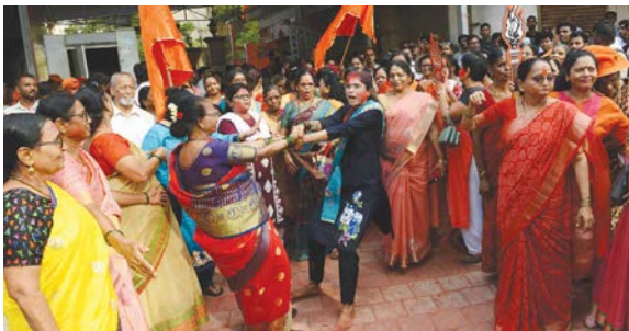
Shiv Sena supporters at Sena Bhavan in Mumbai.

Prime Minister Narendra Modi's roadshow did little to help the BJP retain its seats in Mumbai, the financial capital of the country, with the INDIA bloc winning four seats. Of the six seats in Mumbai, the BJP only managed to retain the North Mumbai seat, represented by Union minister Piyush Gopal. Four seats were won by the Shiv Sena (UBT) and the Congress. Eknath Shinde-led Shiv Sena candidate Ravindra Waikar won the Mumbai North West constituency. On May 15, PM Narendra Modi held a grand road-