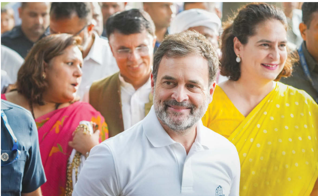
Congress leaders Rahul Gandhi, Priyanka Gandhi Vadra, Supriya Shrinate, Pawan Khera and others at the party headquarters in New Delhi on Tuesday.

"But if the AAP and the Congress contest the state polls together, the two can easily sweep the next Assembly polls," a senior AAP functionary told this newspaper, adding, "It is too early to comment on this matter. First, let's see how politics shapes in the near future."