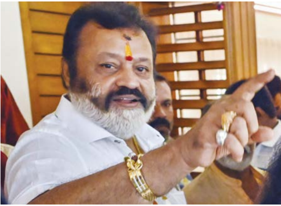
BJP candidate from Thrissur constituency Suresh Gopi celebrates as he leads in the Lok Sabha elections on the day of counting of votes in Thiruvananthapuram on Tuesday.

The BJP on Tuesday created history in Kerala by opening its account, with its candidate and Malayalam film actor Suresh Gopi registering a stupendous victory in Thrissur Lok Sabha constituency. Kerala voters, finally, removed the "no entry" board for the BJP, with Prime Minister Narendra Modi's overdrive helping the party increase its vote share by more than two per cent. The BJP victory by a margin of 74686 votes in Thrissur, which was the sitting seat of UDF, is quite significant considering the fact that all the seven Assembly segments in the constituency are with the ruling LDF. The saffron party had drawn a meticulous plan to wrest the Thrissur seat from the Congress. Prime Minister Narendra Modi visited Thrissur at least thrice, held public meet-