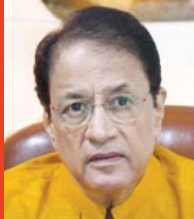
ARUN GOVIL (BJP)