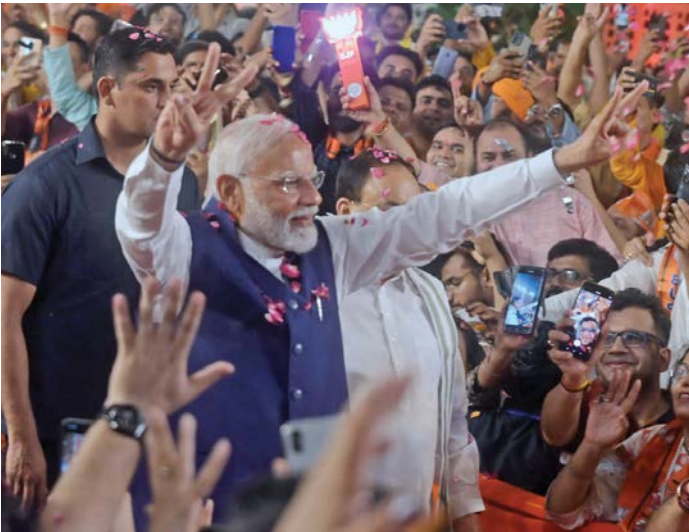
Prime Minister Narendra Modi welcomed and greeted by the supporters upon his arrival at the party headquarters after Lok Sabha poll results in New Delhi on Tuesday.

Also, the BJP leadership and its election strategy failed to counter the Opposition's main