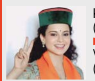
KANGANA RANAUT (BJP)

● Mandi, beats Vikramaditya Singh (Congress)