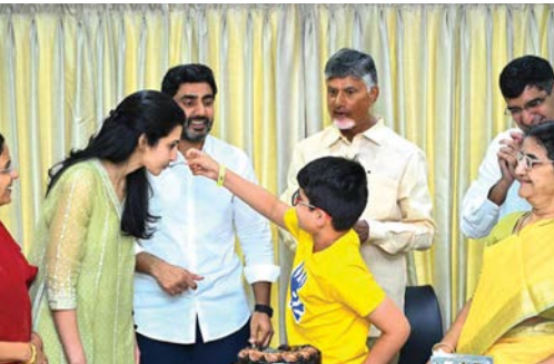
TDP chief Chandrababu Naidu, along with his family members, celebrates the party's victory in the polls at his residence in Undavalli, Amaravati.

With an exception for a few stray cases of violence, the counting of votes was peaceful. Political analysts say the alliance gained from some mistakes committed