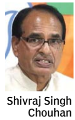
Shivraj Singh Chouhan

In an unprecedented development, the BJP has retained the Indore Lok Sabha constituency in Madhya Pradesh by "defeating" its "nearest rival" Nota (none of the above) by a record