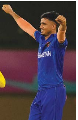
Afghanistan's Mujeeb Ur Rahman celebrates after the win against Uganda in the T20 World Cup match in Providence, Guyana on Monday.

done in the last few weeks, the way the openers started and the way our bowlers bowled - it was a great overall team effort," Rashid, who polished off the tail, added.