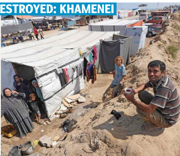
Displaced Palestinians gather outside their tents in Deir al-Balah in the central Gaza Strip, on Monday.

● A war monitor said 16 members of pro-Iran groups were killed in an Israeli strike near northern Syria's Aleppo early on Monday, with state media also reporting a deadly Israeli attack.