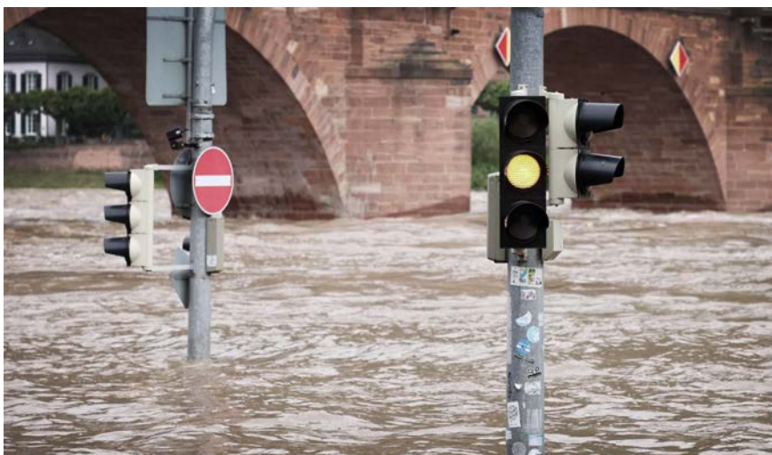
The historic part of Heidelberg is flooded during high water of the Neckar river in southwestern Germany, on Monday.