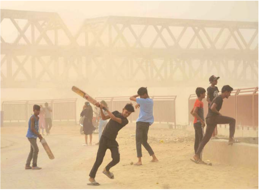
Children try to play cricket during a dust storm in Patna on Monday.

The accused, chargesheeted under various sections of the IPC, Unlawful Activities (Prevention) Act, Arms Act and Explosive Substances Act, "were found to have been engaged in ISIS row involving recruitment, training and propagation of the ISIS ideology, along with fabrication of explosives and improvised explosive devices (IEDs) and fund-raising for banned outfit", it said. — PTI