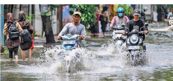
File picture of motorists passing through the inundated area in Cilincing, North Jakarta, on Jan. 31, 2024.

La Nina refers to the cooling of the ocean surface temperatures in large swathes of the tropical Pacific Ocean, coupled with winds, rains and changes in atmospheric pressure.