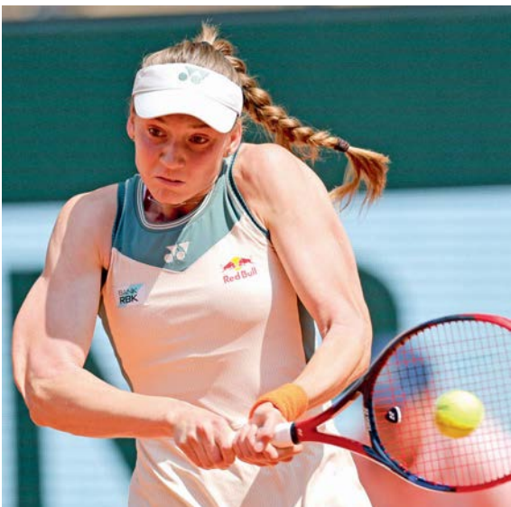
Elena Rybakina of Kazakhstan plays a shot against Ukraine's Elina Svitolina during their fourth round match of the French Open at the Roland Garros Stadium in Paris on Monday.

Alireza is on fourth spot with eight points in all and Caruana follows him with 6.5 points. Surprisingly, China's Ding Liren seems completely out of sorts with just 2.5 points thus far, needing a miracle to come back in the tournament. — PTI