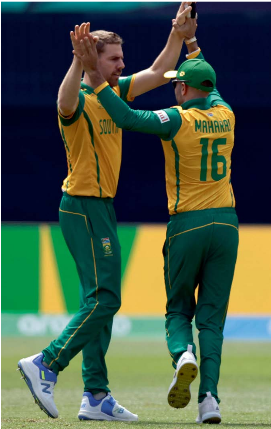
Anrich Nortje (left) of South Africa celebrates with a teammate after the dismissal of Sri Lanka batter Kusal Mendis during their T20 World Cup match at the Nassau County International Cricket Stadium in Westbury, New York, on Monday.

He hit another maximum but that was very much it as his side could not even last their full quota of overs with just three batters getting into double digits.