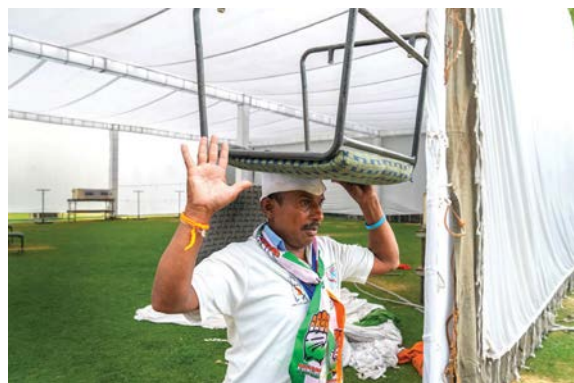
A Congress worker carries a chair during preparations on the eve of the results of the Lok Sabha polls at the AICC headquarter in New Delhi on Monday.

Digital monitors will be set up outside the counting centres to share the