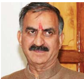
Sukhvinder Singh Sukhu

The Congress currently has 34 MLAs in its favour