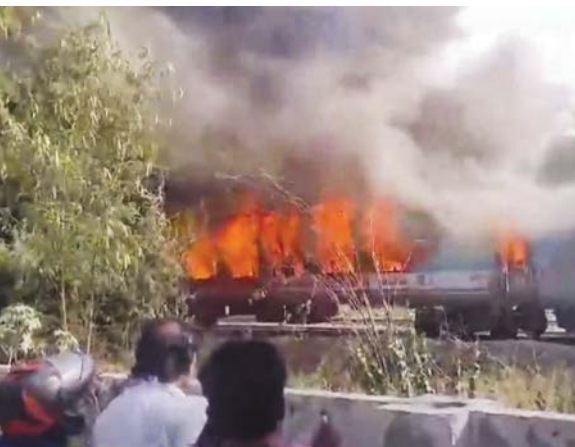
Smoke and flame billows out after a fire broke out in the Taj Express train in Sarita Vihar on Monday.