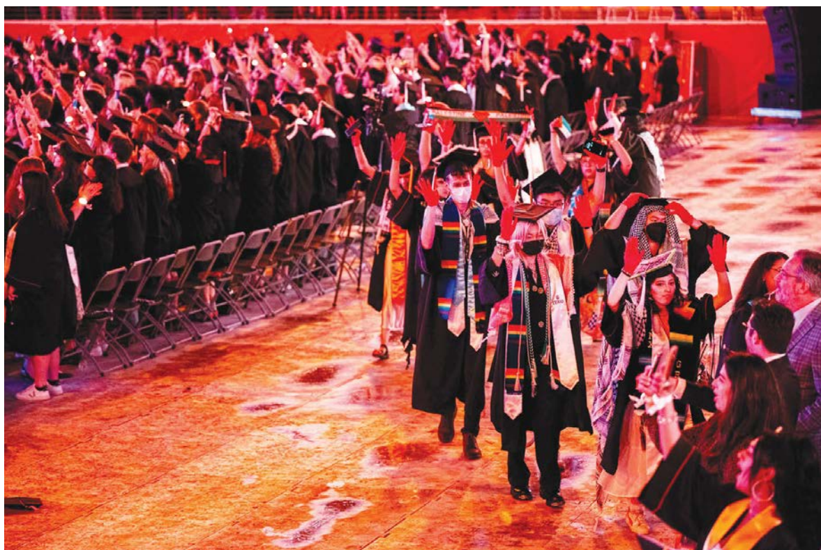
Graduate students walk out of commencement in protest against the war in Gaza at the DKR-Texas Memorial Stadium in Austin, Texas.

"Until now our data shows that 34 people died: 16 in Agam and 18 in Tanah Datar. At least 18 others are injured. We are still searching for 16 others."