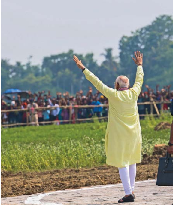
Prime Minister Narendra Modi greets people during a public rally at Arambagh in Hooghly district of West Bengal on Sunday.

Listing out the five guarantees, the Prime Minister said at Barrackpore in North 24 Parganas, "As long as Modi is there, no reservation on the basis of religion will be provided; no one can abolish SC, ST and OBC reservations; no one can stop you from worshipping Lord Ram and celebrating Ram Navami, no one can