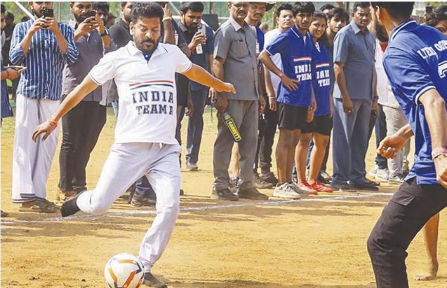
Telangana chief minister A. Revanth Reddy plays football with students of University of Hyderabad on Sunday.