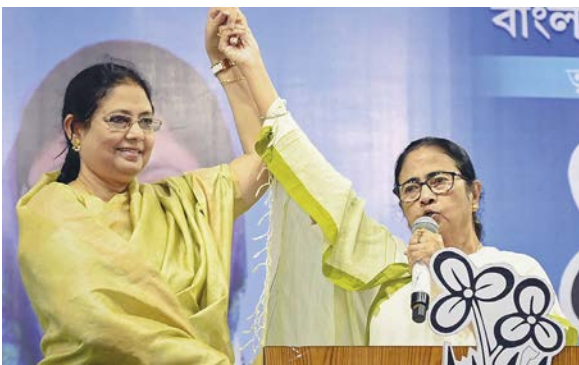
West Bengal chief minister Mamata Banerjee during a rally at Uluberia in Howrah district on Sunday.

According to the Trinamul Congress supremo, she had expected the PM to ask Mr Bose to resign from his constitutional post but he did not. Taking a dig at the PM, Ms Banerjee, who addressed a poll rally at Barrackpore in North 24 Parganas, said, “You should be ashamed for playing with the dignity of women in Sandeshkhali by paying them to file fake rape complaints. I will not listen to any lectures from such people who don’t respect women.”