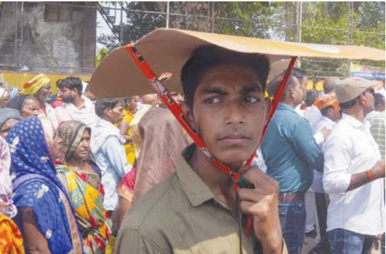
BJP supporters at Union home minister Amit Shah's public meeting in Rae Bareilly on Sunday.