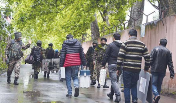
Polling officials carrying EVMs ahead of the fourth phase of Lok Sabha election in Srinagar on Sunday.

Meanwhile, all the three parties have accused police and other law