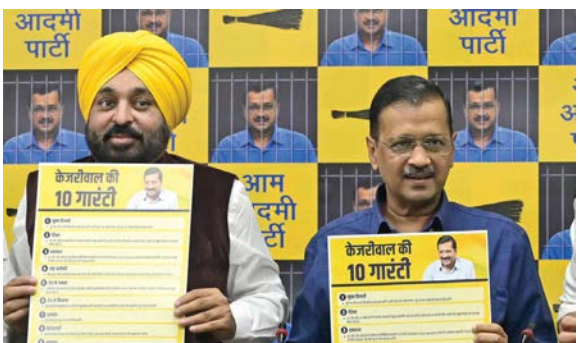
Delhi chief minister and AAP convenor Arvind Kejriwal with Punjab chief minister Bhagwant Mann during a press conference in New Delhi on Sunday.

Dubbing the BJP as the biggest reason behind "corruption" in the country, Mr Kejriwal said: "The system where honest people are being sent to jail and the corrupt are being protected will end..."