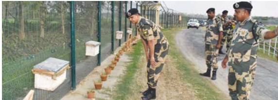
Beehives installed at the fence along the India-Bangladesh border under ‘beehives on border fence’ beekeeping model initiated by a BSF unit in Bengal on Sunday.

The Union home ministry has directed all Central paramilitary and allied forces to replicate “beehives on border fence”, a beekeeping model initiated by a Border Security Forces (BSF) unit in West Bengal to boost employment opportunities for the locals and create goodwill with them for strengthening security. The sources said the decision was made during a meeting on “scientific beekeeping and honey mission” that was chaired by the Union secretary at his office in April. The model, devised and implemented by the 32nd battalion of the