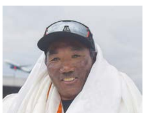
Kami Rita Sherpa

US-based expedition organising company Madison Mountaineering said of the Nepali climber: Madison had teamed up with Kami Rita to climb the summits of Everest, Lhotse, and K2 in 2014.