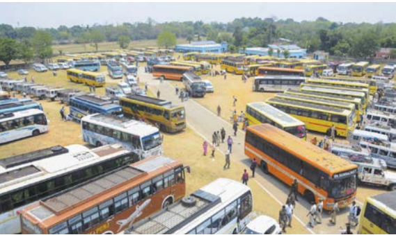
Vehicles on election duty parked at the Birsa College Stadium (converted into a distribution centre) on the eve of the fourth phase of Lok Sabha elections in Jharkhand’s Khunti district on Sunday.

Due to heat conditions in Telangana, polling time in certain Assembly segments of 17 parliamentary constituencies has been increased from 7 am till 6 pm to increase voters’ participation.