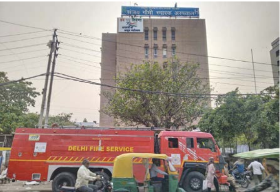
Sanjay Gandhi hospital after it received bomb threat in New Delhi on Sunday.

Security has been beefed up in all the hospitals in