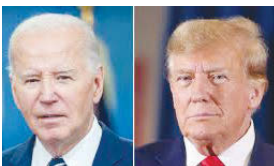
Joe Biden, Donald Trump

of 3,000 journalists, celebrities and politicians, Biden added, “Age is the only thing we have in common. My vice president actually endorses me.”