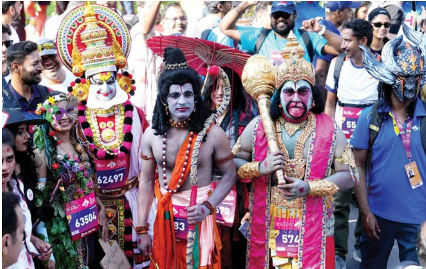
Participants wearing different costumes take part in "majja" run during a marathon in Bengaluru on Sunday.