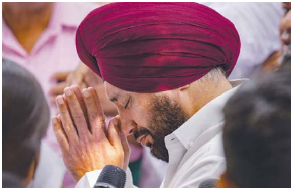
Former Delhi Congress chief Arvinder Singh Lovely during a press conference in New Delhi on Sunday.

As a scuffle broke out outside Mr Lovely's resi-