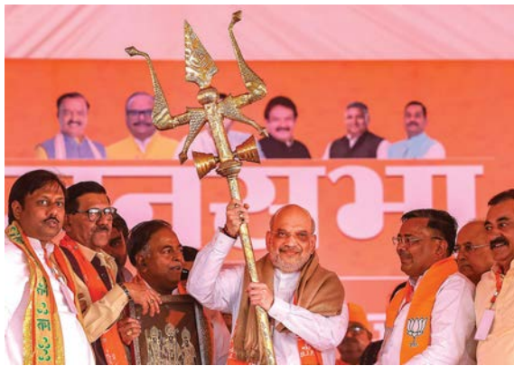
Union home minister Amit Shah during a public meeting in Uttar Pradesh's Mainpuri district on Sunday.

Taking a dig at the Congress leader Rahul Gandhi, he said, "Rahul Gandhi says that if the BJP gets 400 seats, it will remove reservation. I want to say that we had a full majority for two terms but Narendra Modi