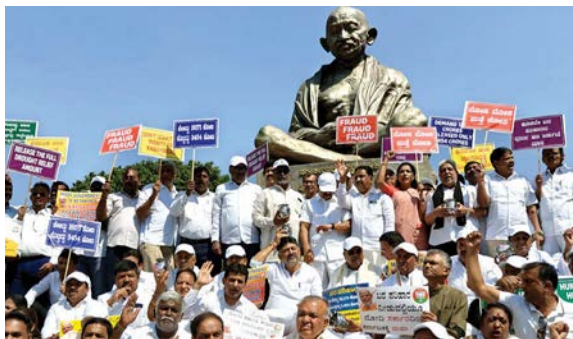
Karnataka chief minister Siddaramaiah, his deputy D.K. Shivakumar and others protest against the Centre over release of drought relief in Bengaluru on Sunday.

The party also criticised the Prime Minister for his political support to the JD(S) candidate from Hassan Lok Sabha seat, Prajwal Revanna, accused of sexually abusing women after several videos surfaced purportedly involving him. Using the opportunity to pin down the Bharatiya