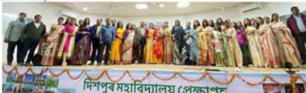
Faculty members and students on the occasion of college week prize distribution ceremony.

One can exit the programme after two-year course as well. In this case, the student will have to complete one extra Vocational / Skill course of 4 credits and can exit the programme. The student will get a Diploma. The minimum total credit requirements are 84 (and 4 credits extra for the exit Vocational / Skill course).