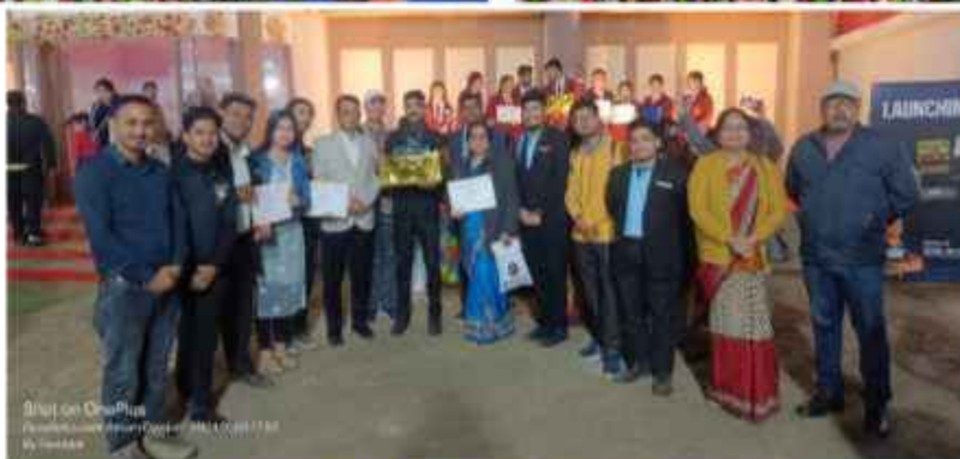
Participation in Assam Book Fair 2023