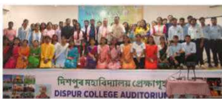
Sahitya Akademi sponsored Seminar organised In the college