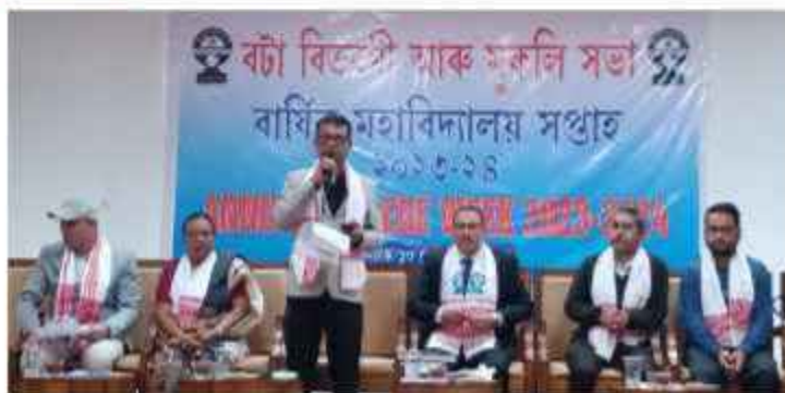
Prize distribution Ceremony of the College