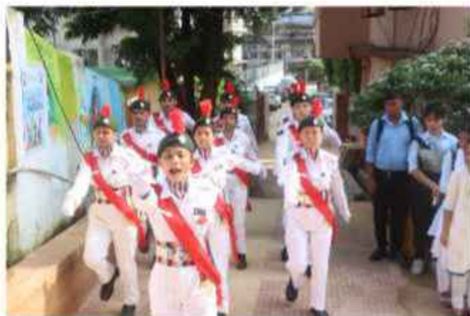
Celebration of 77th Independence Day