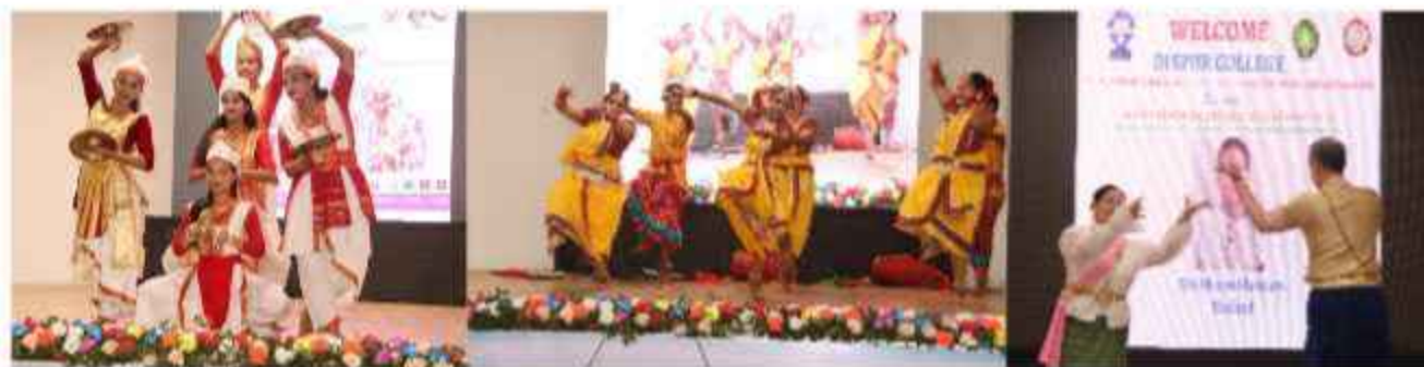
South East Asian Cultural Conclave