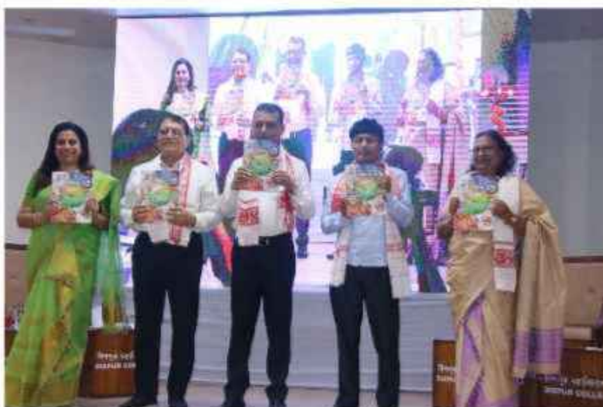
Release of “Dispurian” on 45th Foundation Day of college.