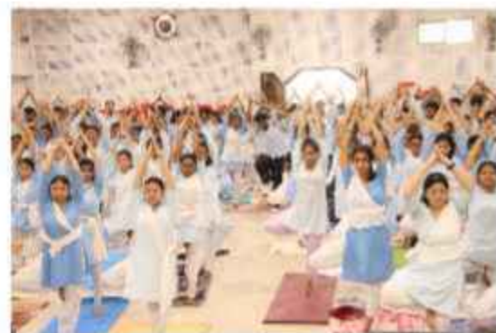
Observation of International Yoga Day