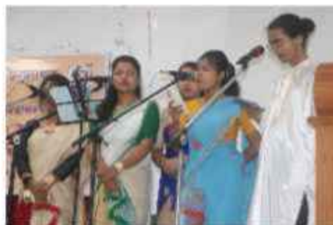
Celebration of Rabha Divas