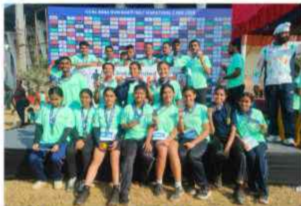
Participating in the Coal India Limited Half Marathon conducted by the Indian Army

Each student need to complete two courses of 4-credits each – one from English Usage and other from the group of MIL, especially designed for this purpose. These courses have to be taken during Semesters 1-2.