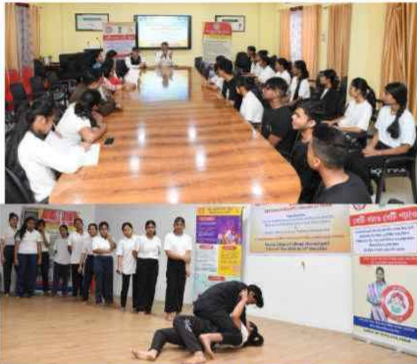
Self -defense training for women