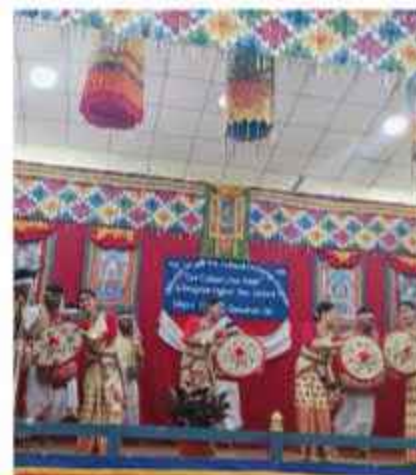
International Cultural Exchange Programme in Bhutan