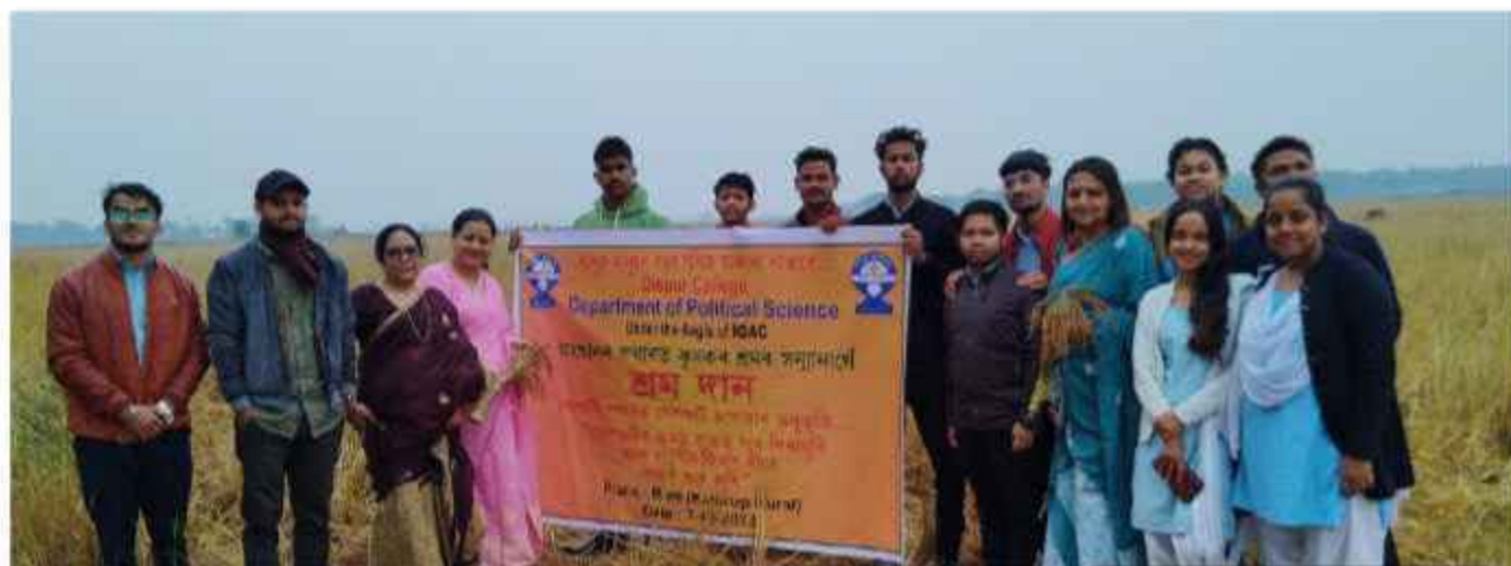
Experiential Learning/Community Service

The Digital India programme is a flagship programme of the Government of India with a vision to transform India into a digitally empowered society and knowledge economy. Dispur College has also adopted the same, and introduced Cashless Transaction, Leave Management System (LMS), Student Feedback System, Student Attendance, Office-Automation, Library-Automation (Web Opac, E-resource Centre, Government E- Market Place(GeM), PFMS, E-Admissions through Darpan and SAMARTH E-govt. portal.