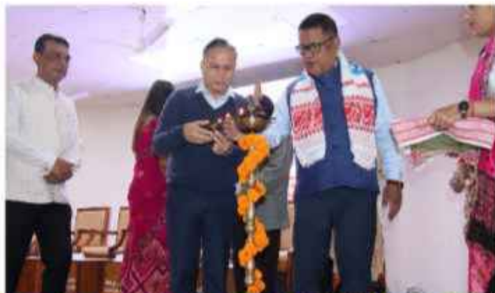
Hosting Teacher's empowerment programme on behalf of Dept. of Education, Govt. of Assam