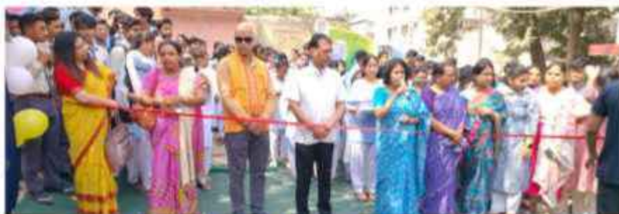
Celebration of International Women's Day