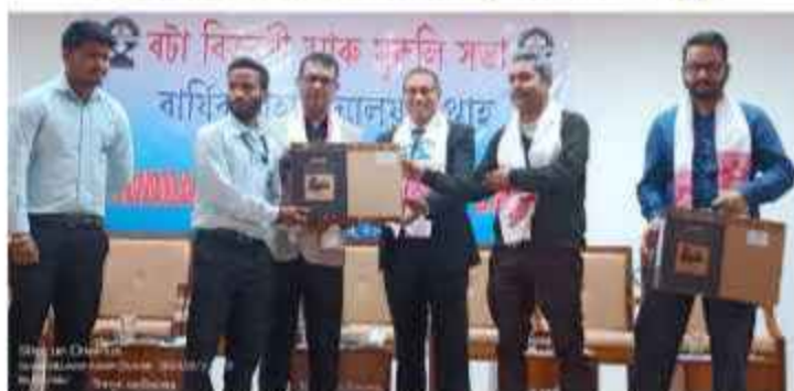
Distribution of Free Laptops to meritorious students