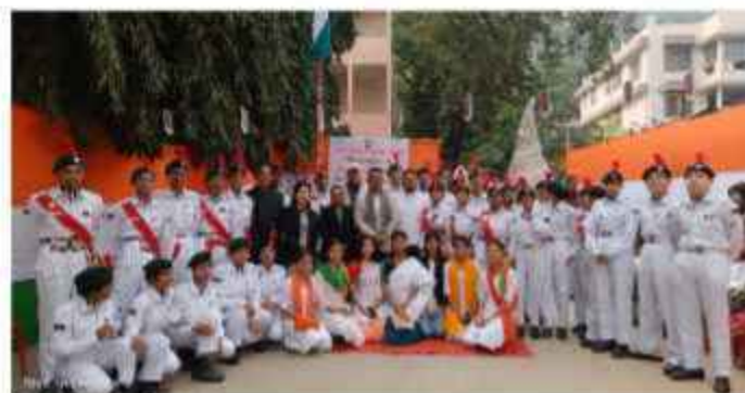
75th Republic Day Celebration