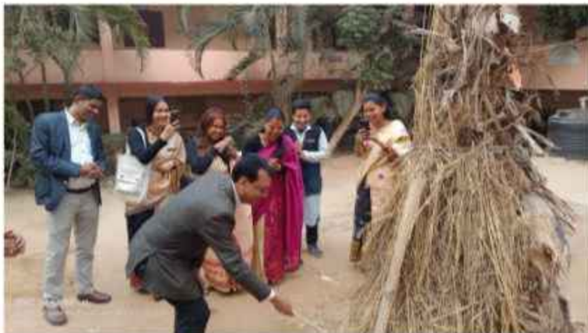
Celebration of Magh Bihu