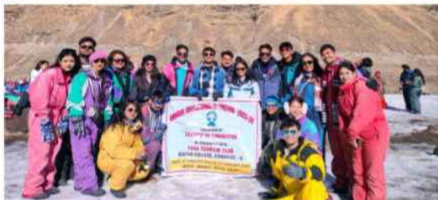
Excursion to Manali under YUVA Tourism Club