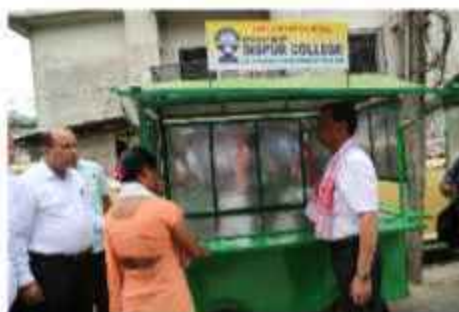
Distribution of four Wheeler "Employment on Wheel"