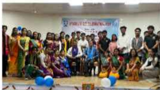
Freshmen Social organised by Dispur College Bodo Literary Society

Separate forms will be issued online for H.S. (Arts and Commerce) and B.A., B. Com., BBA, BCA.