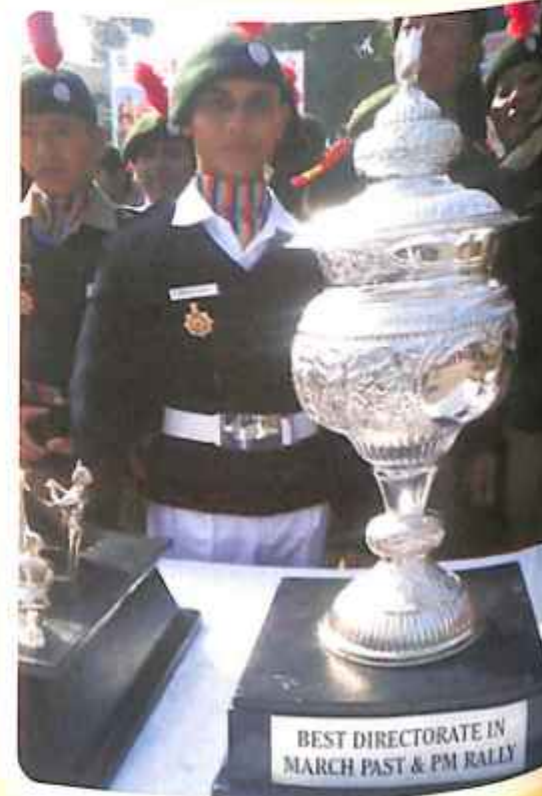
Best Directorate in March Past & PM Rally