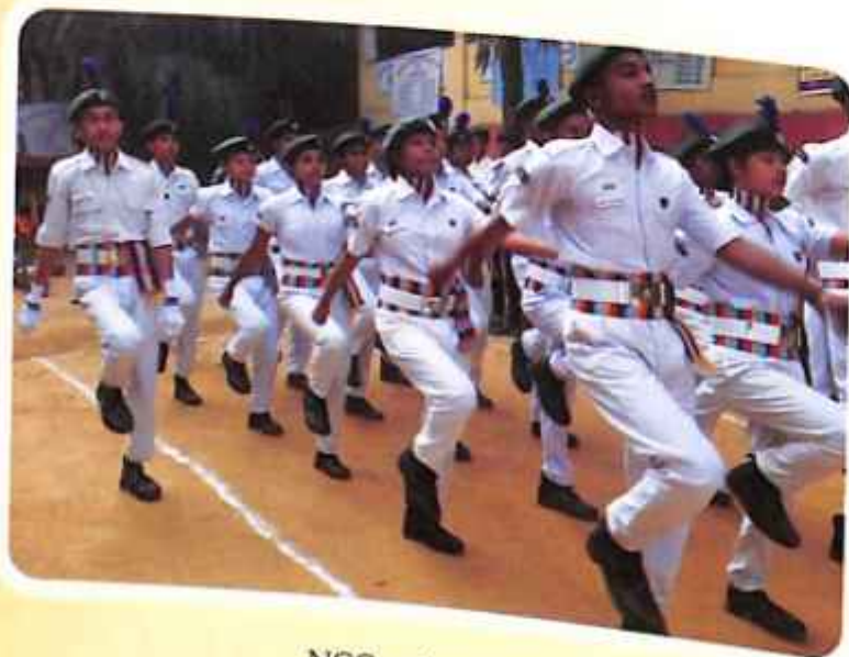
NCC cadets' drill