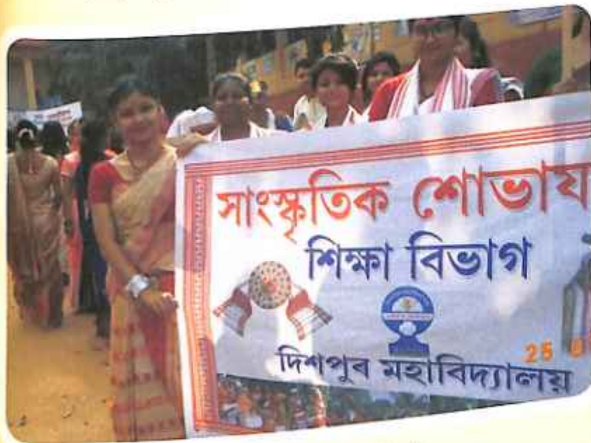
Activities of College Week

Admission will be on merit basis within the provision of government rules. However, in case of any dispute the decision of the principal shall be final and binding. The college authority reserves the right to refuse admission to anyone without giving any reason thereof. Selected candidate must take admission on the date of interview by paying necessary fees.