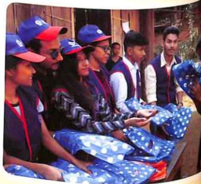
NSS volunteers' donation drive.