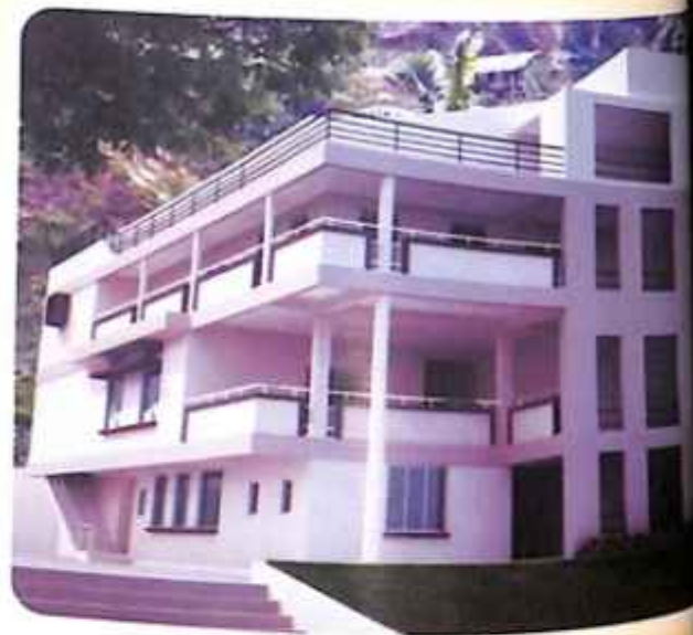
Proposed 3 storied building with Rooftop Auditorium