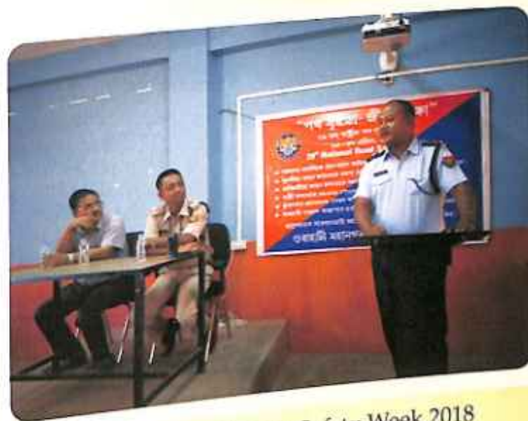
Celebration of Traffic Safety Week 2018