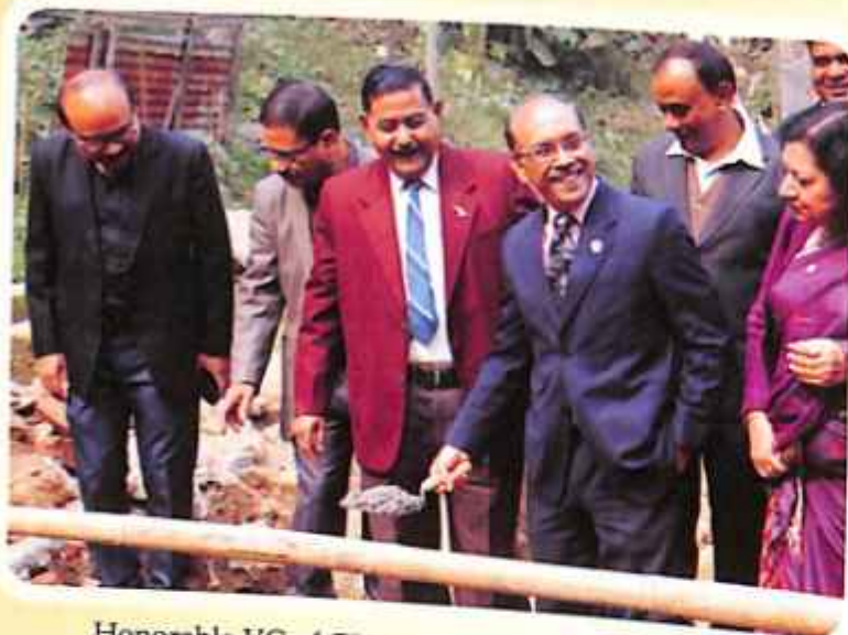
Honorable VC of GU laid the foundation stone of 3 storied building with Rooftop Auditorium