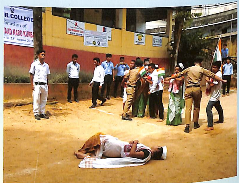
Scene from Street Play

Along with Cleanliness drive, Quiz Competition, Illumination of College Building, all Departments celebrated Azadi 70 Yaad Karo Kurbani by singing devotional songs and lecture sessions on Indian independence, sports competition, Prabhat Pheri, Flag hoisting on 15/8/16. Street play, Interaction with Ladies of Kasturiba Ashram regarding Indian Independence Floral tribute by students at the statue of Deshbhakta Tarun Ram Phukan. Organised lecture in collaboration with Events 2 Sportify on Job Opportunity in Sports in Independent India.