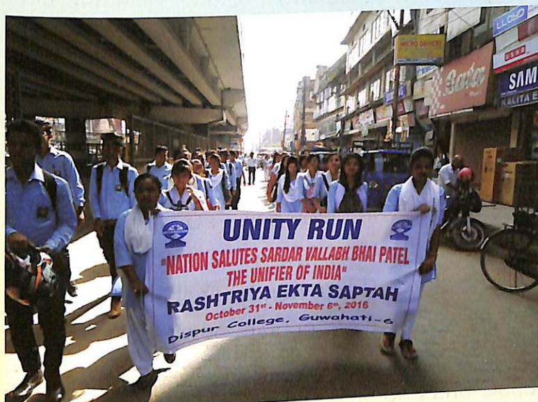
Unity Run on Rashtriya Ekta Saptah