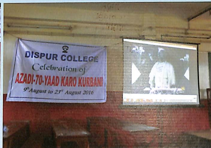
Audio- Visual presentaion on Life of Subhash Ch. Bose.